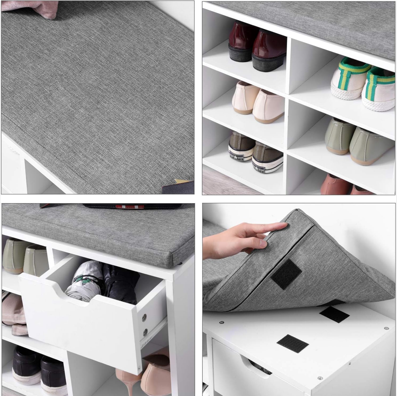
Image: A detailed view of the shoe bench's storage compartments, drawer, and cushioned seat.