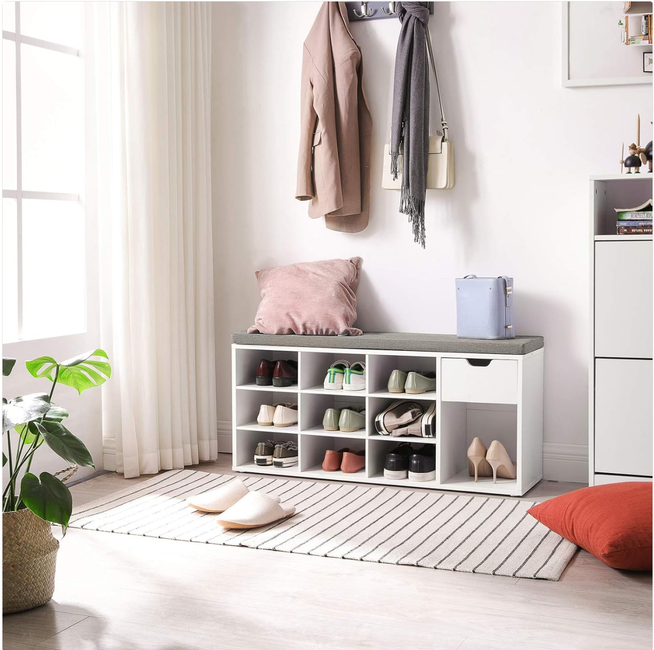
Image: The assembled shoe bench in a home environment, demonstrating its use.