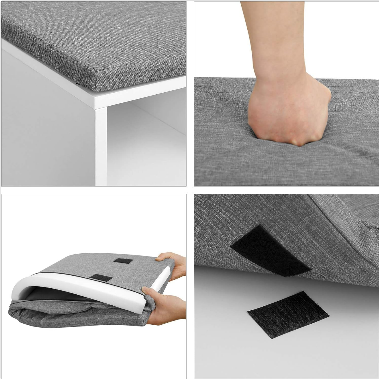
Image: Details of the cushion, highlighting its removable and washable nature with Velcro fasteners.