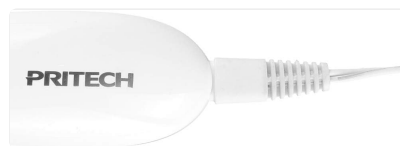
Image 3: Close-up view of the charging cable's connection point to the device.

The PRITECH charging cable, model HF-V050A1000, is a white USB cable designed for specific PRITECH devices. It features a standard USB-A connector on one end and a proprietary connector on the other, compatible with the PRITECH Rechargeable Callus Remover BCM-1138.