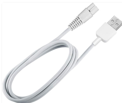
Image 1: The PRITECH Rechargeable Callus Remover Charging Cable (Model HF-V050A1000).