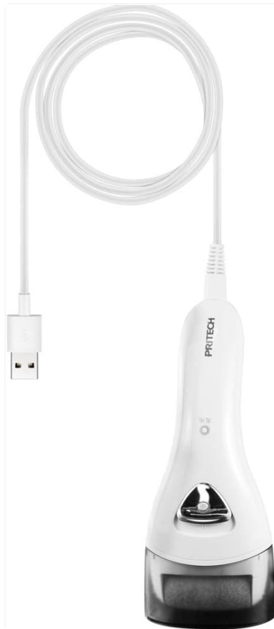
Image 2: The charging cable connected to the PRITECH Rechargeable Callus Remover.