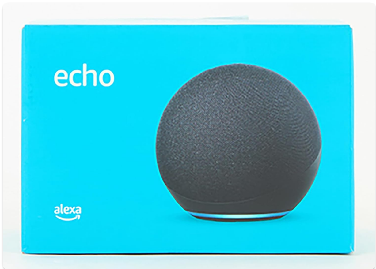
The retail packaging for the Echo (4th Generation) device.