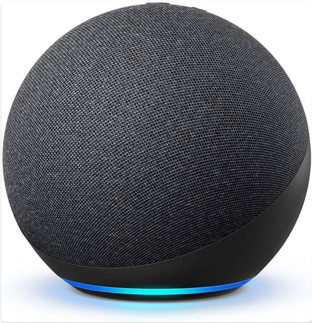
The Amazon Echo (4th Generation) International Version in Charcoal, featuring its spherical design and light ring.