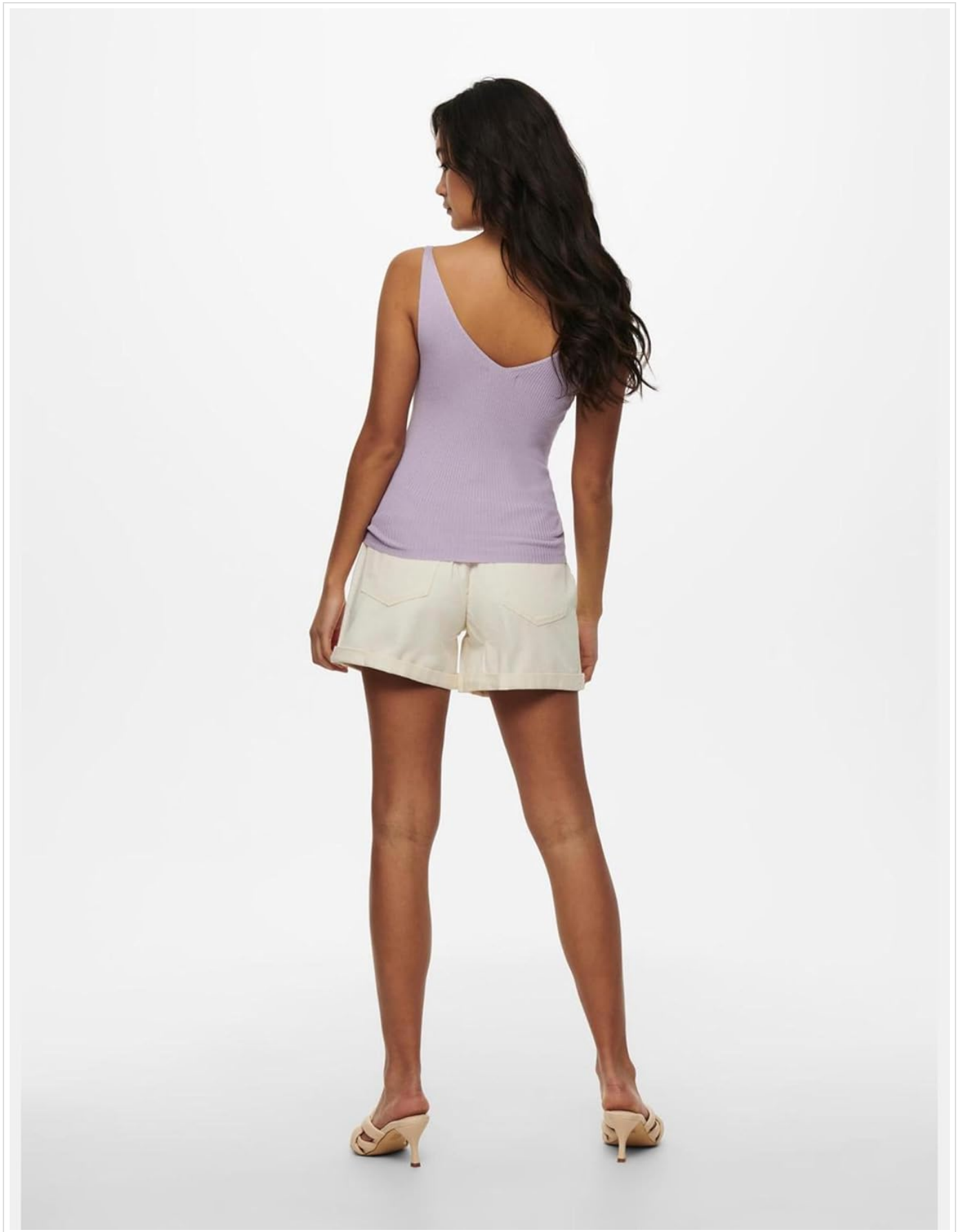
Figure 3.4: Model wearing the jumper, back view, demonstrating the fit.