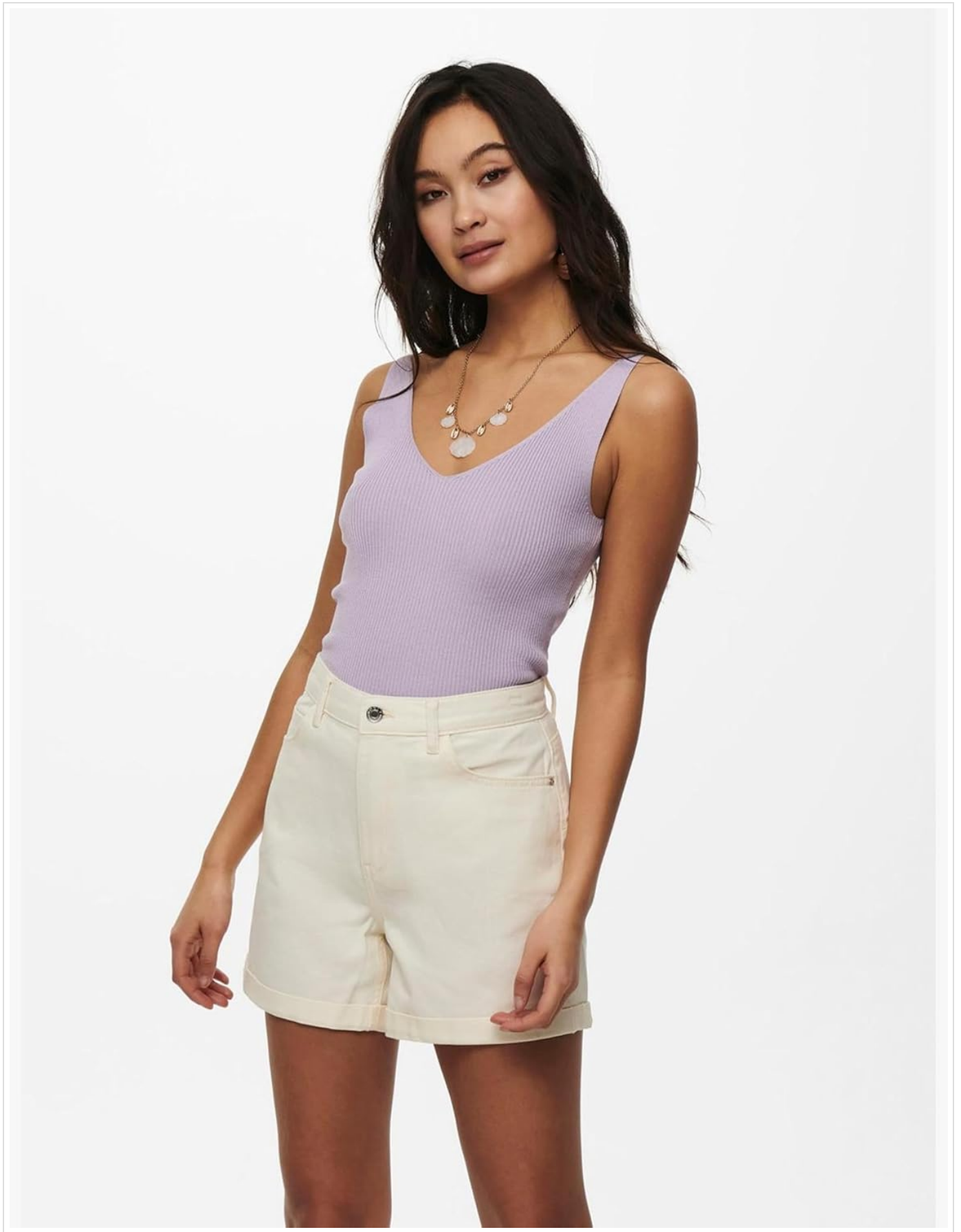
Figure 3.3: Model wearing the jumper, front view, paired with shorts.