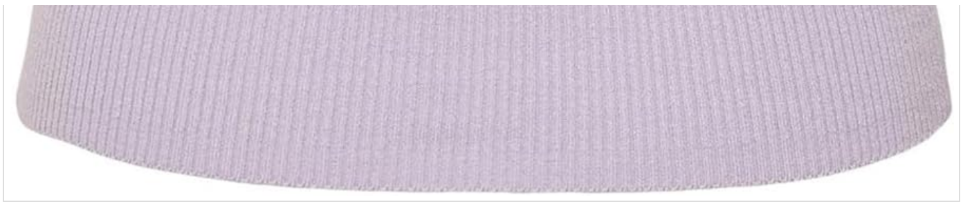
Figure 3.2: Back view of the JDY Women's Jumper.