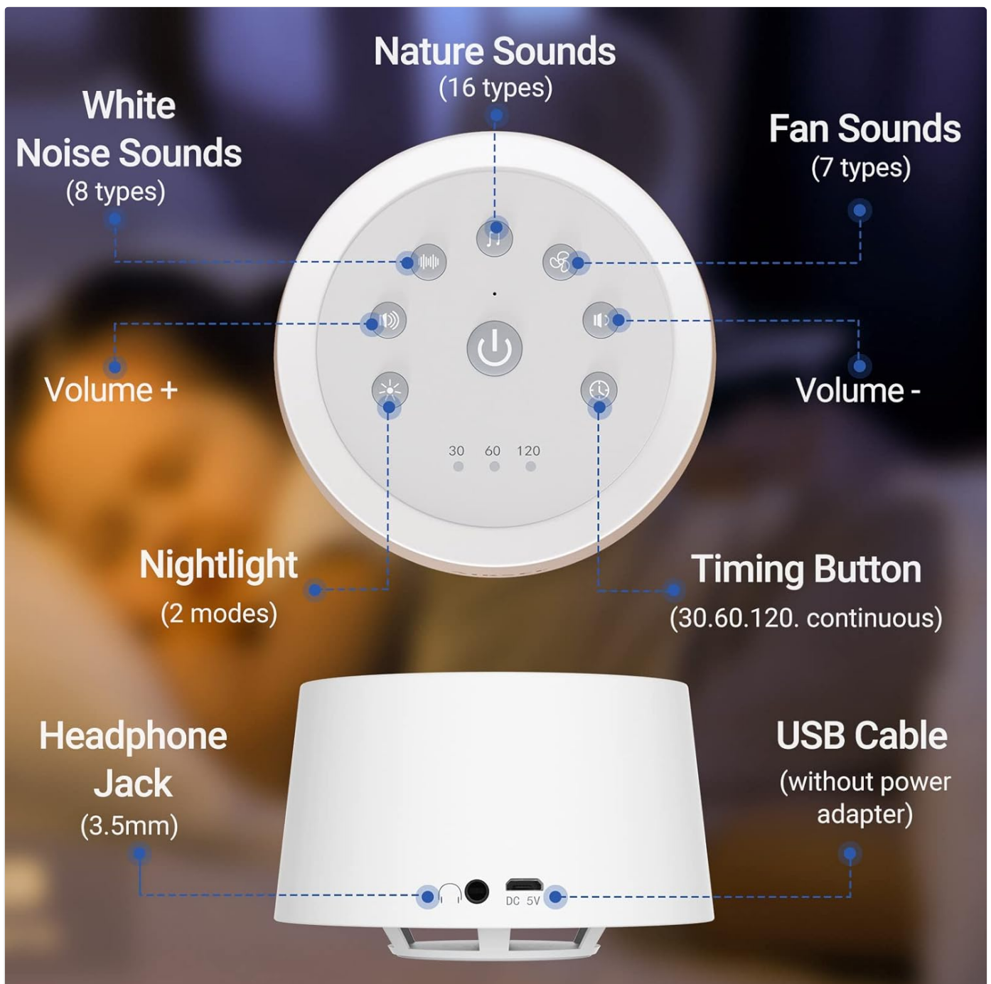
An annotated image showing the top control panel with buttons for sound categories (White Noise, Nature Sounds, Fan Sounds, Lullabies), volume control, night light, and timer. The side view highlights the headphone jack and USB charging port.