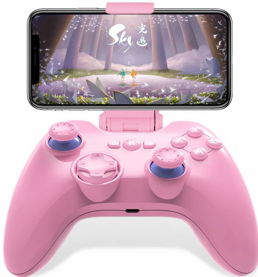
Figure 3.3: The PXN Speedy (6603) controller is shown with a smartphone securely mounted in its telescopic clip, displaying a game on the screen, ready for play.