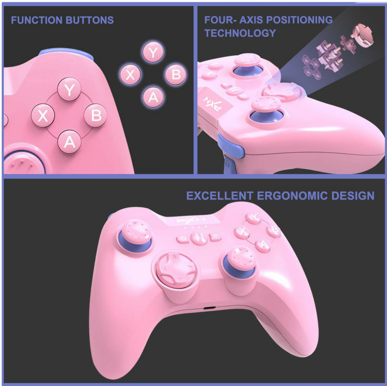
Figure 4.1: This image showcases the PXN Speedy (6603) controller's features, including its function buttons (ABXY), four-axis positioning technology for precise movement, and its excellent ergonomic design for comfortable handling.

controller's layout generally mirrors standard console controllers.