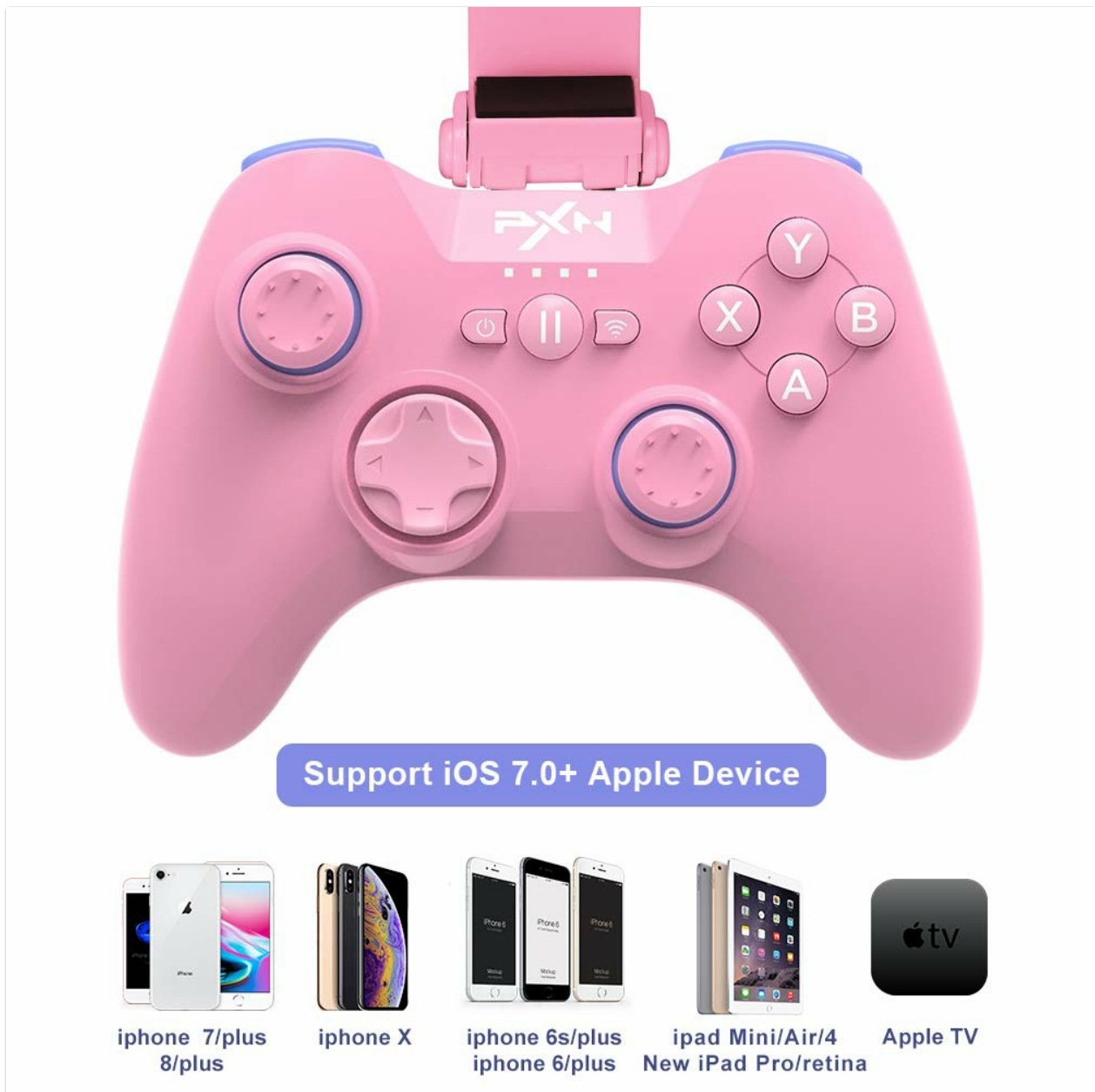
Figure 3.2: This image illustrates the compatibility of the PXN Speedy (6603) controller with various iOS devices, including iPhone 7/plus, 8/plus, iPhone X, iPhone 6s/plus, 6/plus, iPad Mini/Air/4, New iPad Pro/retina, and Apple TV.