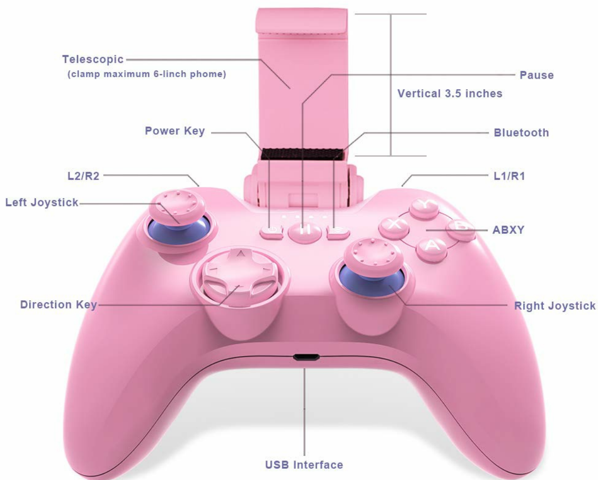
Figure 2.2: This diagram labels the various parts of the PXN Speedy (6603) controller, including the telescopic phone clamp (maximum 6-inch phone), Power Key, Pause button, Bluetooth indicator, L1/R1 and L2/R2 shoulder buttons, Left Joystick, Right Joystick, Direction Key (D-pad), ABXY face buttons, and the USB Interface.