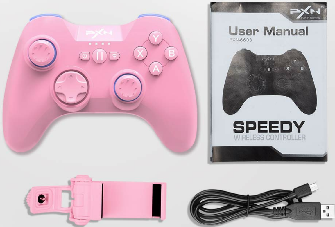
Figure 2.1: The image displays the PXN Speedy (6603) MFi Game Controller, a detachable phone clip, a USB charging cable, and the user manual, representing the complete packing list.