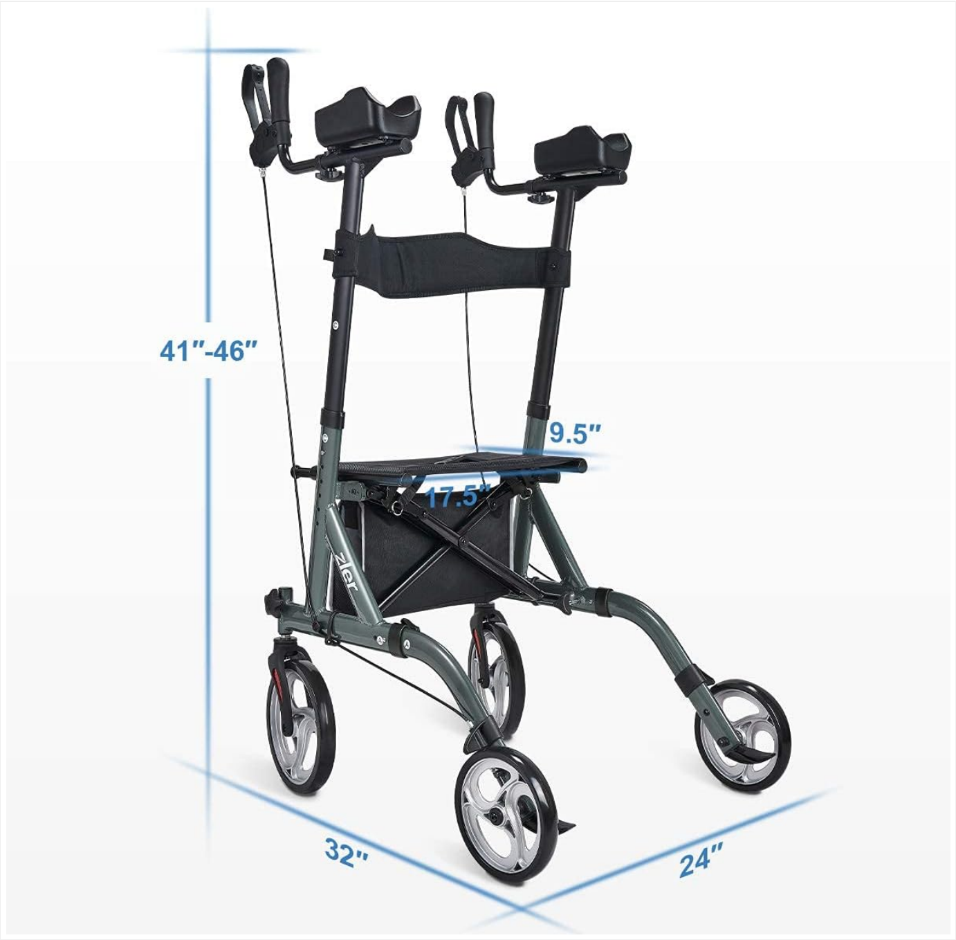
Image: Detailed diagram showing the dimensions of the Zler Upright Rollator Walker.