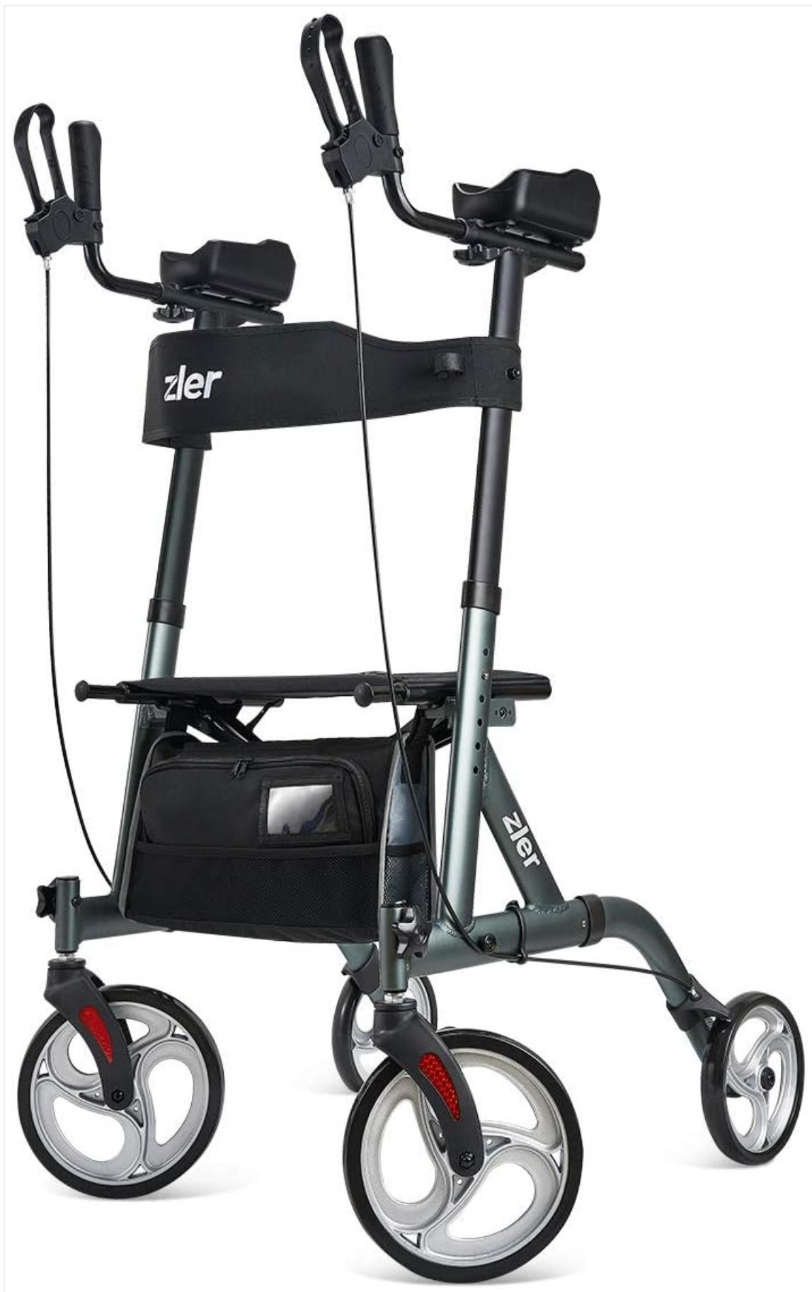
Image: The Zler Upright Rollator Walker, showcasing its design with padded armrests, seat, and storage bag.