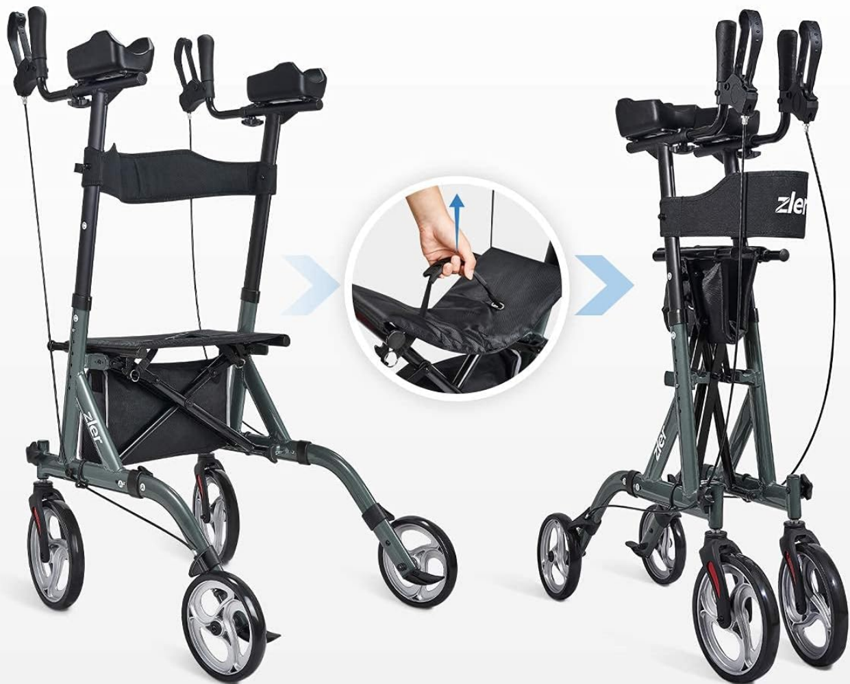
Image: Illustration of the one-hand folding mechanism, showing the walker transitioning from upright to folded position.