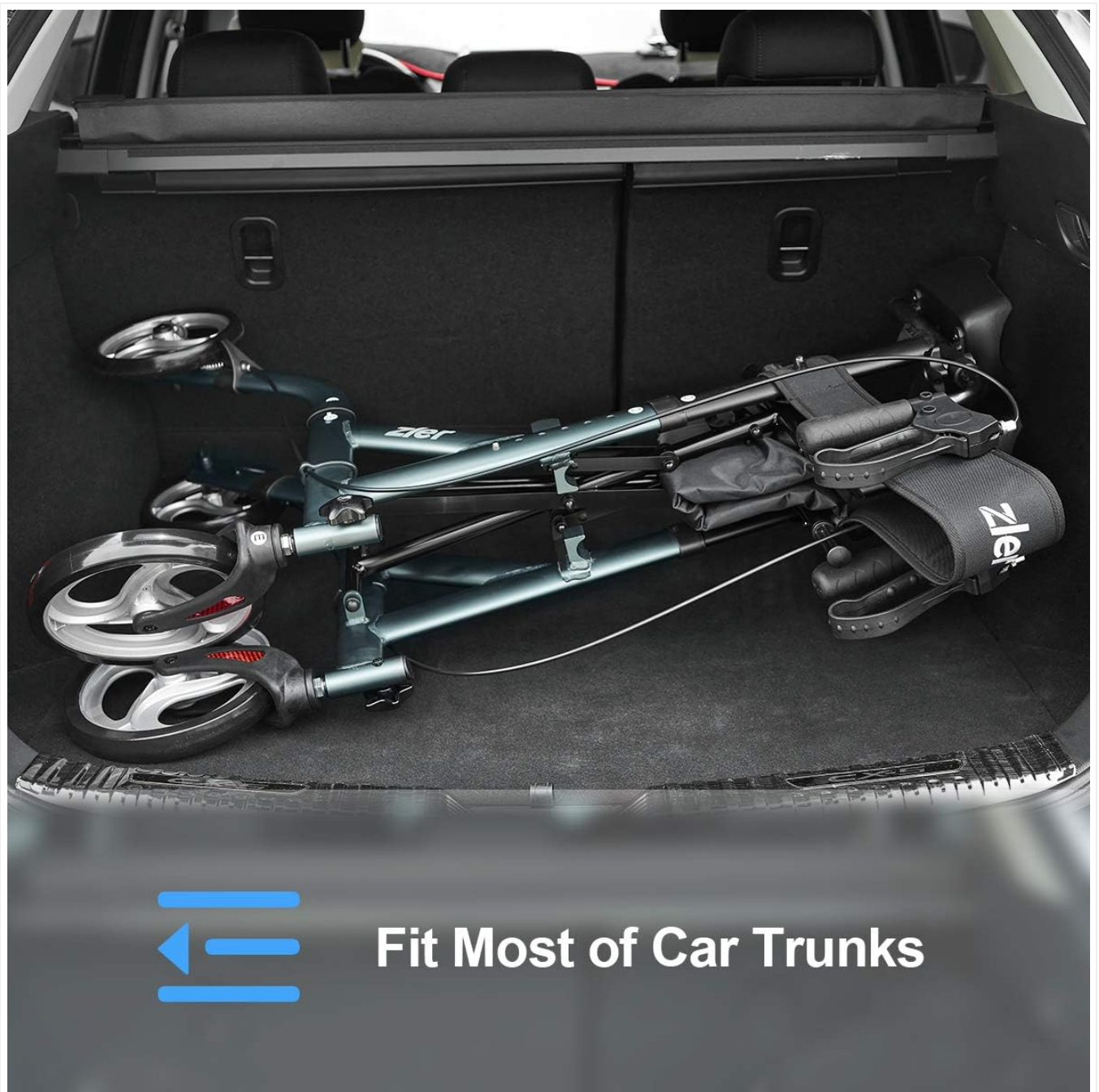
Image: The Zler Upright Rollator Walker folded and stored in the trunk of a car, demonstrating its compact design.

5. Attach Accessories: If applicable, attach the backrest and storage bag to the designated areas.