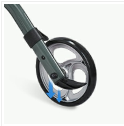
Image: Close-up view of the brake mechanism, showing how to engage the parking brake by pushing the lever down.