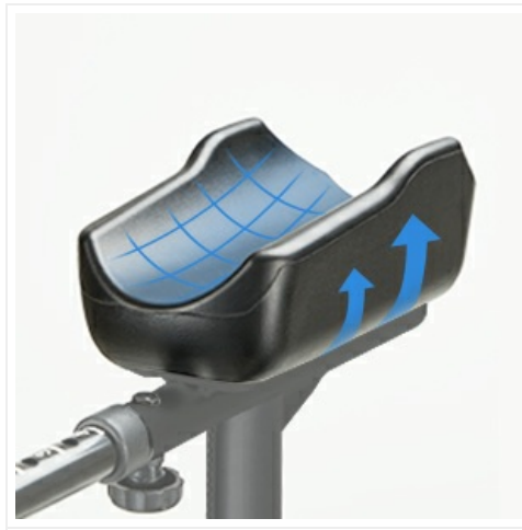
Image: Close-up view of the padded armrests, designed for comfort and support.