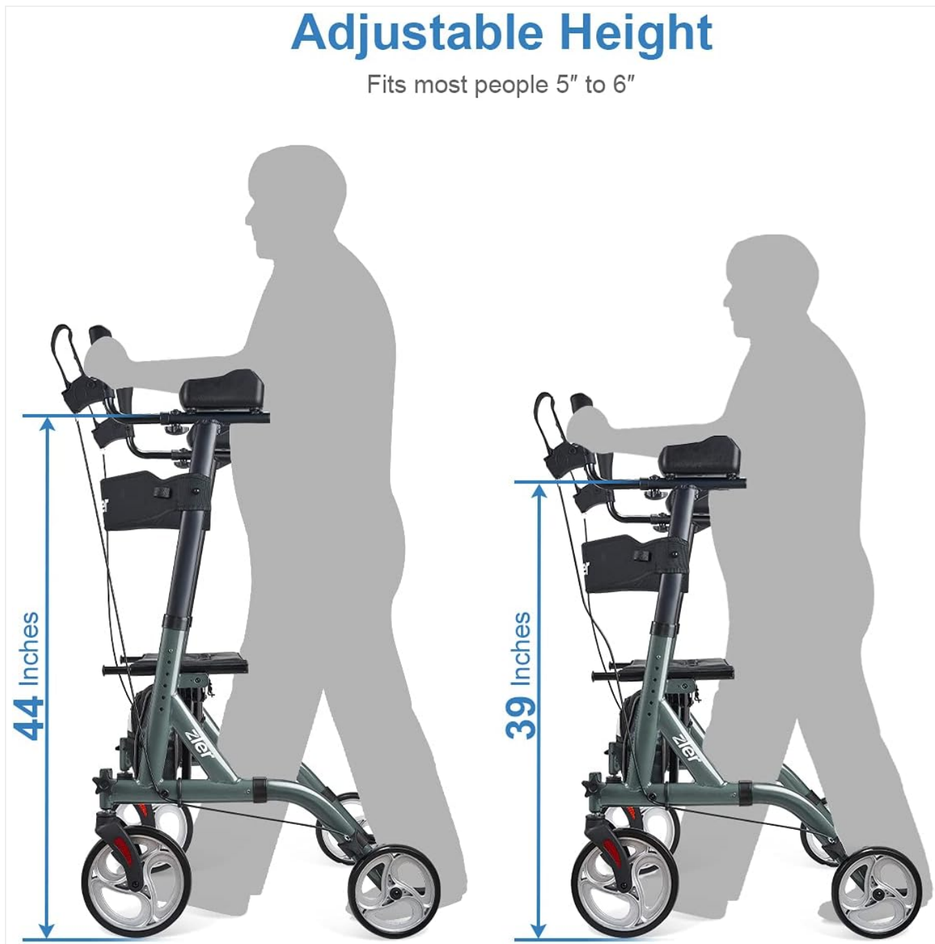
Image: Diagram illustrating the adjustable height feature, showing two figures of different heights using the walker.