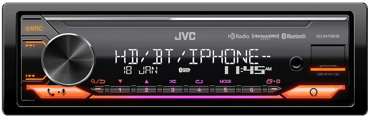
Image: Front panel of the JVC KD-X470BHS showing the display, control knob, and illuminated buttons.