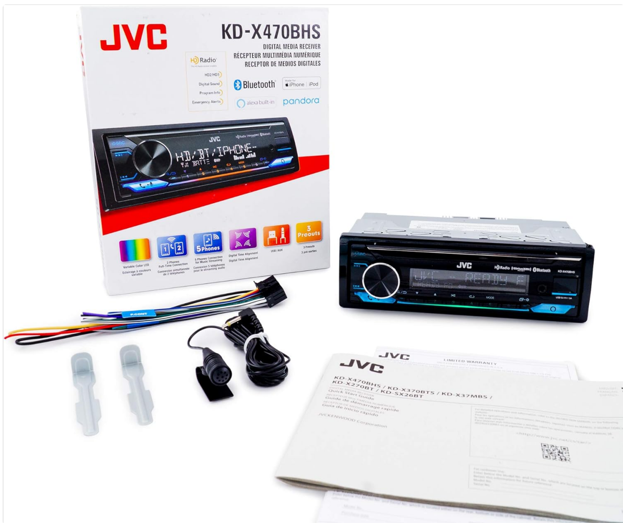
Image: JVC KD-X470BHS package contents, showing the main unit, wiring, microphone, and manuals.