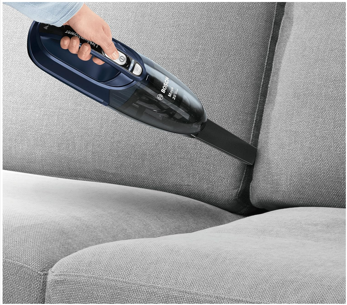
Image: The Bosch handheld vacuum being used to clean a crevice in a sofa, illustrating its versatility for different surfaces and tight spaces.