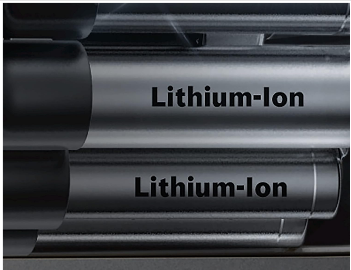
Image: Close-up view of the Lithium-Ion battery cells, highlighting the power source for the cordless operation.