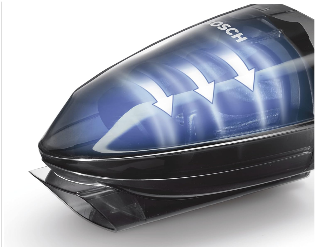
Image: Illustration of the Cyclonic Airflow System within the vacuum's dust container, showing air movement for efficient dust separation.