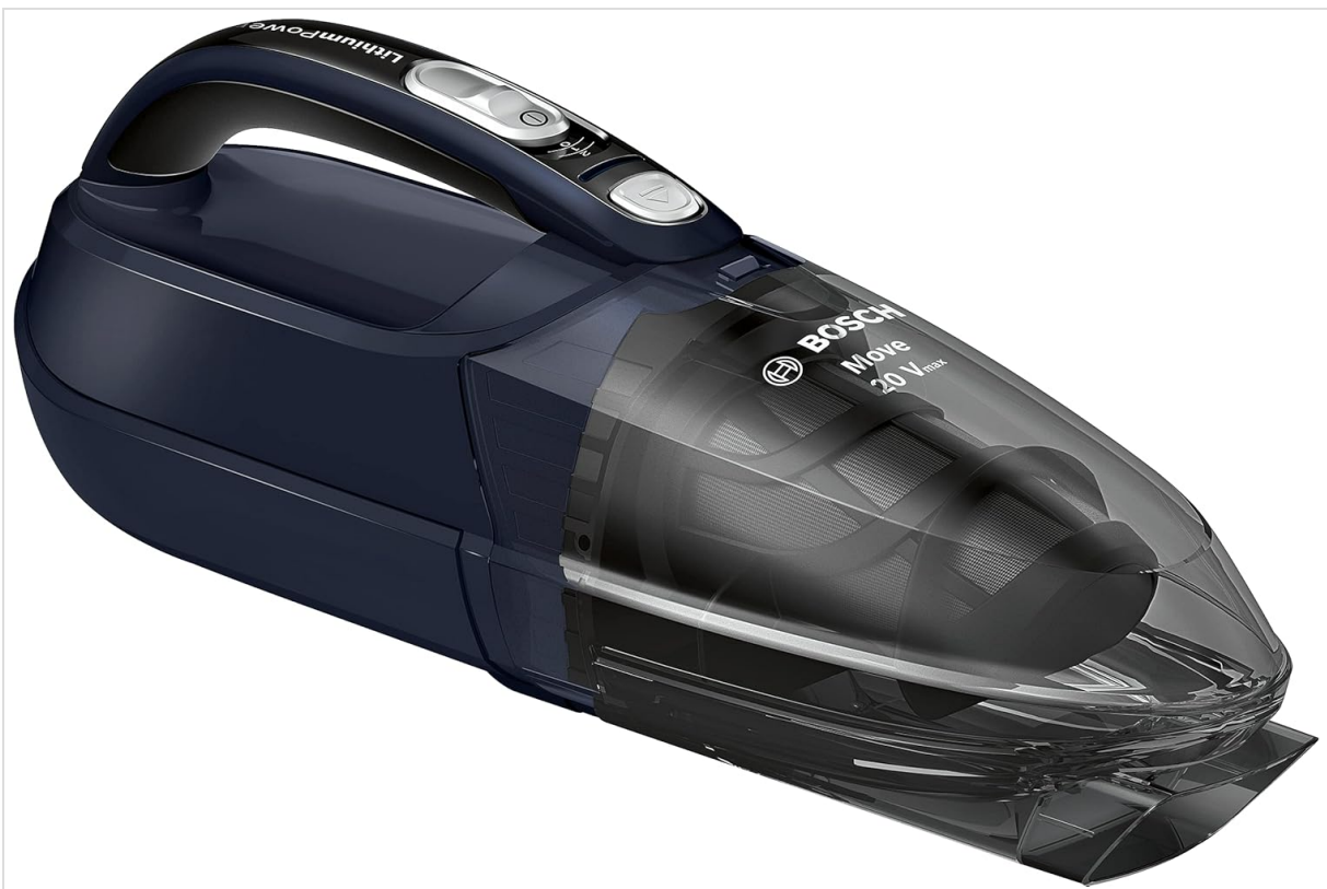
Image: The Bosch Move Max BHN20L Cordless Handheld Vacuum Cleaner, showcasing its compact and ergonomic design.

This user manual provides important information for the safe and efficient operation, maintenance, and troubleshooting of your Bosch Move Max BHN20L Cordless Handheld Vacuum Cleaner. Please read this manual thoroughly before using the appliance and keep it for future reference.