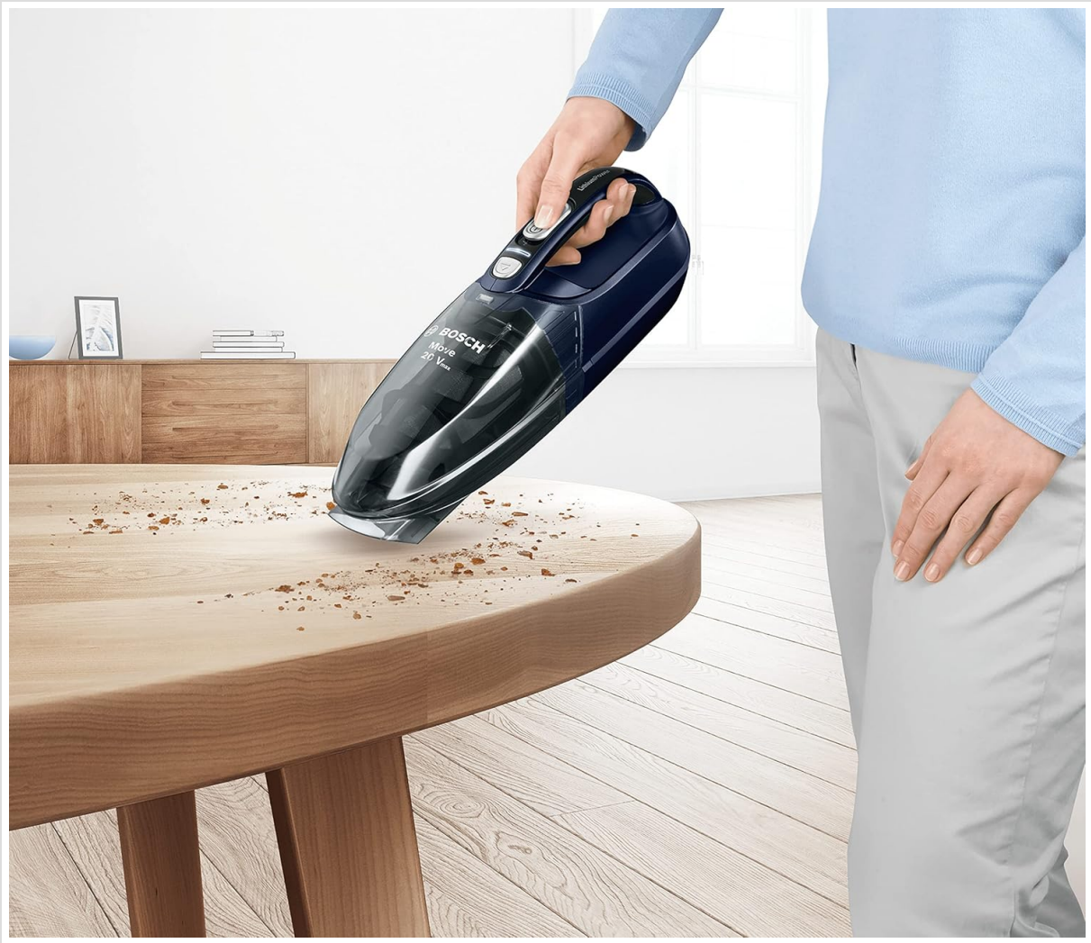
Image: A person using the Bosch handheld vacuum to clean crumbs from a wooden table, demonstrating its ease of use for quick clean-ups.