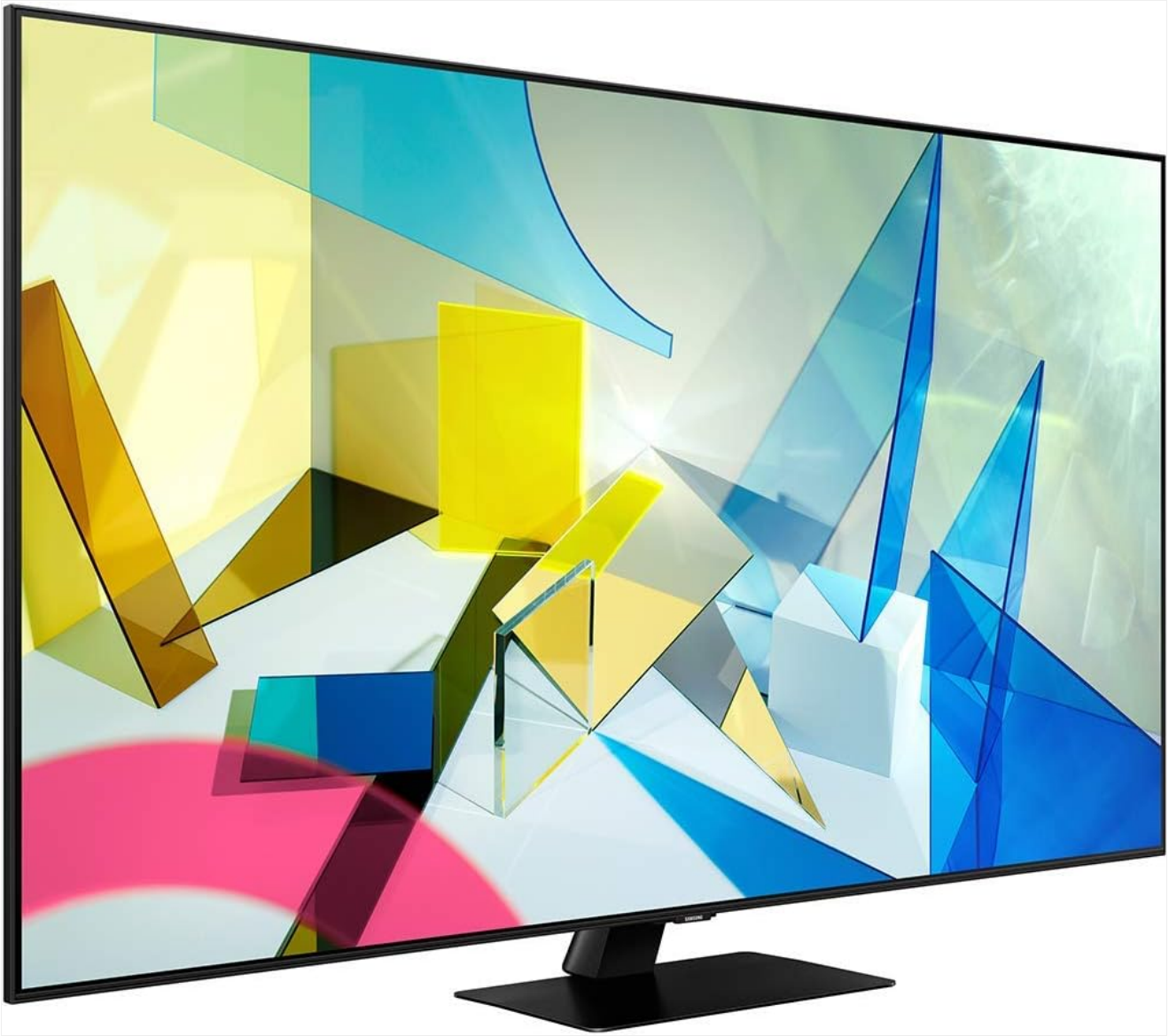
Figure 1: Front view of the Samsung Q80T Series QLED TV. This image displays the television screen with a colorful abstract image, showcasing its vibrant display capabilities. The TV is mounted on its central stand.