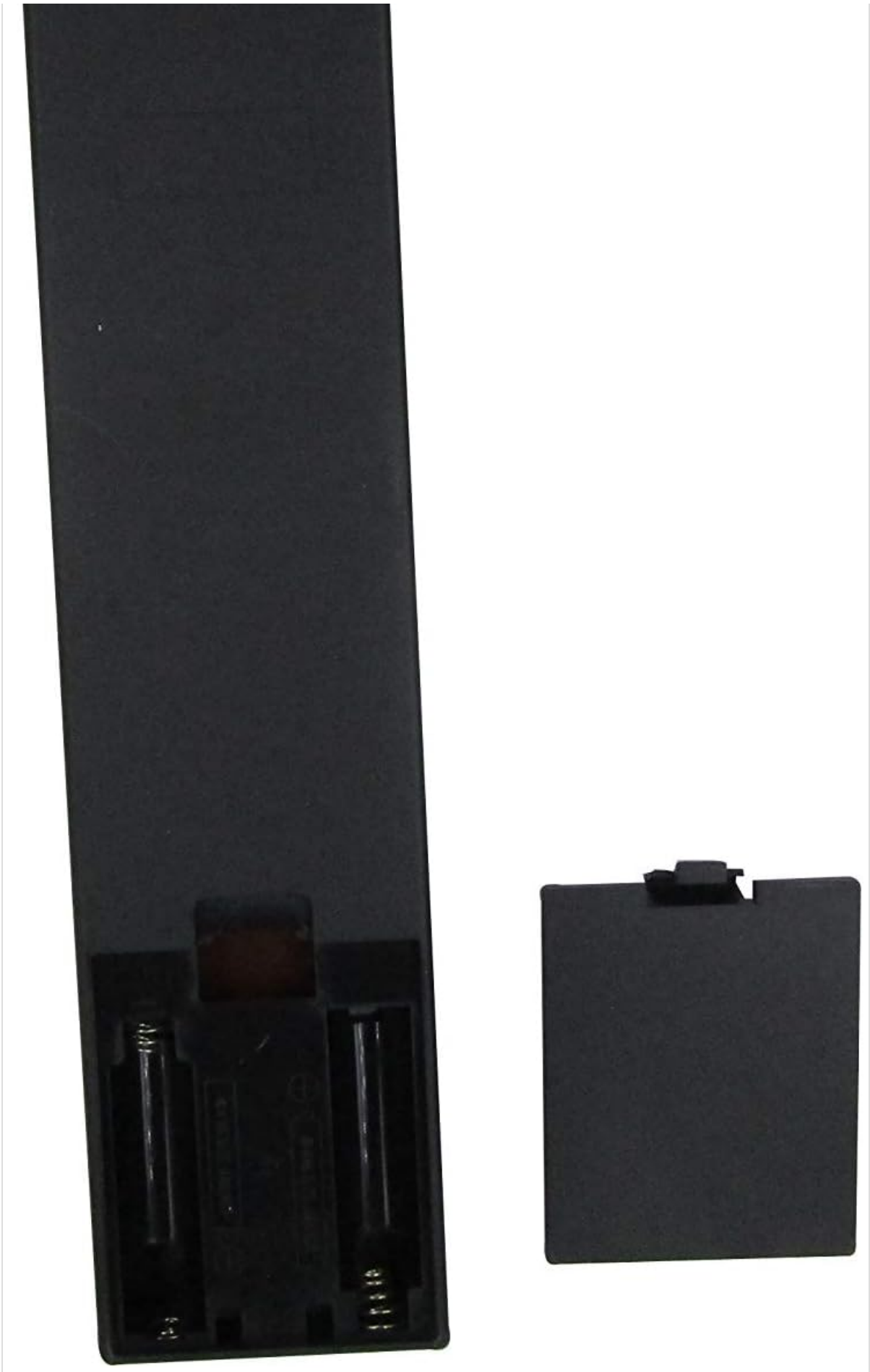
Image: Back view of the remote control with the battery cover removed, revealing the battery slots.