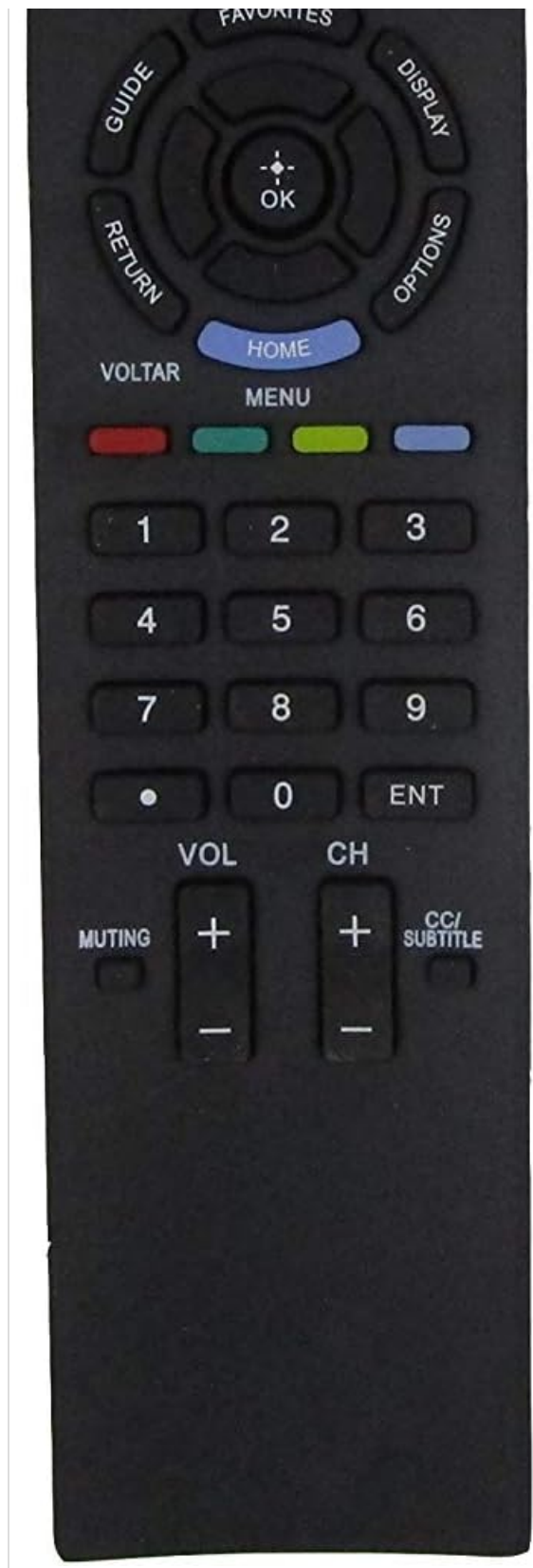
Image: Front view of the remote control, showing the layout of all buttons.