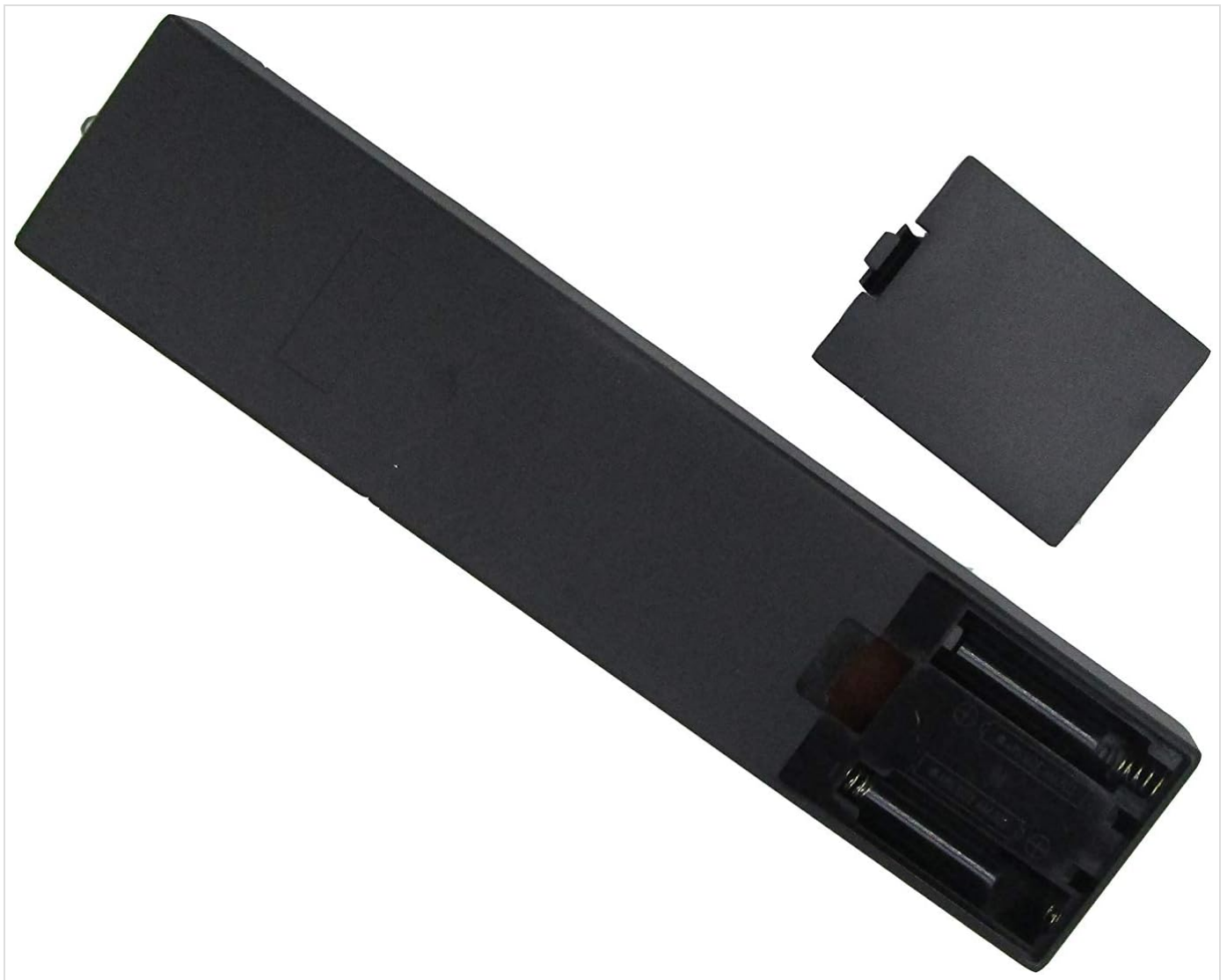
Image: Angled view of the remote control, illustrating the open battery compartment and the detached cover.

Important: Always use new batteries and dispose of old batteries responsibly. If the remote will not be used for an extended period, remove the batteries to prevent leakage.