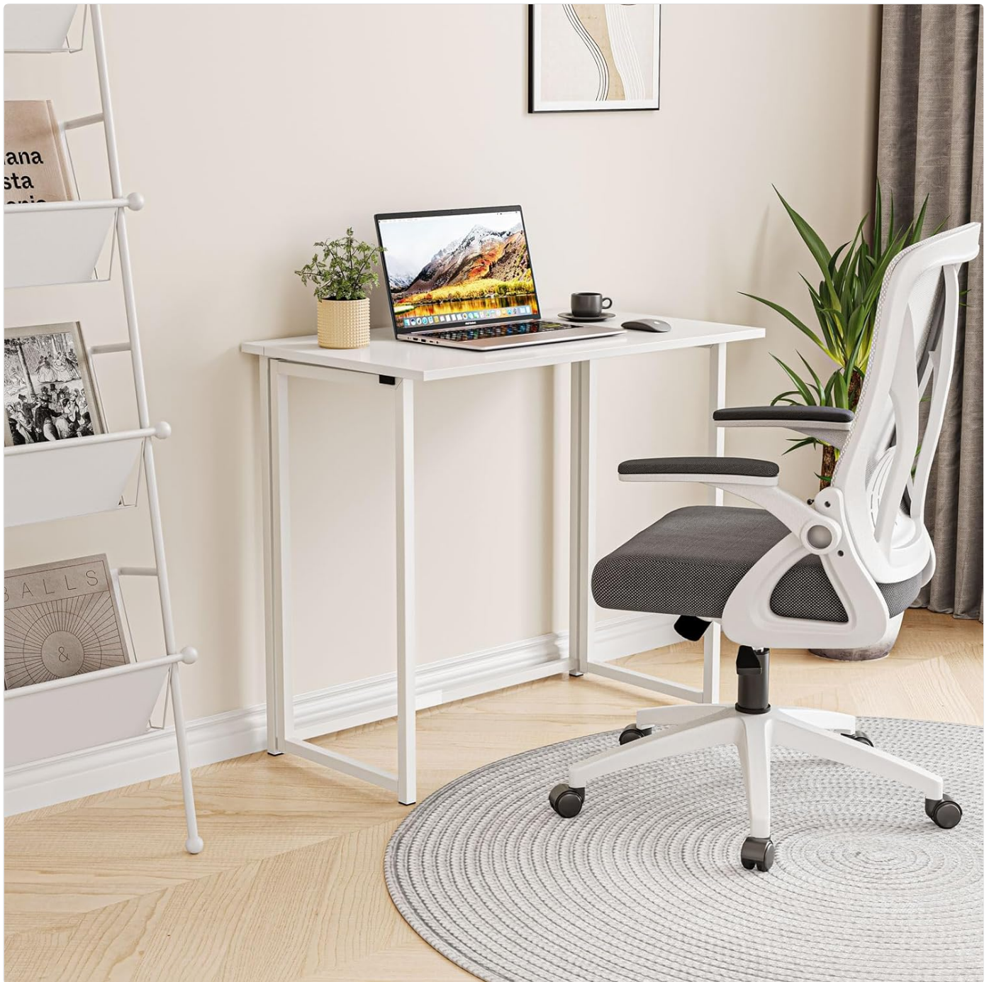
Image: The Dripex Folding Desk set up in a home office, demonstrating its use with a laptop, mouse, and a desk chair, showcasing its functional size.