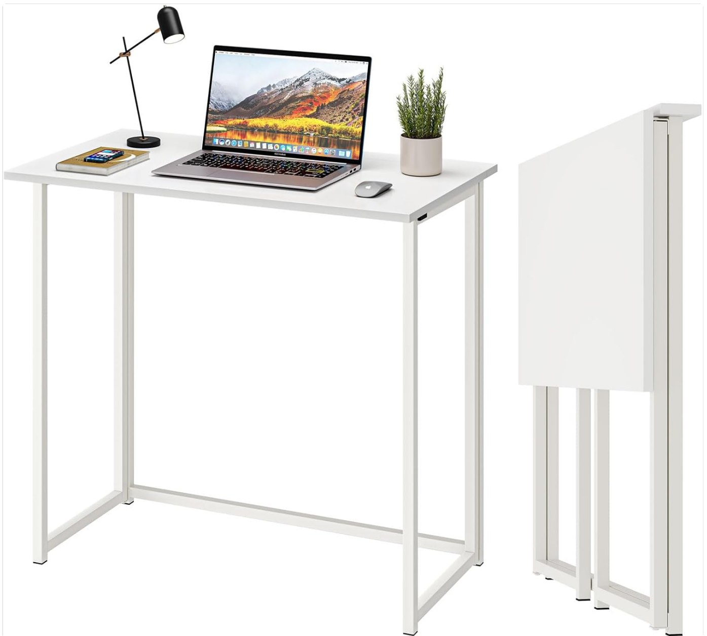
Image: The Dripex Folding Desk shown in its fully unfolded state on the left, and its compact, folded state on the right, highlighting its space-saving design.