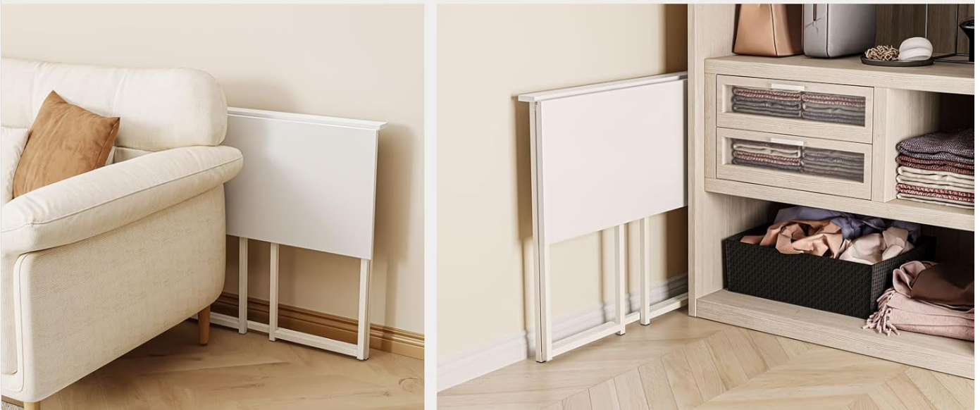
Image: A collage demonstrating various space-saving storage options for the folded desk, including under a bed, behind a door, and upright against a wall or inside a closet, highlighting its compact profile.