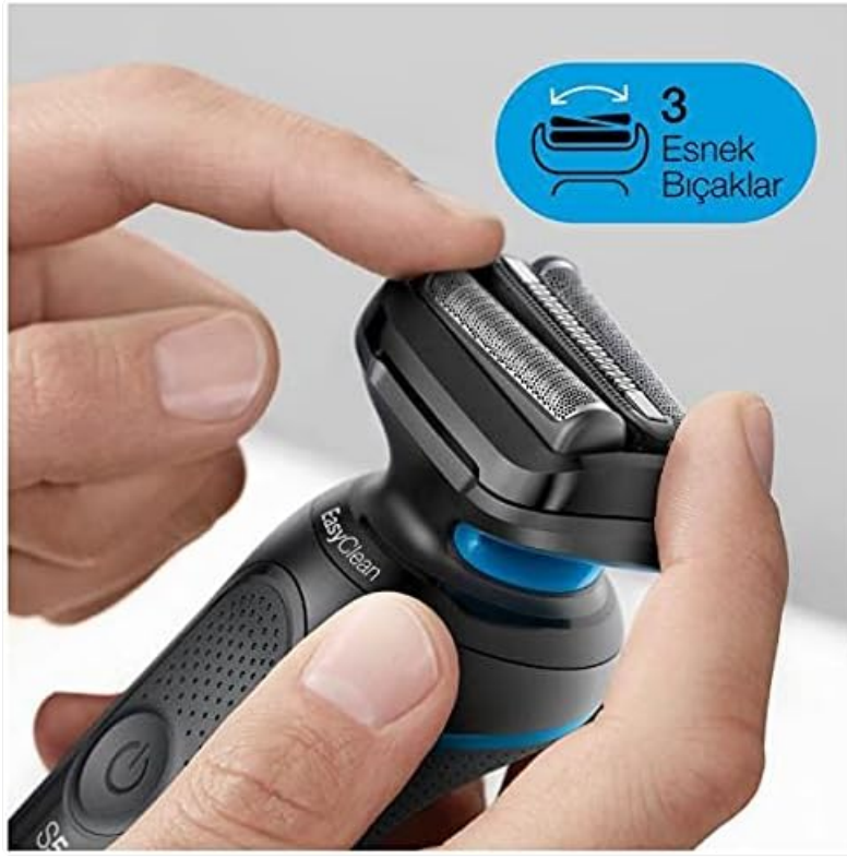
Image: Close-up of the Braun Series 5 shaver head, highlighting its 3 flexible blades that adapt to facial contours.