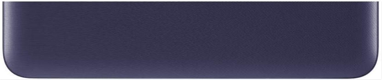
Figure 3.5: Back view of the Alcatel 8084 1T 10 Tablet.

The rear of the tablet is shown in this image, featuring a bluish-black finish. The Alcatel logo is prominently displayed vertically in the center. The rear camera lens is visible in the upper left corner, indicating its position for photography and video recording.