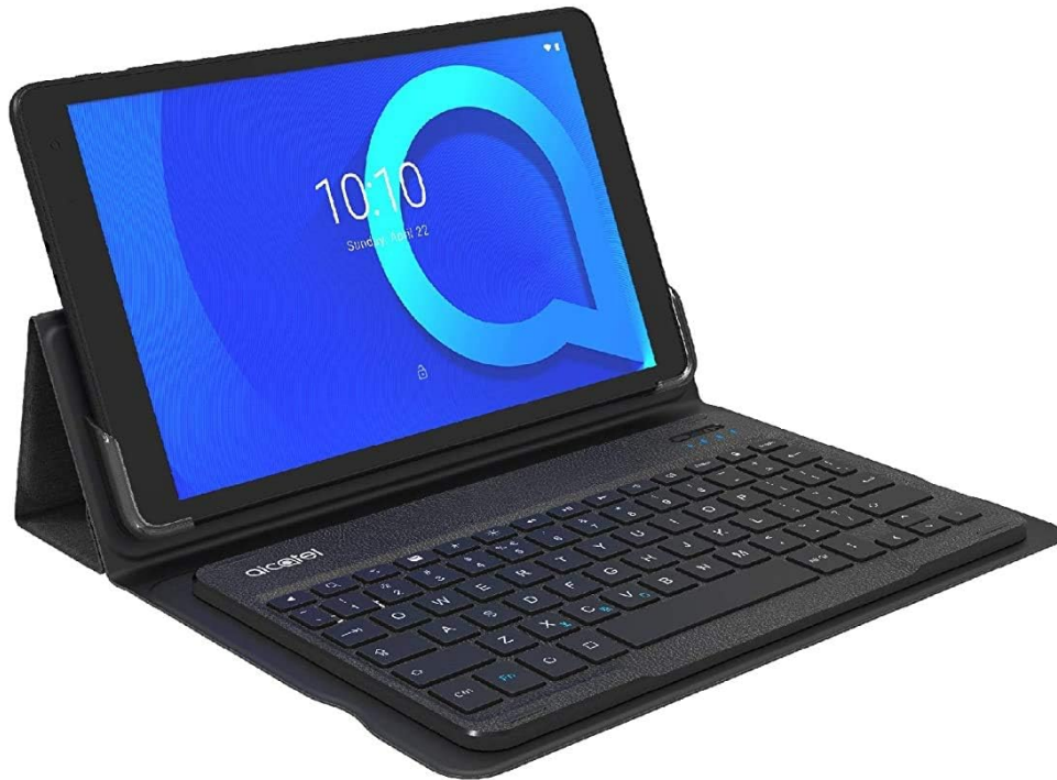
Figure 3.1: Alcatel 8084 1T 10 Tablet with Keyboard in a working position.

This image displays the tablet securely docked into its keyboard case, presenting a laptop-like setup. The tablet screen is active, showing the time and date, while the full QWERTY keyboard is visible and ready for use. This configuration is ideal for productivity tasks.