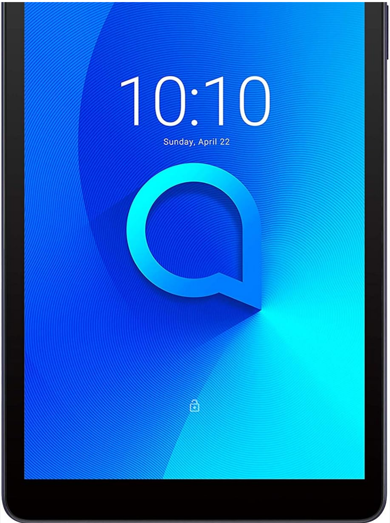
Figure 3.3: Front view of the Alcatel 8084 1T 10 Tablet.

This image focuses solely on the tablet's front, showcasing its 10.1-inch display. The screen is active, displaying the time and a lock icon. The front-facing camera is visible at the top center bezel, indicating its position for video calls and selfies.