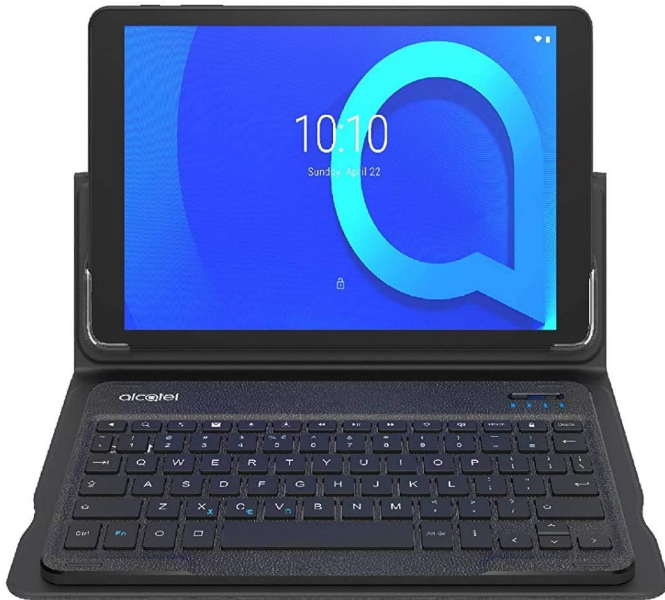
Figure 3.2: Front view of the Tablet with Keyboard.

This image provides a direct front view of the tablet and keyboard assembly. The tablet's display is centered, and the keyboard's layout is clearly visible, including function keys and the Alcatel branding below the screen. This perspective highlights the compact and integrated design.