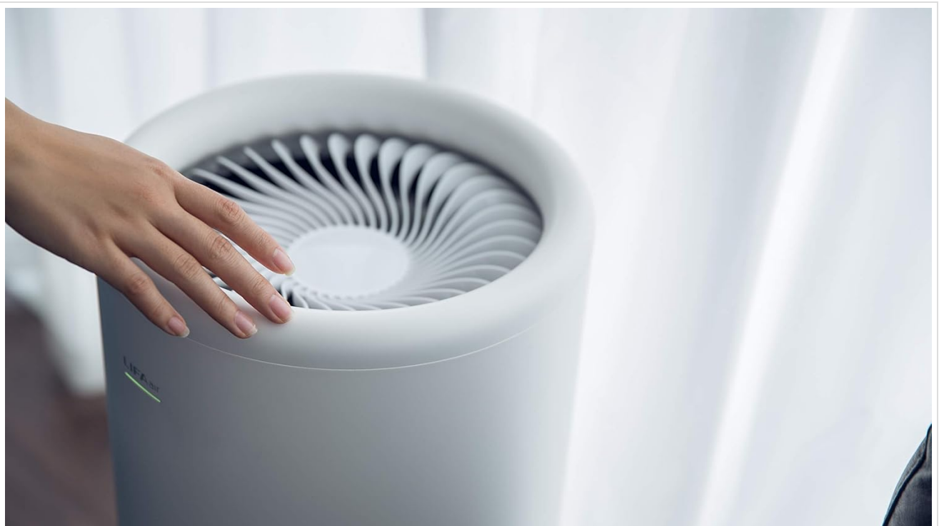
Image: A hand gently touching the top surface of the LIFAair LA502C Air Purifier, indicating the location of the touch-sensitive control panel.