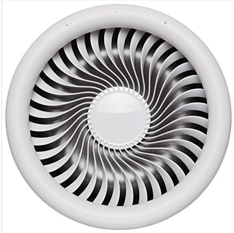
Image: A close-up top view of the LIFAair LA502C Air Purifier, showing the intricate design of its fan blades and the central control area.

Refer to the specific icons or indicators on the control panel for mode selection.