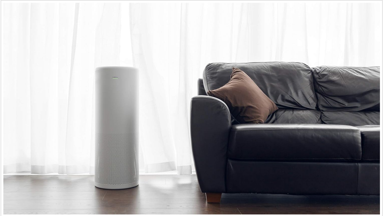
Image: The LIFAair LA502C Air Purifier positioned discreetly next to a dark leather sofa, demonstrating suitable placement within a living space.