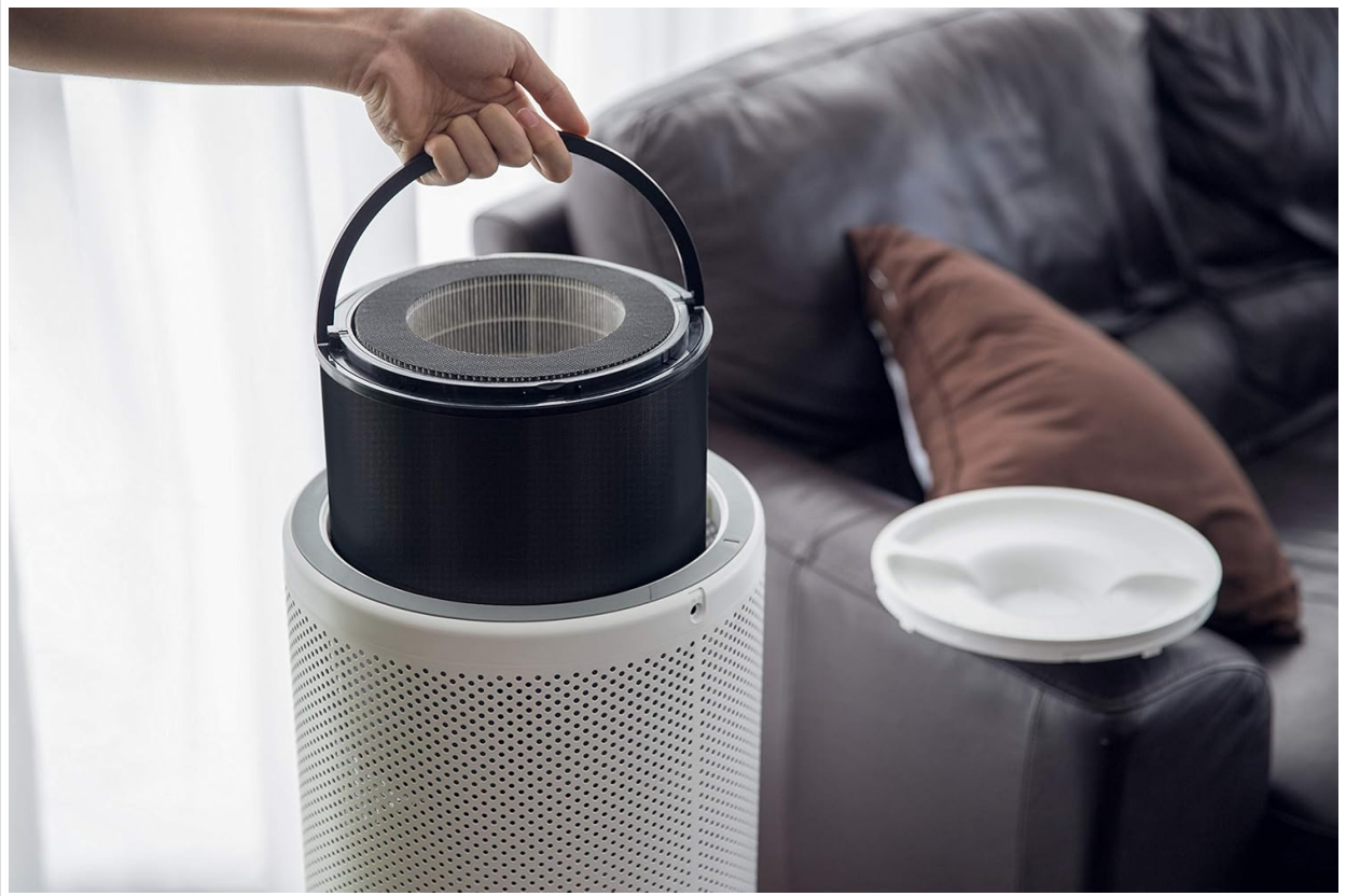
Image: A hand demonstrating the insertion of a new filter into the LIFAair LA502C Air Purifier, showing the correct way to place the filter unit.