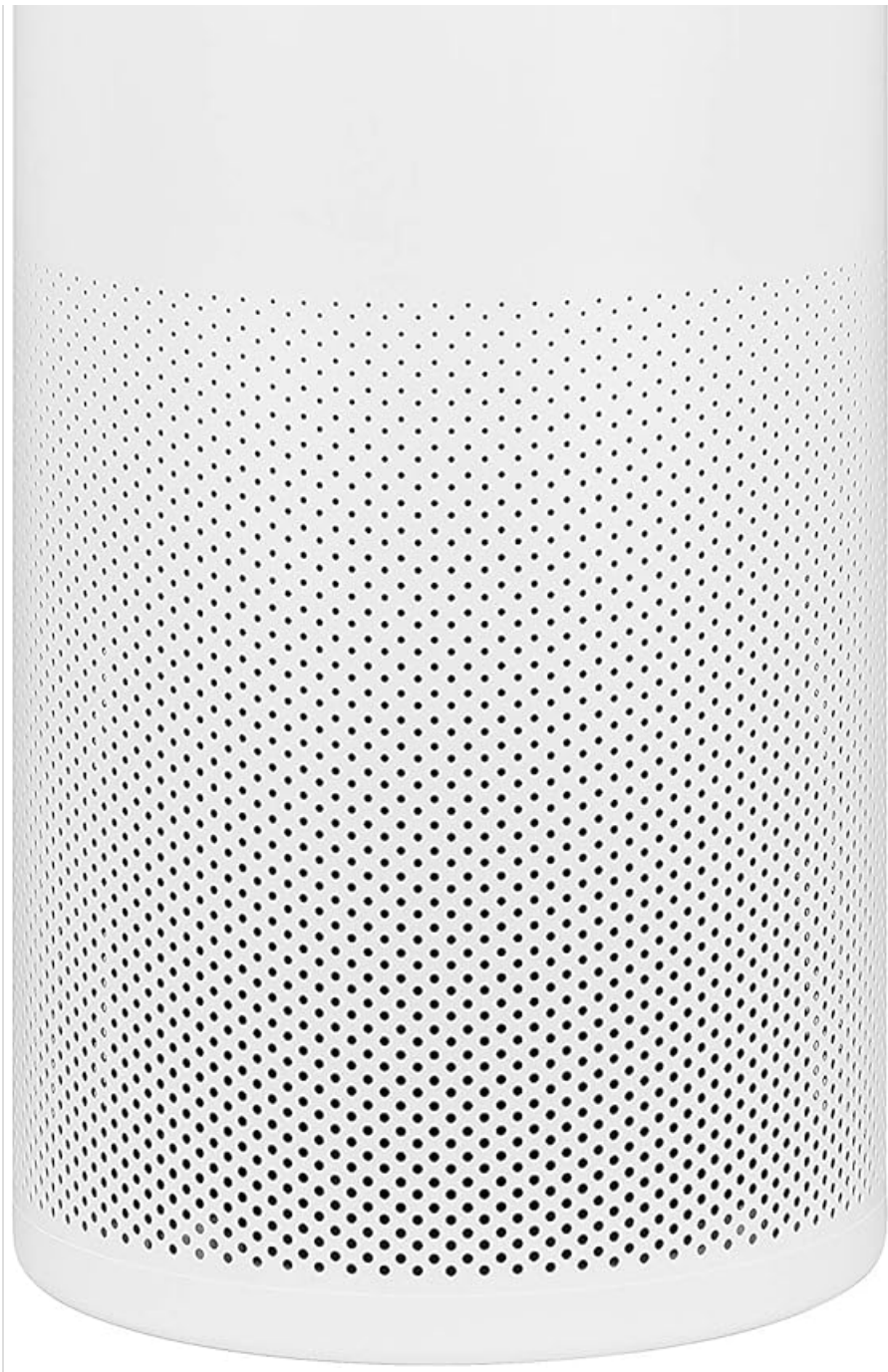
Image: The LIFAair LA502C Air Purifier, a sleek cylindrical device in white, designed to blend seamlessly into modern home environments.