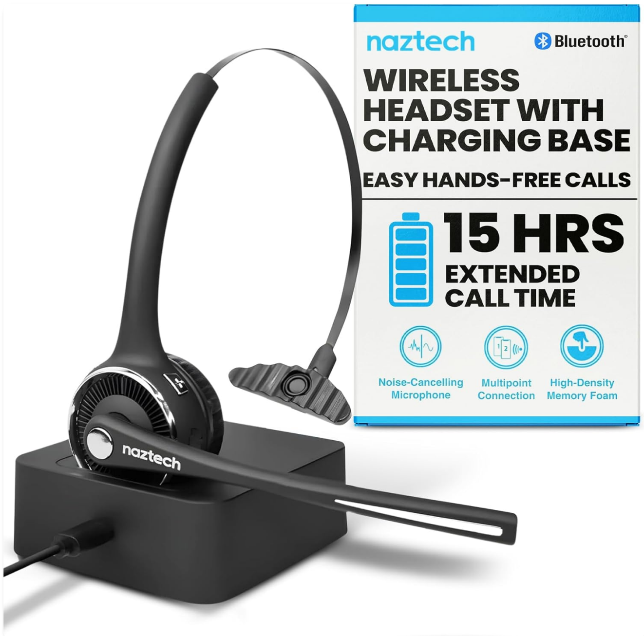
Image: Naztech N980 Wireless Headset with Charging Base and its retail packaging, highlighting key features.