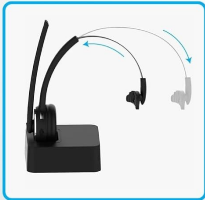
Fully Adjustable Headband