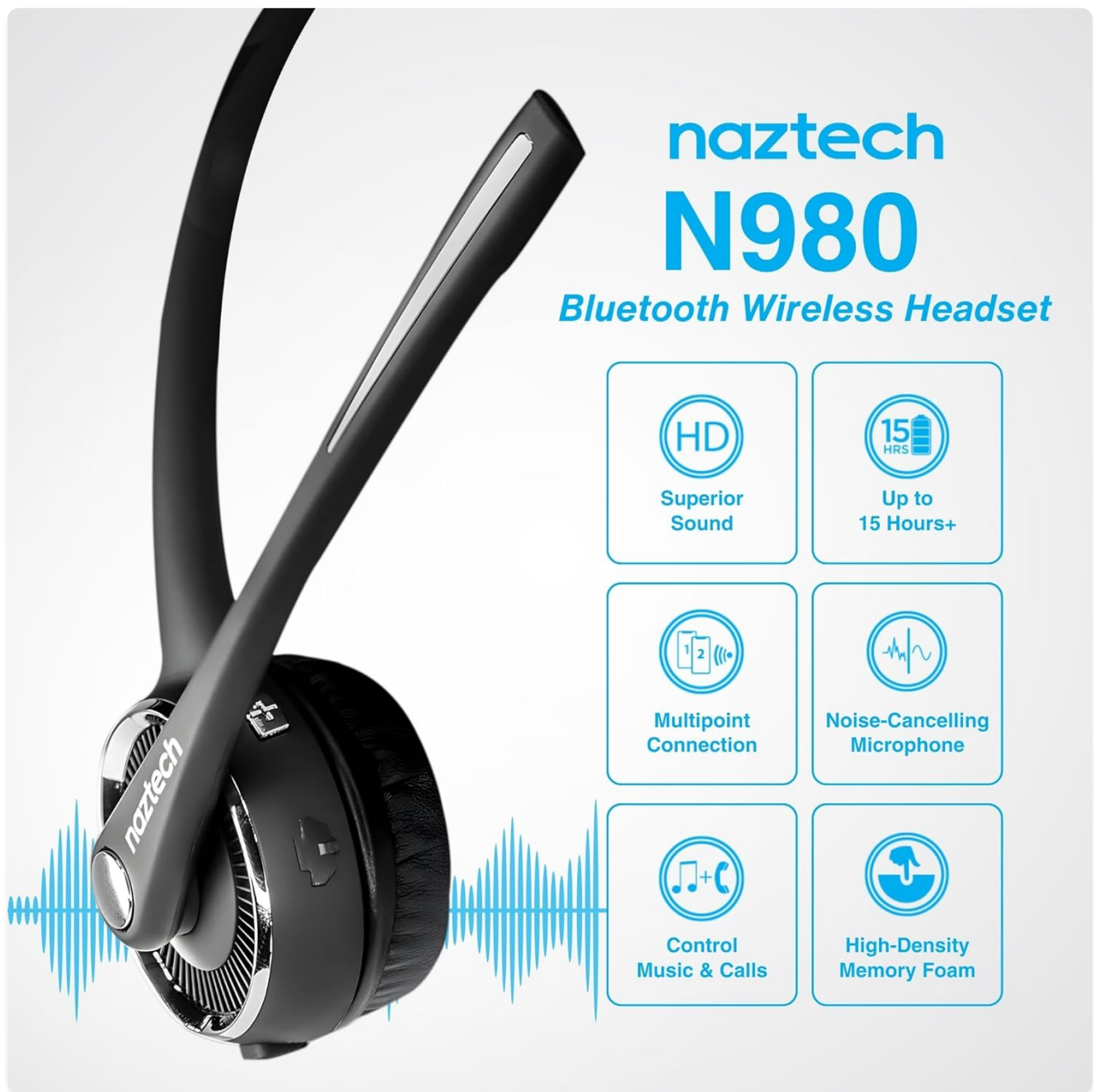
Image: Detailed view of the Naztech N980 headset with callouts for its features: HD Superior Sound, 15+ Hours Battery, Multipoint Connection, Noise-Cancelling Microphone, Music & Call Controls, and High-Density Memory Foam.