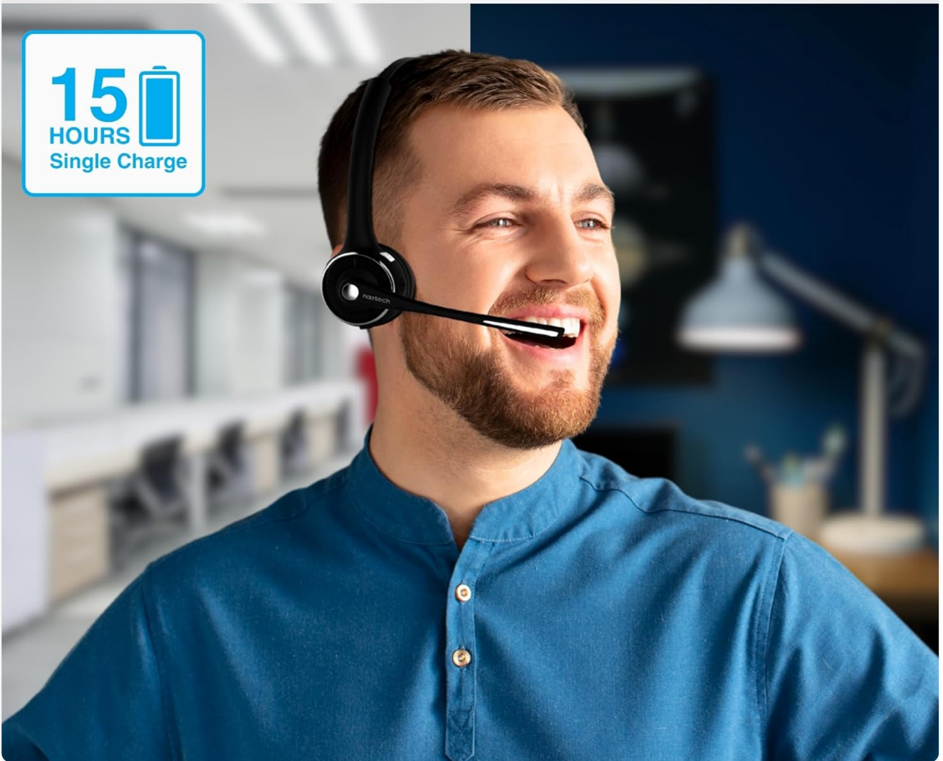
Image: A user enjoying the extended battery life of the Naztech N980 headset, capable of up to 15 hours of talk time.