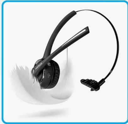
Lightweight Single-Ear Design

The fully adjustable over-the-head design, plush memory foam ear cup, and flexible headband offer a lightweight and comfortable fit for extended wear.