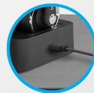
Included Charging Base

Image: Demonstrates the two charging methods for the Naztech N980 headset: via the included charging base or directly using the built-in Micro USB port.