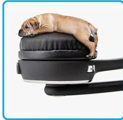
Ultra-Soft Memory Foam Cushion