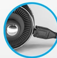
Built-In Micro USB port