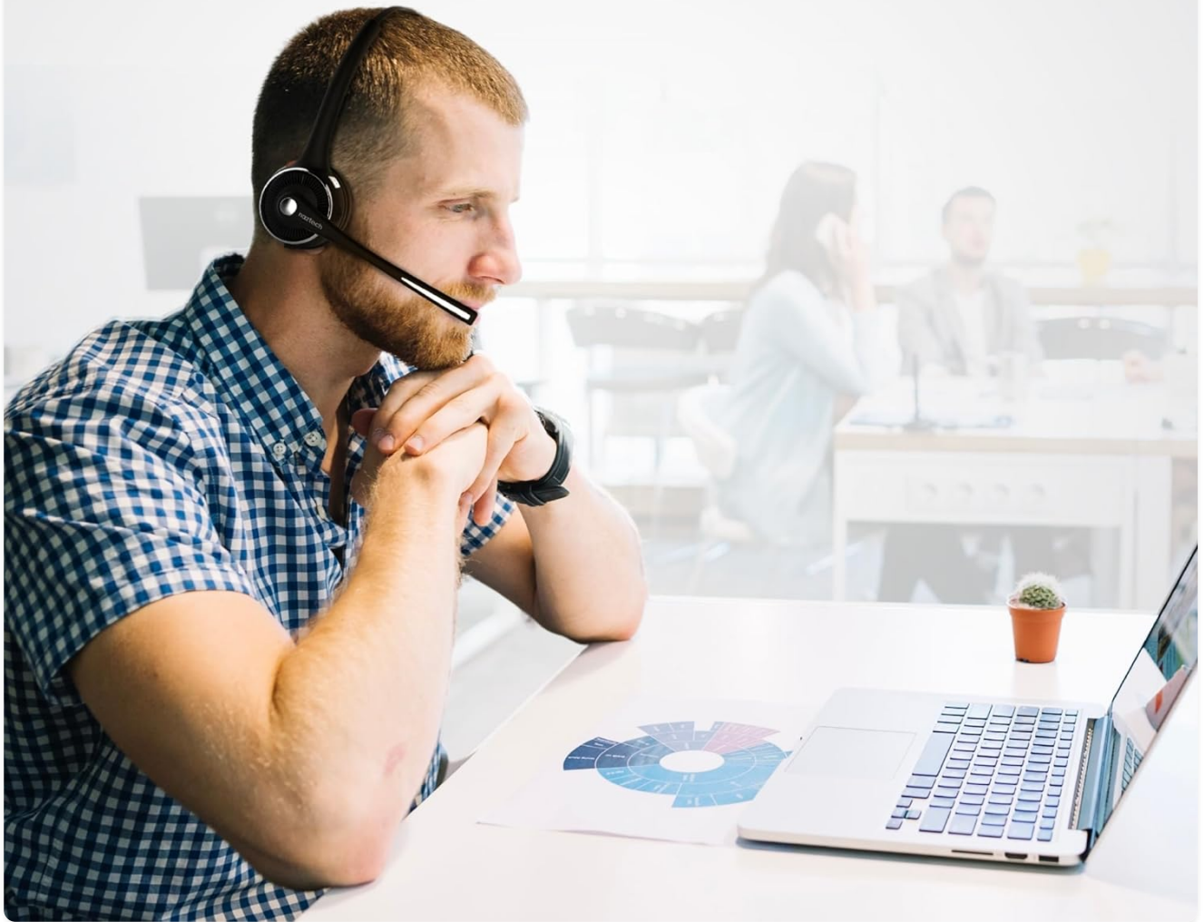
Image: A user demonstrating the hands-free capability of the Naztech N980 headset during a work session.

Our custom-tuned drivers provide superior HD audio, allowing you to hear your surroundings while enjoying dynamic sound from a single ear.