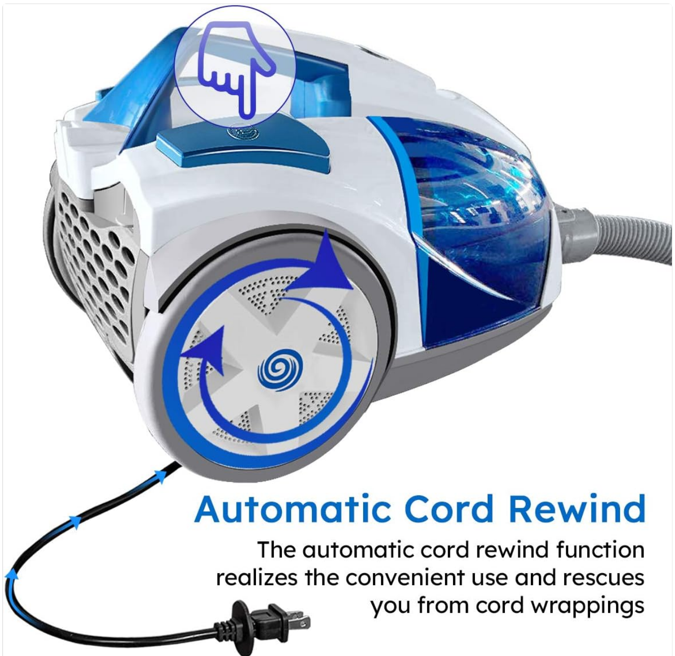
Image: A close-up view of the automatic cord rewind function, showing the power cord being retracted into the vacuum unit.