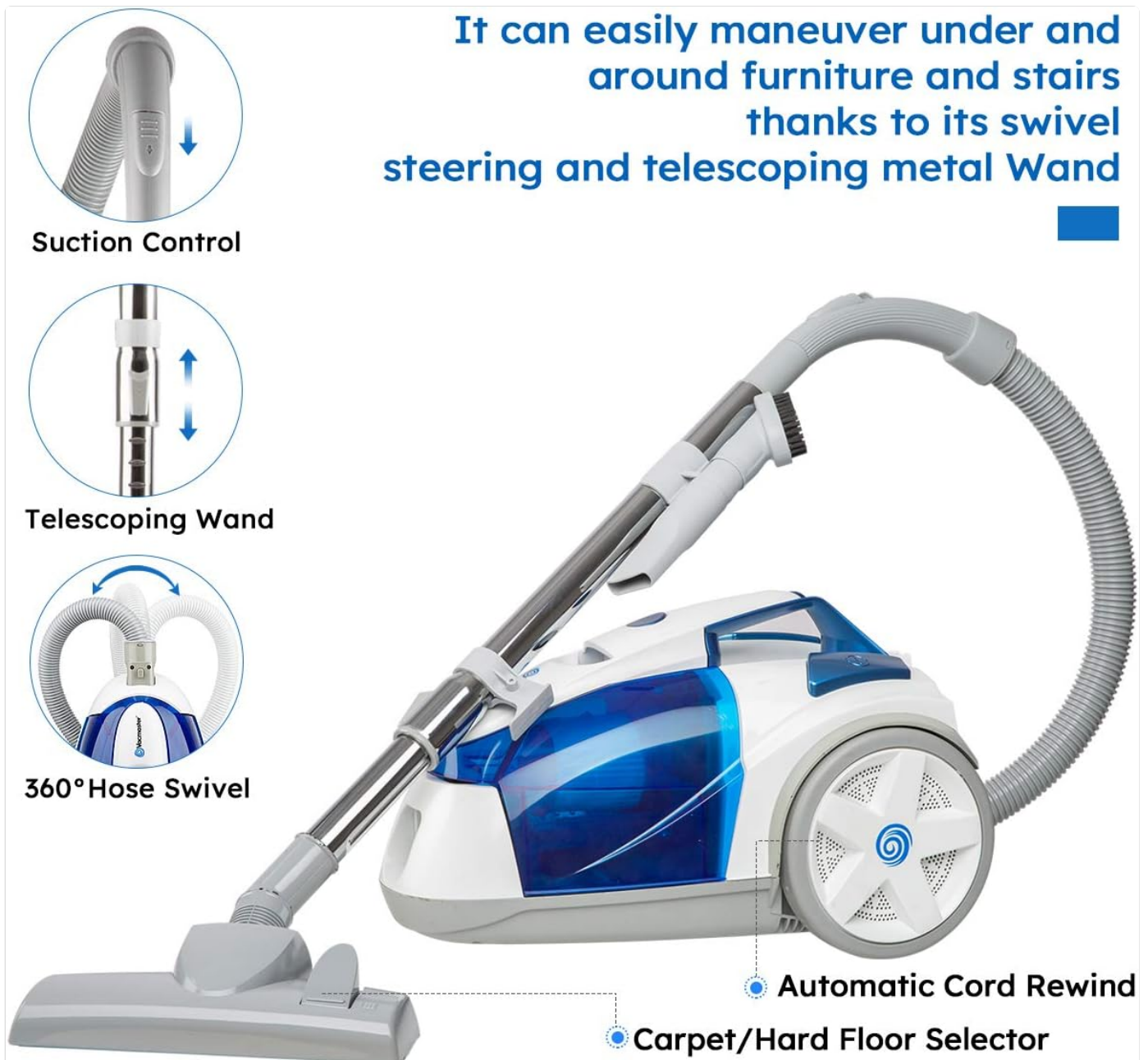
Image: Detailed view of the vacuum's features, including suction control on the hose handle, the adjustable telescoping wand, and the 360-degree hose swivel for easy maneuverability.

It can easily maneuver under and around furniture and stairs thanks to its swivel steering and telescoping metal Wand