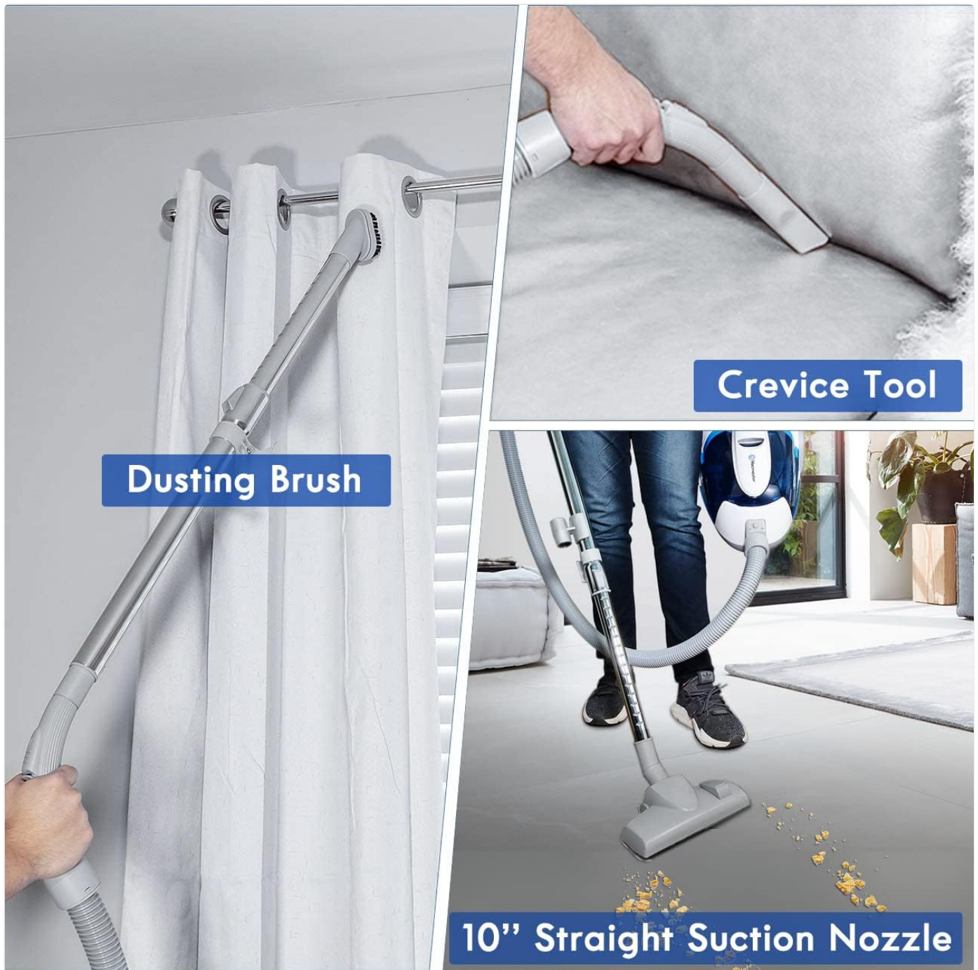
Image: Demonstrates the effective use of the dusting brush for curtains, the crevice tool for tight spaces, and the 10-inch straight suction nozzle for general floor cleaning.