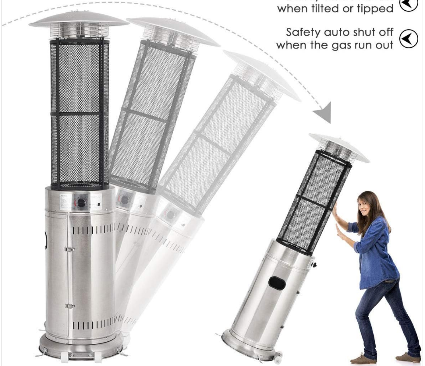
Image Description: A series of images showing the HAPPYGRILL GO-HG0439 Patio Heater tilting, illustrating its safety auto shut-off feature. This feature activates if the heater is tilted or if the gas supply runs out, enhancing user safety.