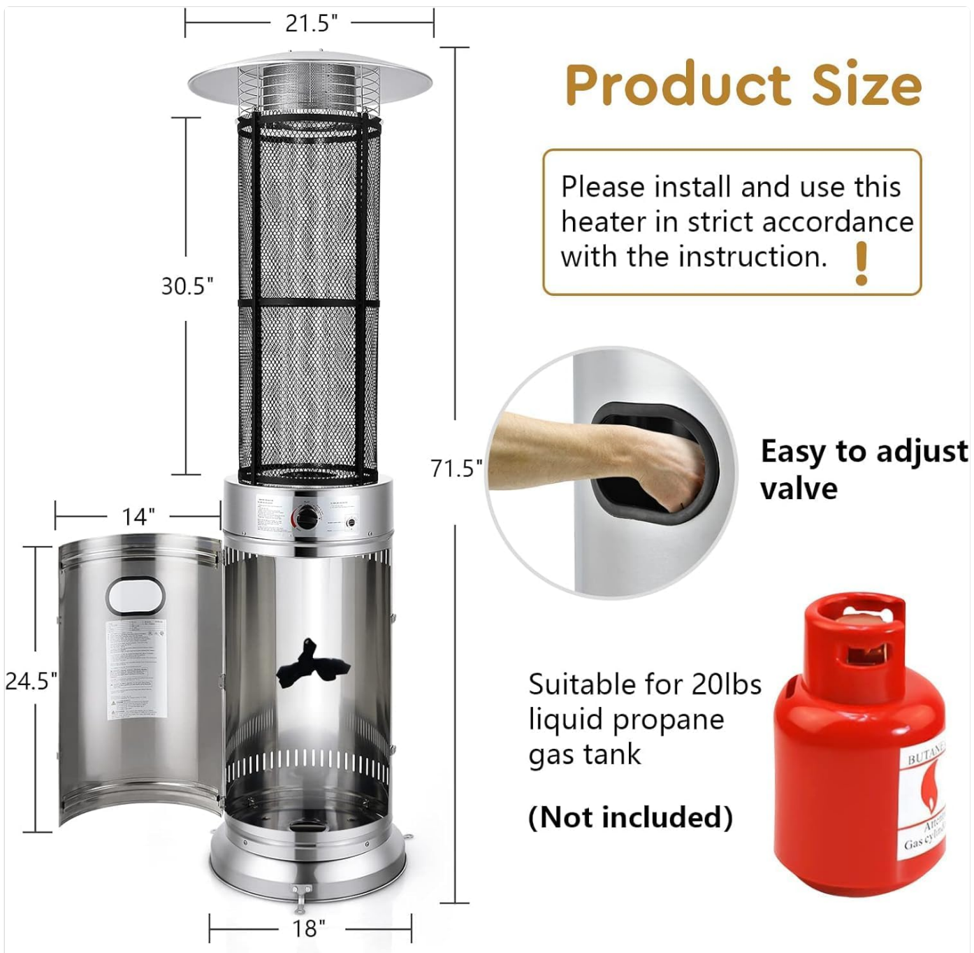
Image Description: An image detailing the product dimensions (21.5" top, 30.5" heating column, 14" base height, 18" base diameter, 71.5" total height) and highlighting the easy-to-adjust valve and suitability for a 20lb liquid propane gas tank.