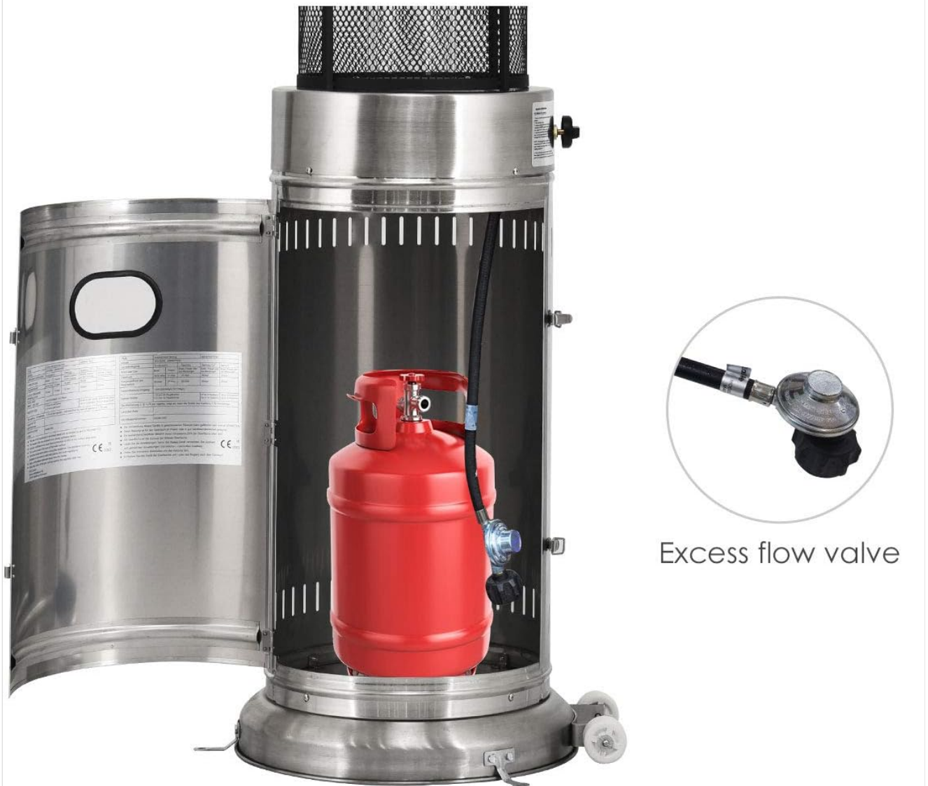
Image Description: A view of the lower section of the patio heater with its door open, showing a red 20lb propane cylinder being placed inside. An inset image highlights the excess flow valve connection to the tank. This demonstrates the correct method for installing the fuel source.