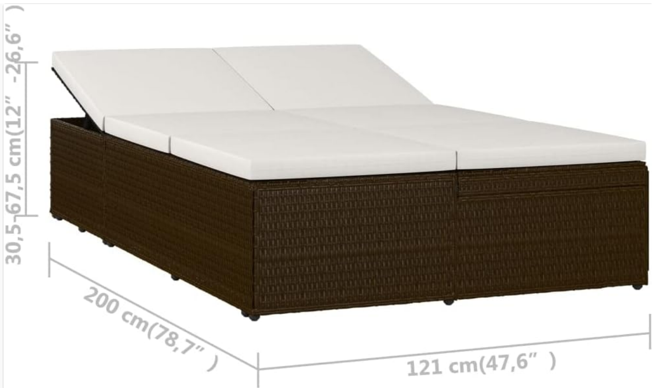
Figure 3.2: Dimensional diagram of the sunbed, indicating length, width, and adjustable height range.