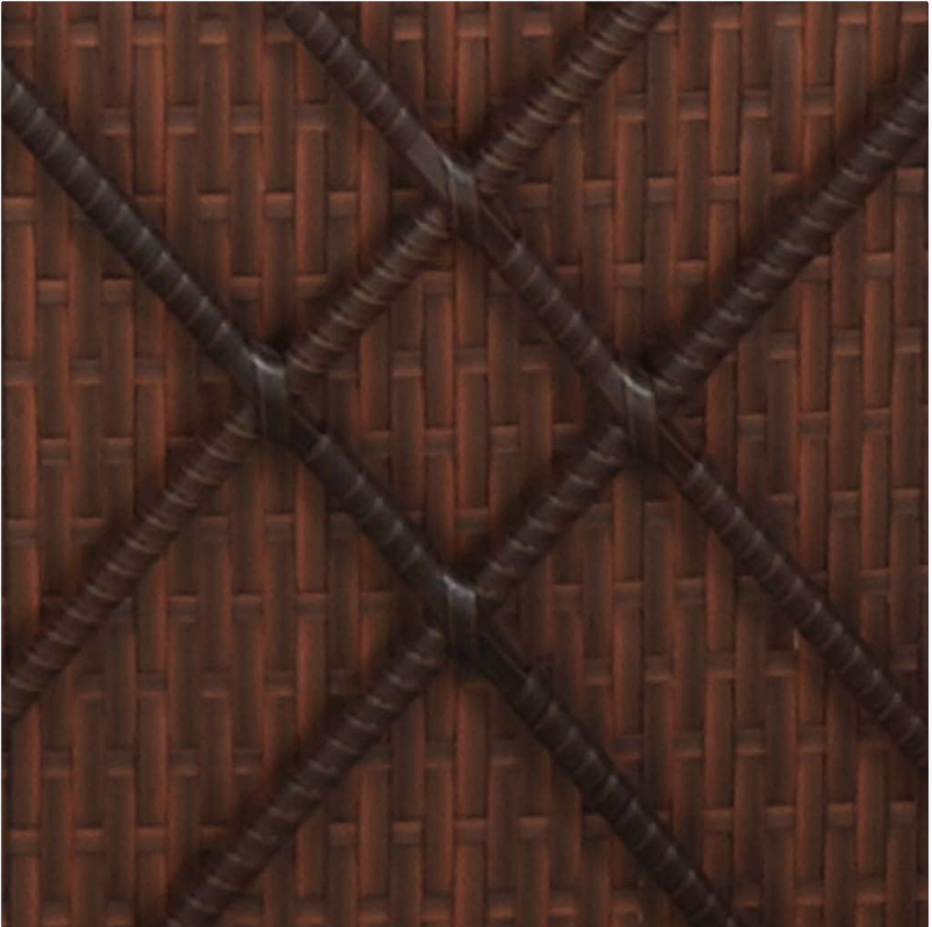
Figure 5.1: Detail of the durable poly rattan material, designed for outdoor resilience.