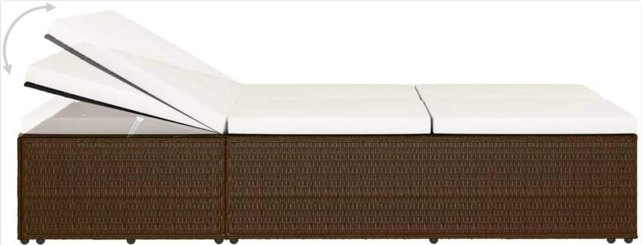
Figure 4.1: Adjusting the backrest to an upright position for sofa use.