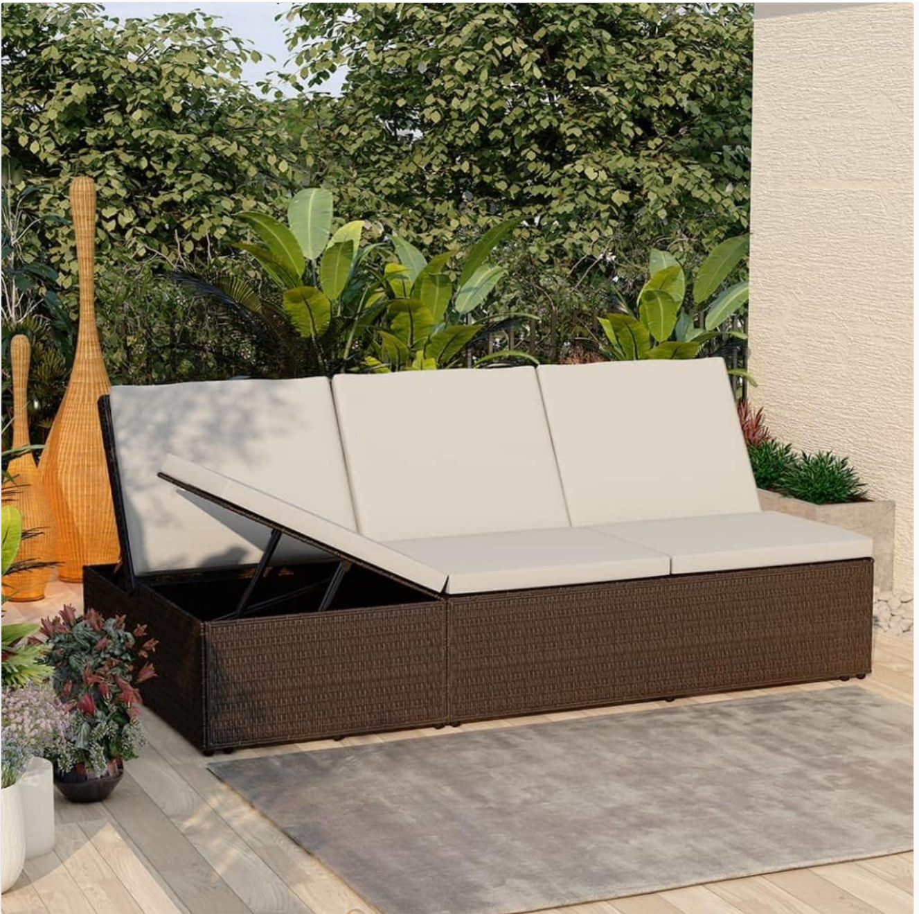
Figure 3.1: The vidaXL Double Chaise Lounge Sunbed in a patio environment, showcasing its convertible design with cushions.