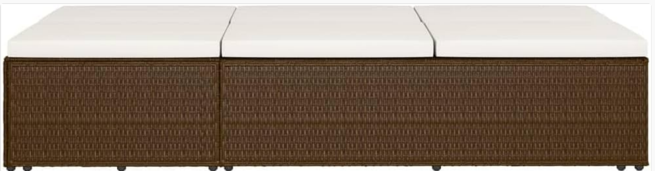
Figure 4.4: The sunbed fully extended to a flat position for lounging.