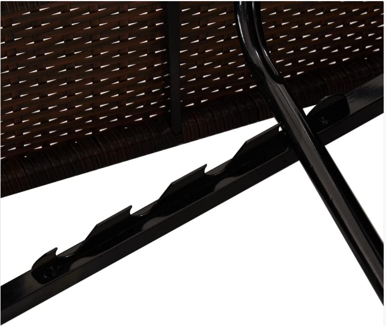
Figure 4.3: Detail of the robust adjustment mechanism, ensuring stable backrest positioning.