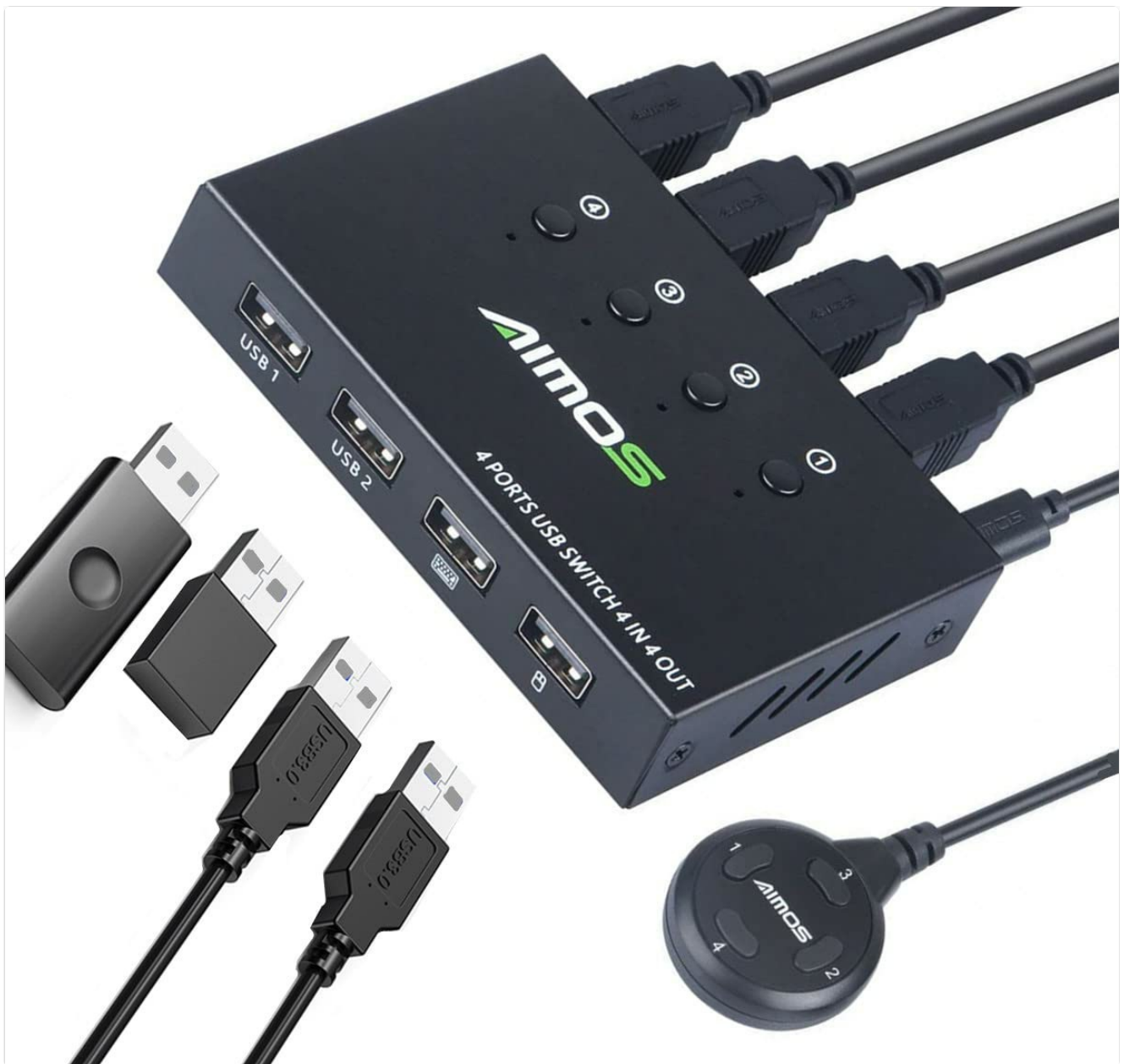
Figure 1.1: AIMOS USB KVM Switcher with included cables and remote switch.