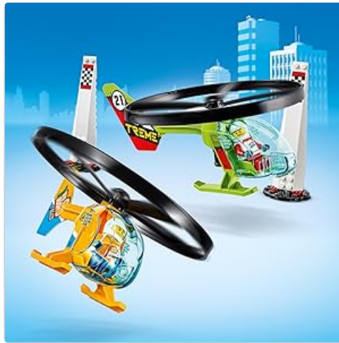
Figure 6: Both ripcord helicopters ready for flight.