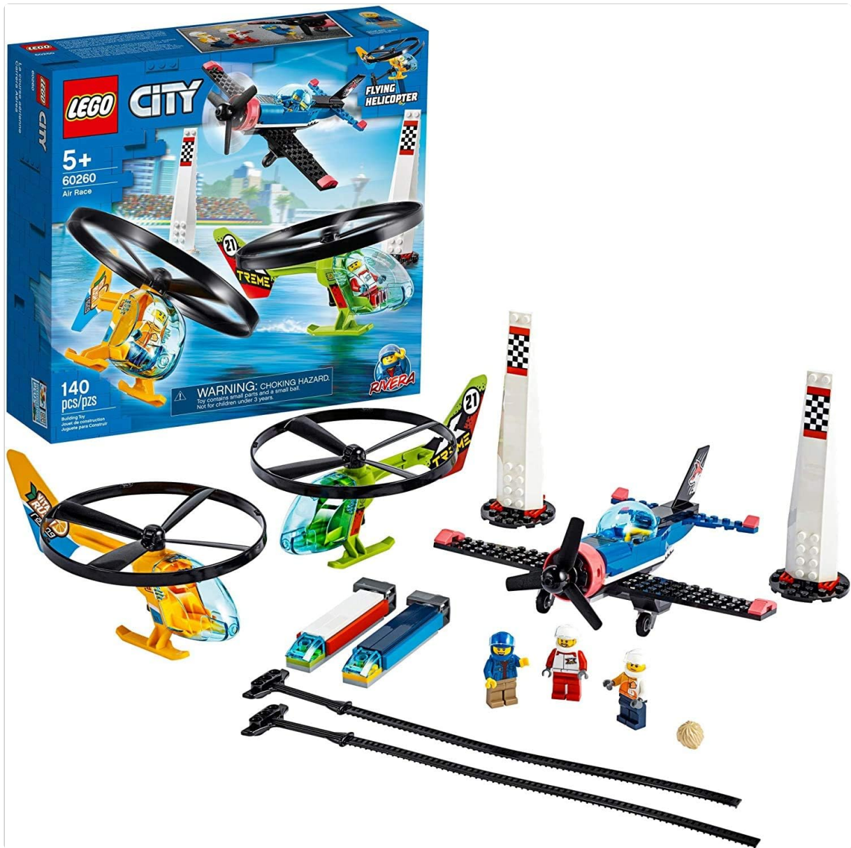
Figure 2: Overview of all included LEGO elements for the Air Race set.