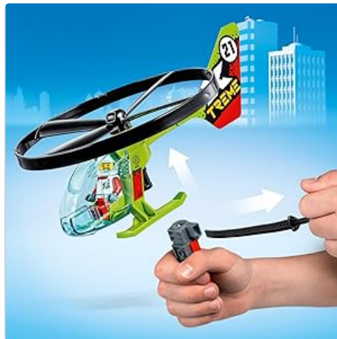
Figure 5: Demonstrating the ripcord mechanism for helicopter launch.