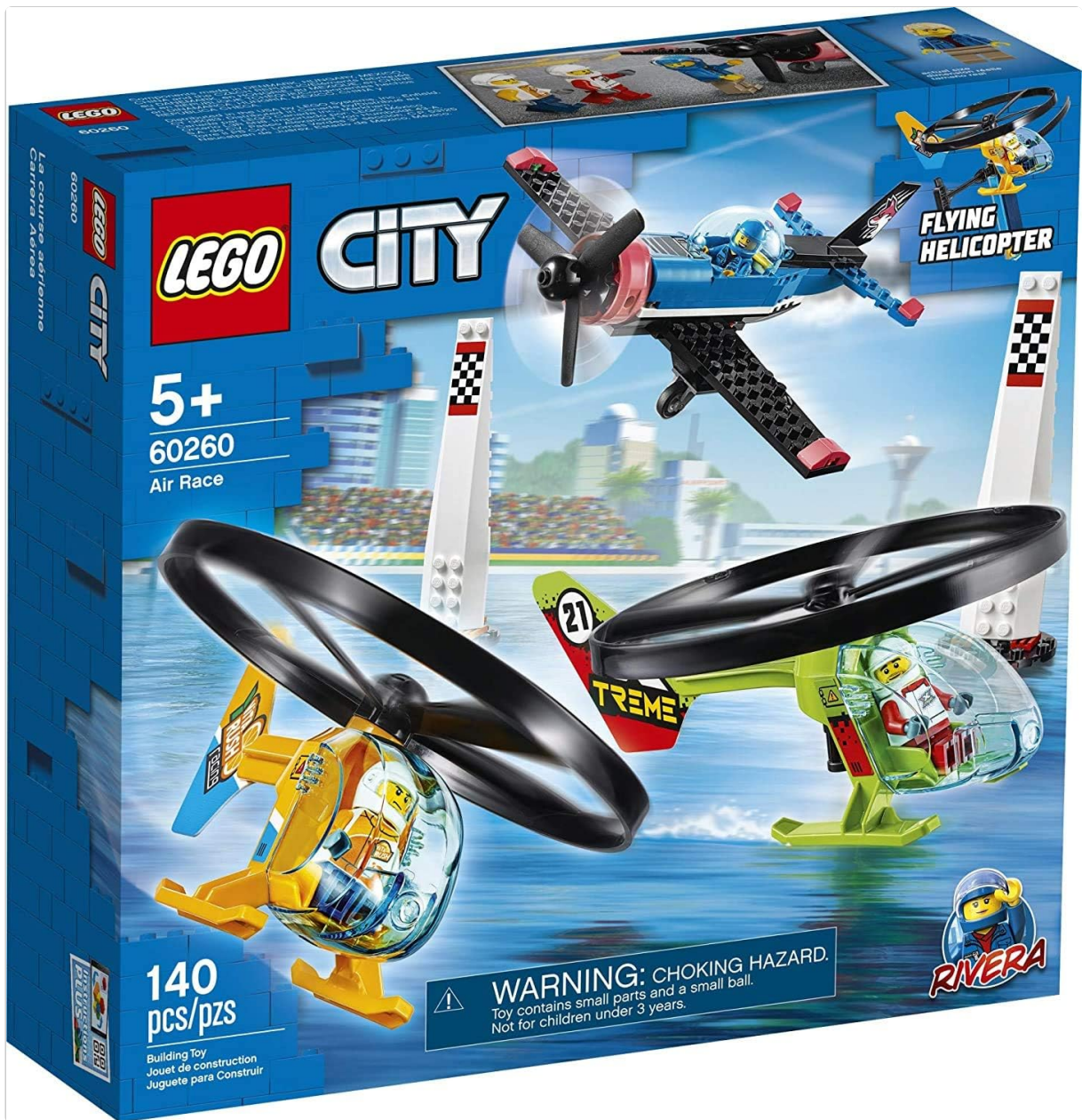
Figure 1: The LEGO City Air Race Set 60260 packaging, illustrating the main models and minifigures included.