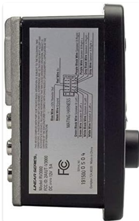
Figure 4.2: Detailed wiring diagram on the side of the RV3000.