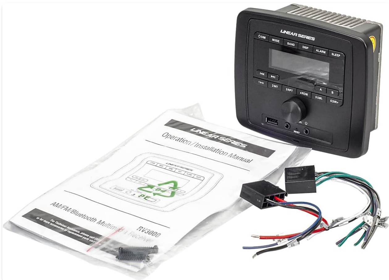
Figure 3.1: Magnadyne RV3000 Package Contents.