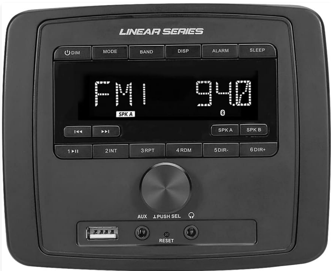
Figure 2.1: Front panel of the RV3000 receiver.