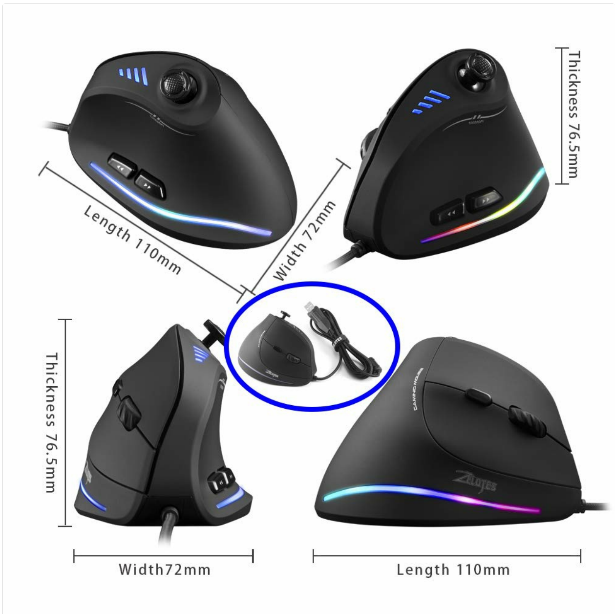
Image: Diagram illustrating the length, width, and thickness dimensions of the Zelotes C-18 mouse.