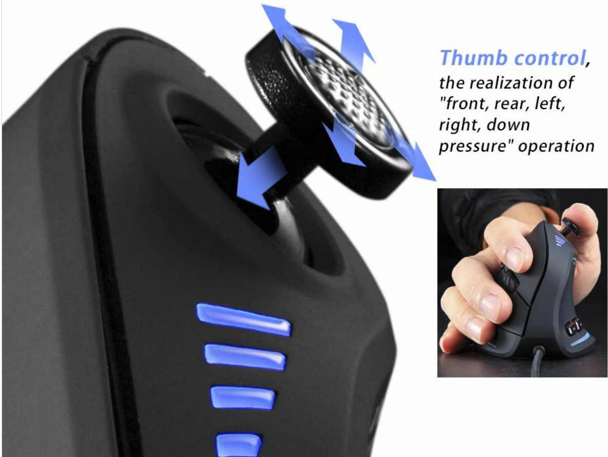
Image: Illustration of the 5-direction rocker (control bar) and how it is operated by the thumb for integrated orientation control.

Integrated orientation operation. 1 rocker equals 5 keys.