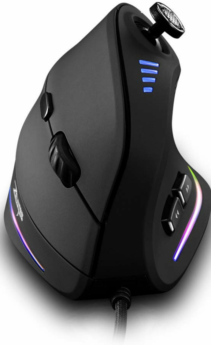
Image: The Zelotes C-18 Wired Vertical Gaming Mouse, showcasing its ergonomic design and integrated control bar.