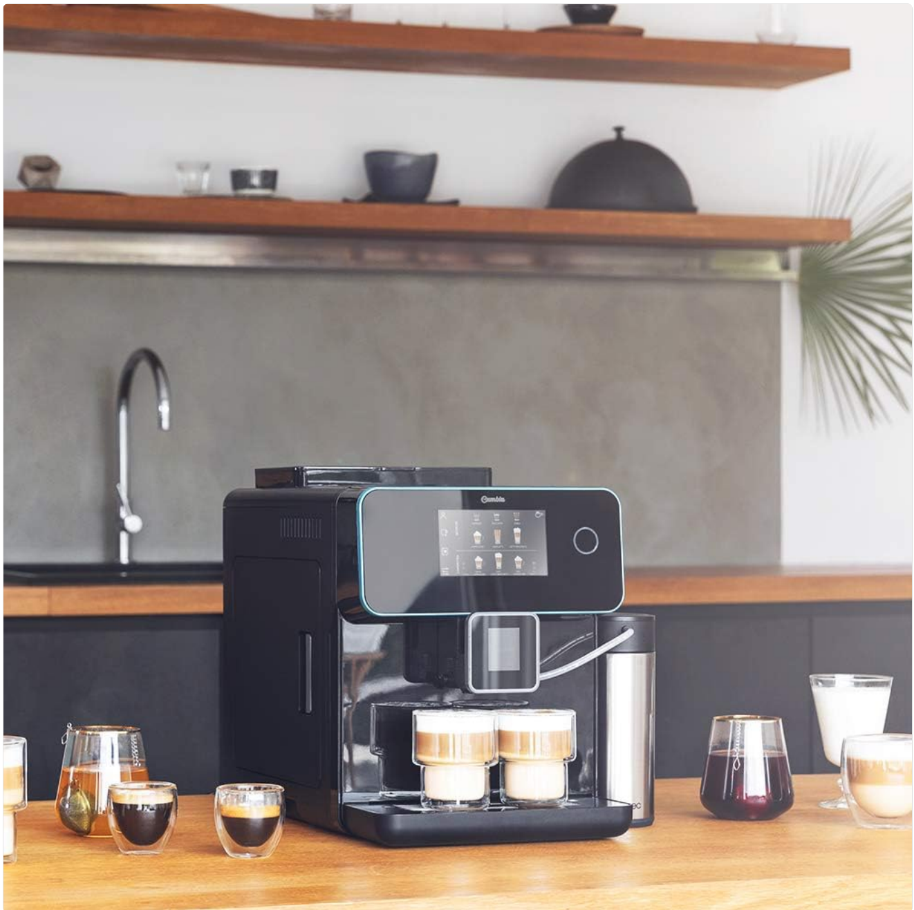
Figure 2: The coffee machine placed on a wooden kitchen counter, demonstrating its compact design. Several prepared coffee beverages are visible around the machine.