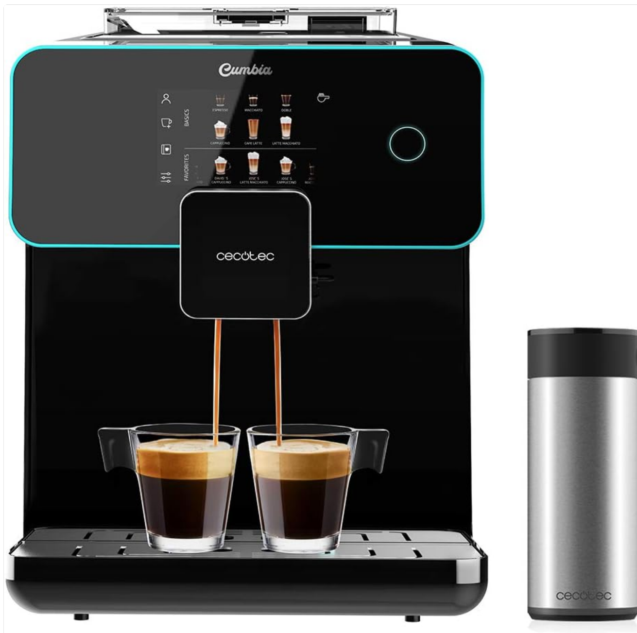
Figure 1: Front view of the Cecotec Cumbia Power Matic-ccino 9000, showing the main unit, control panel, coffee spouts, and milk frother container. Two cups are positioned to receive coffee.