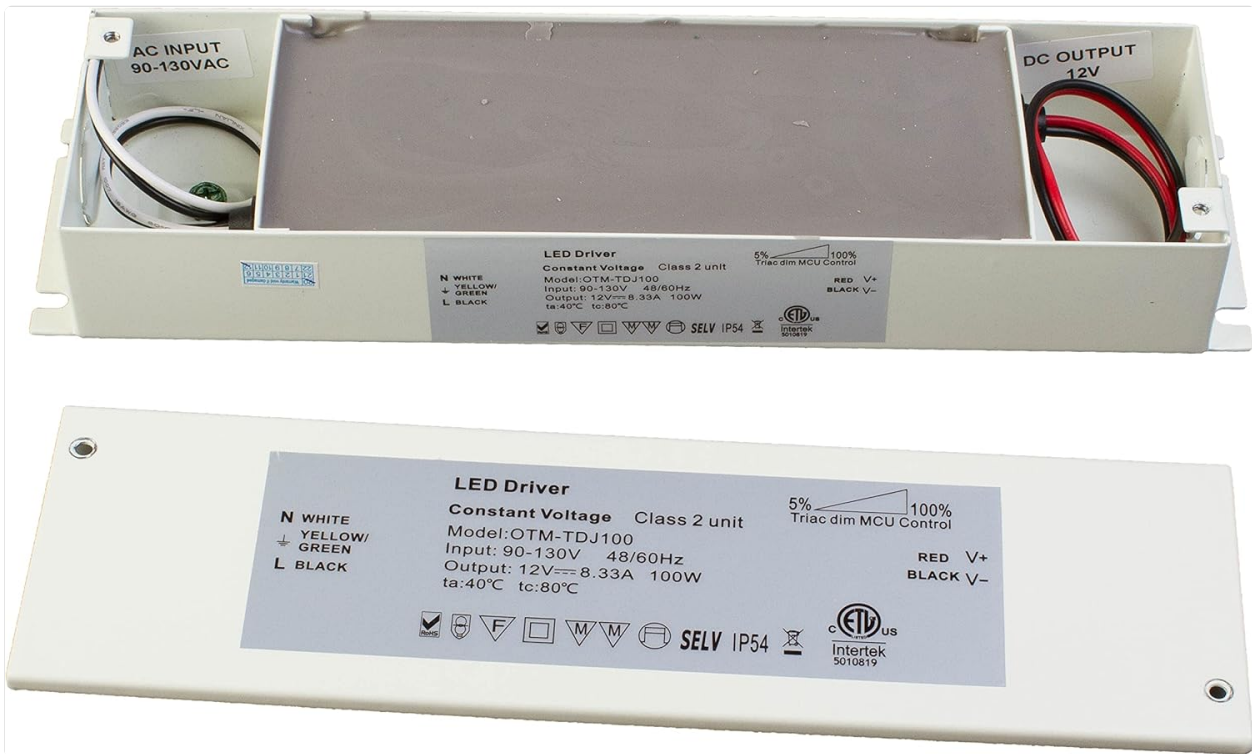
Image: The LEDUPDATES Triac Dimmable LED Driver with its junction box cover removed, revealing the AC input and DC output wiring terminals, and the internal power supply unit. The product label with specifications is visible.

protection and ease of installation. It features clearly labeled input and output terminals for straightforward wiring.