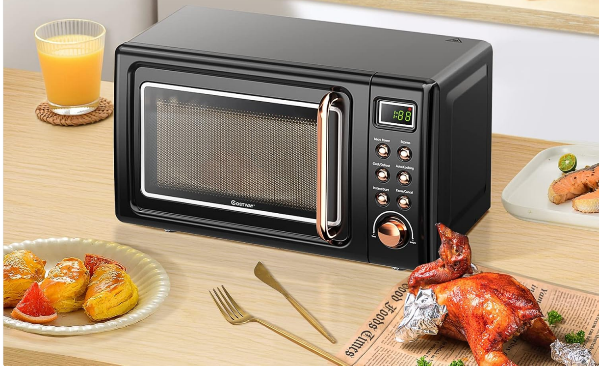
Figure 5.3: Auto-cook presets simplify cooking for various foods.

Control panel will be locked to protect your family