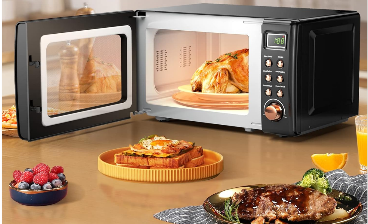
Figure 5.2: Power levels can be adjusted for different cooking needs.