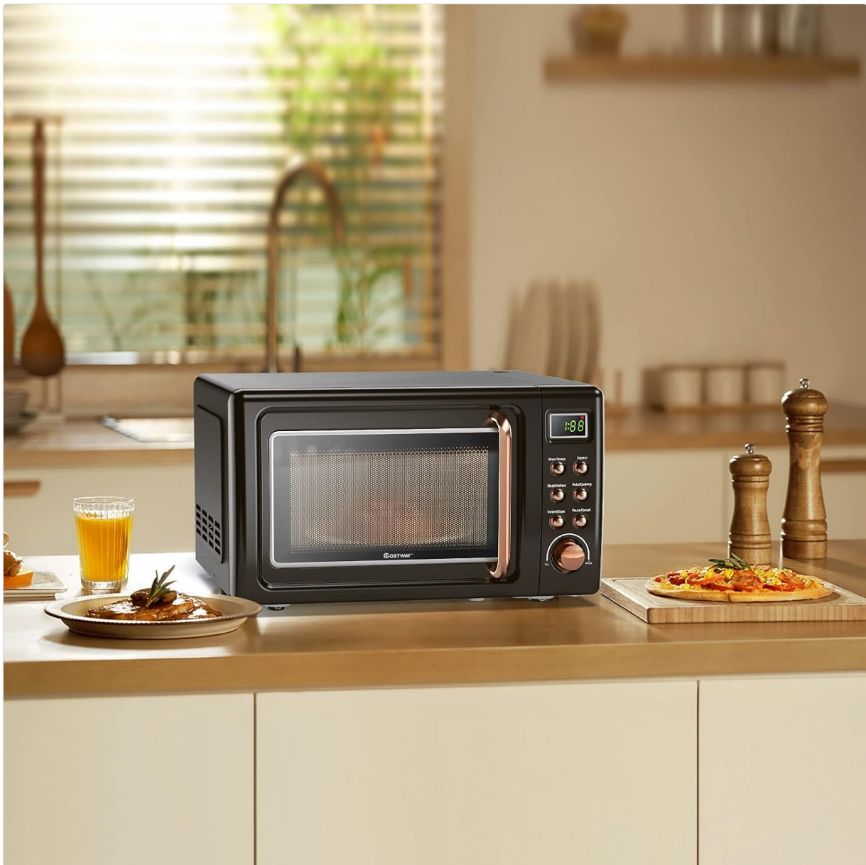
Figure 5.4: The child lock feature prevents accidental operation.