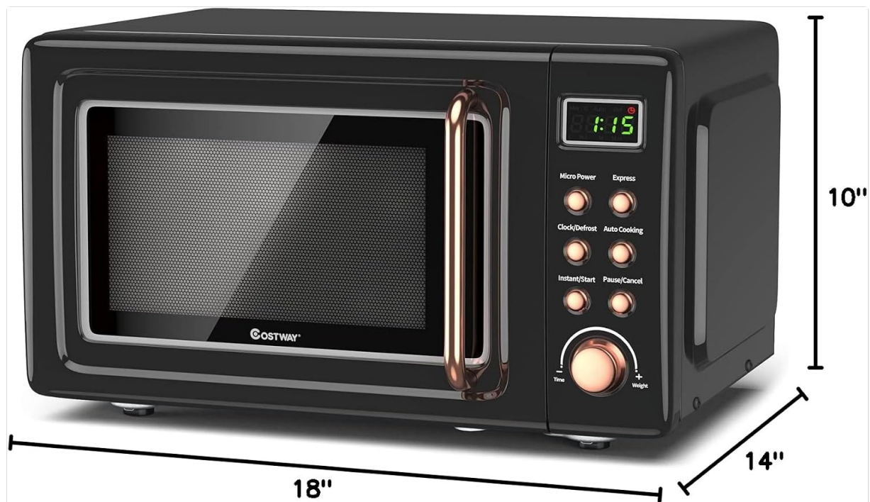
Figure 8.1: Product dimensions for planning placement.