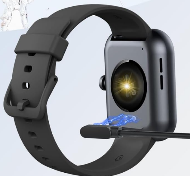
Image: The Donerton P32 Smartwatch connected to its magnetic USB charging cable, illustrating the charging process. Icons for IP68 waterproof rating and battery life are also visible.

A full charge typically takes approximately 1.5 to 2 hours. The battery indicator on the screen will show the charging status.