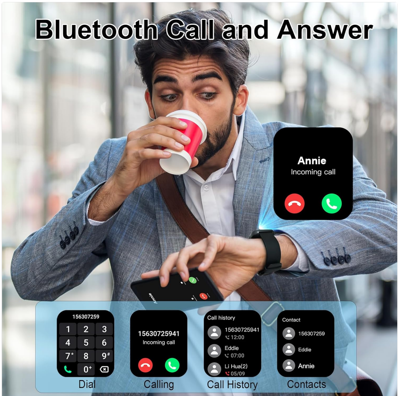
Image: A man interacting with the Donerton P32 Smartwatch to manage a Bluetooth call. The watch screen displays options for dialing, an incoming call, call history, and contacts, demonstrating its call management capabilities.