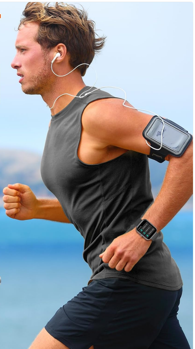
Image: A man running outdoors, wearing the Donerton P32 Smartwatch. The image highlights the '100+ Sport Modes Fitness Tracker' feature, displaying activity tracking metrics such as steps, distance, and calories on the watch face and a smartphone screen.