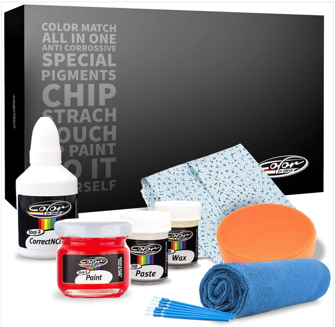
Image: Overview of the Color N Drive Touch Up Paint Kit, showing various bottles, cloths, and sponges.