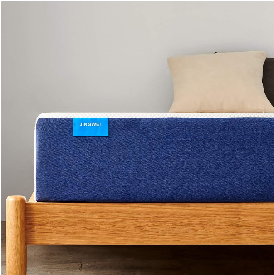
Image 2.2: The JINGWEI Queen Mattress fully expanded on a bed frame, ready for use.