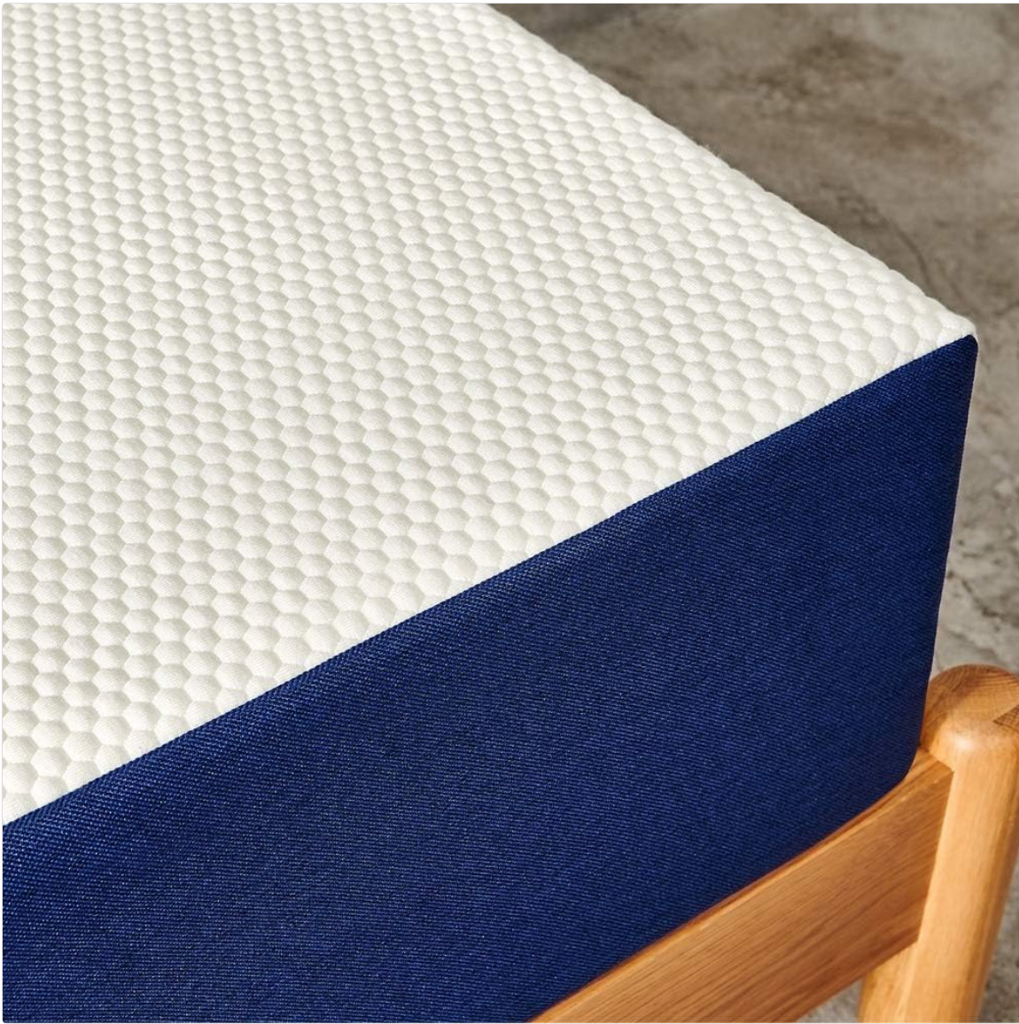
Image 3.2: A close-up view of the mattress surface, highlighting the breathable, textured cover material.