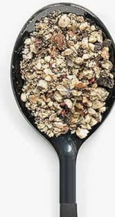
Image: A visual guide demonstrating how to adjust the coarseness of the grind by turning the plastic screw at the bottom of the mill. Examples of fine, medium, and coarse grinds are shown.