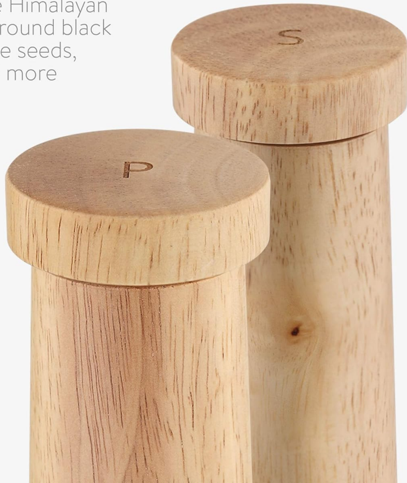
Image: The top of the Navaris salt and pepper mills, showing the 'S' and 'P' markings for easy identification of salt and pepper.

These grinders can be used for many different spices and seasonings like Himalayan salt, sea salt, ground black pepper, sesame seeds, chili flakes and more