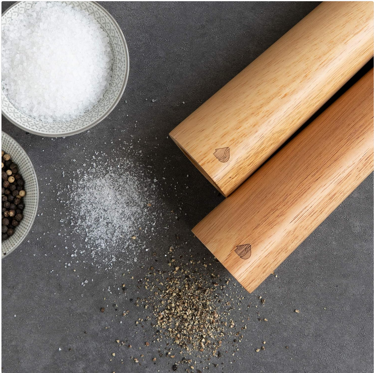
Image: Two Navaris mills actively grinding salt and pepper onto a dark surface, with bowls of whole salt and peppercorns nearby.