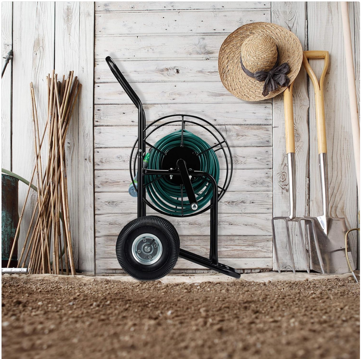
Image: The hose cart stored vertically against a wooden wall, showcasing its compact storage capability.