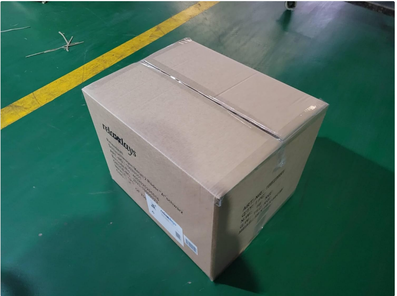
Image: The product packaging box, indicating the item is shipped in parts for assembly.