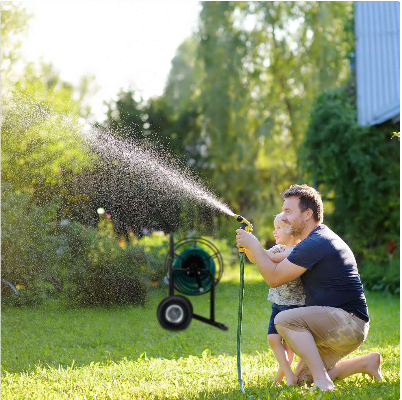
Image: The hose cart positioned in a garden while a person waters plants, demonstrating its portability and ease of use.

6. Storage: Once the hose is fully wound, the cart can be stored upright against a wall or in a shed.