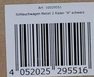
Image: A close-up of the product label on the box, showing the Relaxdays brand, model number 10029551, and barcode 4052025295516.