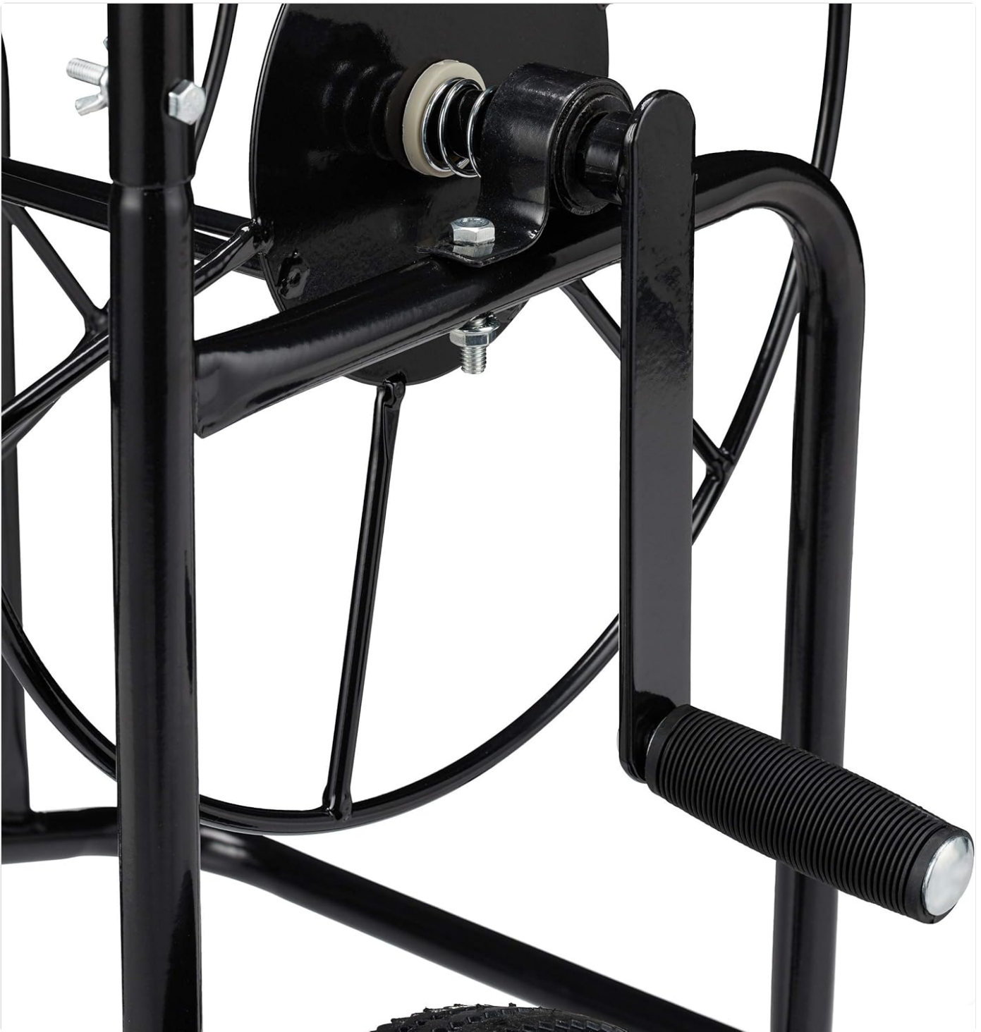
Image: A detailed view of the manual hand crank mechanism, used for winding the hose onto the reel.