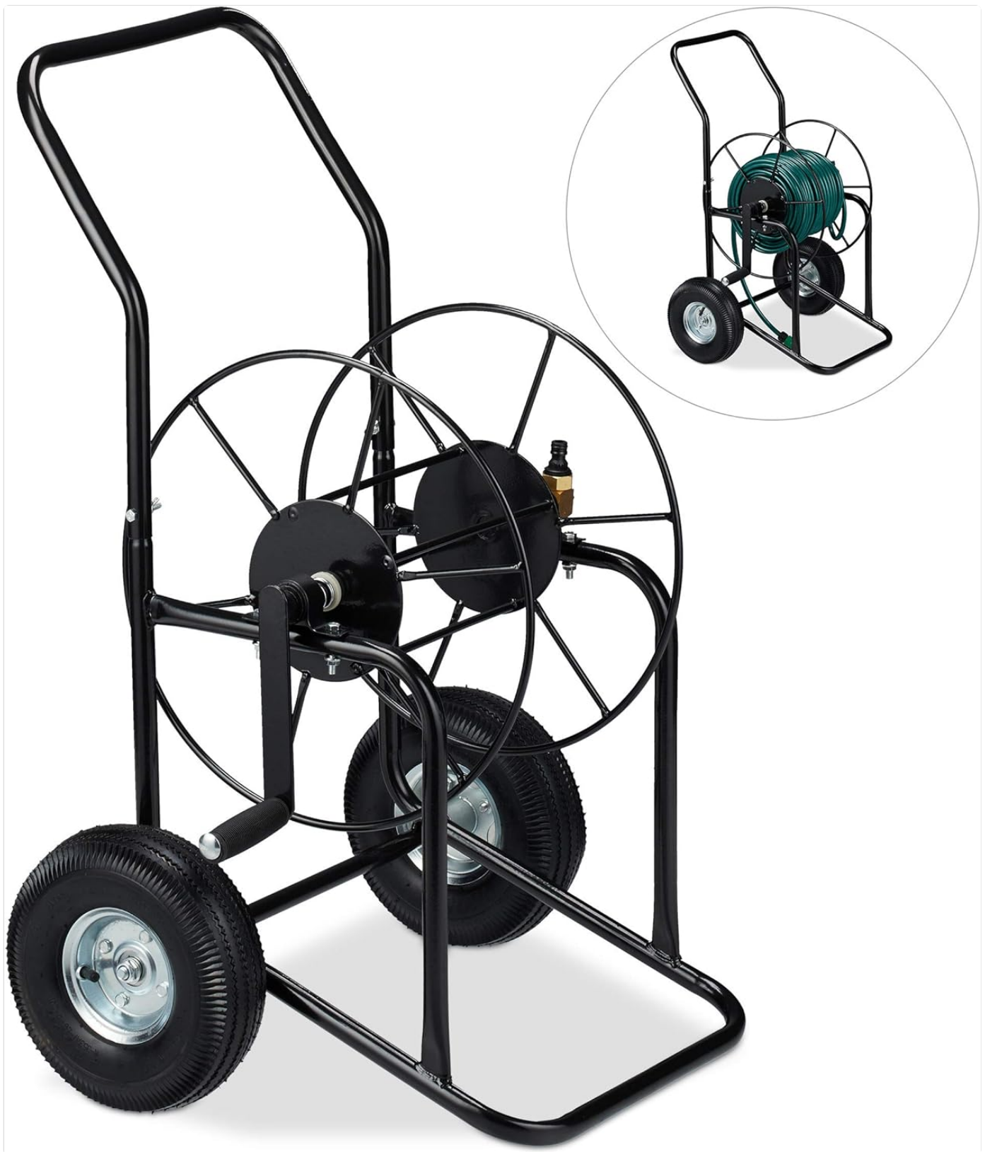
Image: The Relaxdays Black Hose Cart, shown without a hose, highlighting its sturdy metal frame and two large wheels.