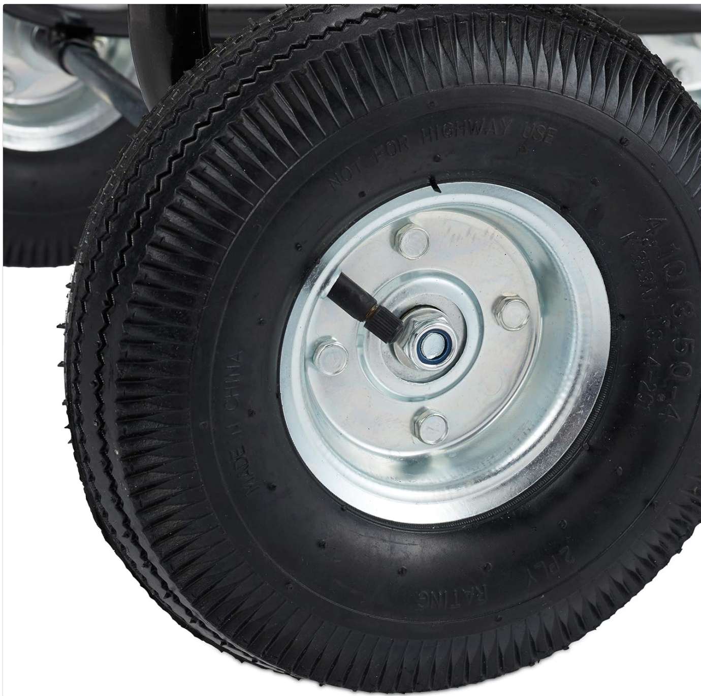
Image: A close-up view of one of the durable plastic wheels with treads, essential for mobility.