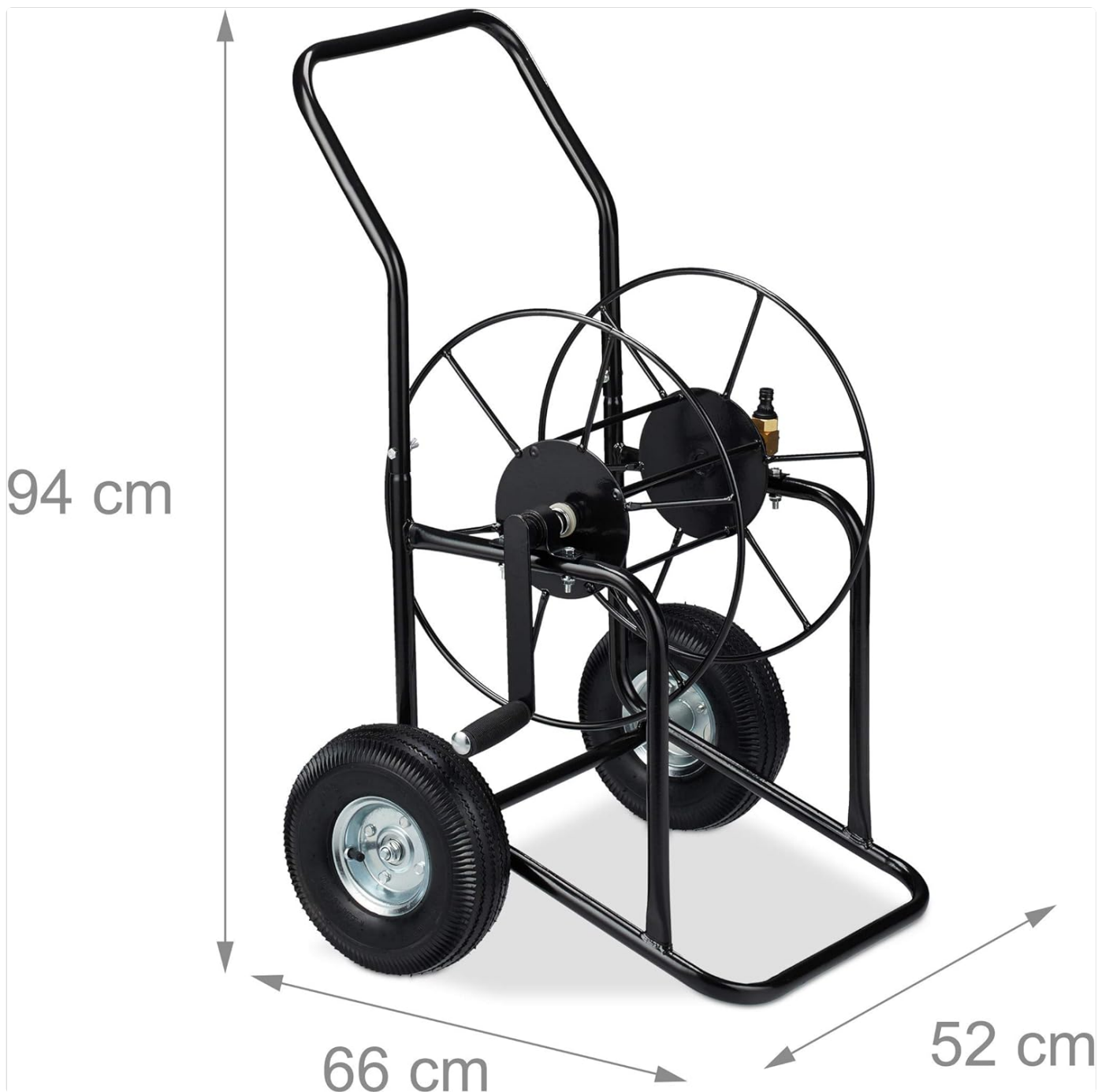
Image: A diagram illustrating the key dimensions of the hose cart: 94 cm height, 66 cm width, and 52 cm depth.