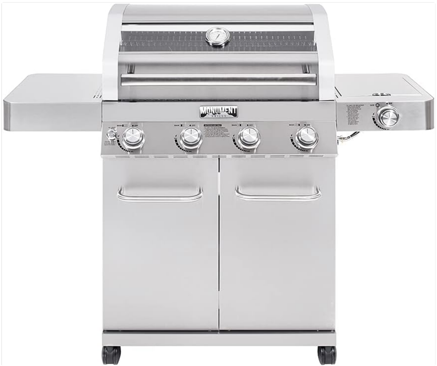
Figure 1: Front view of the Monument Grills 4-Burner Gas Grill, showcasing its stainless steel construction and cabinet style.