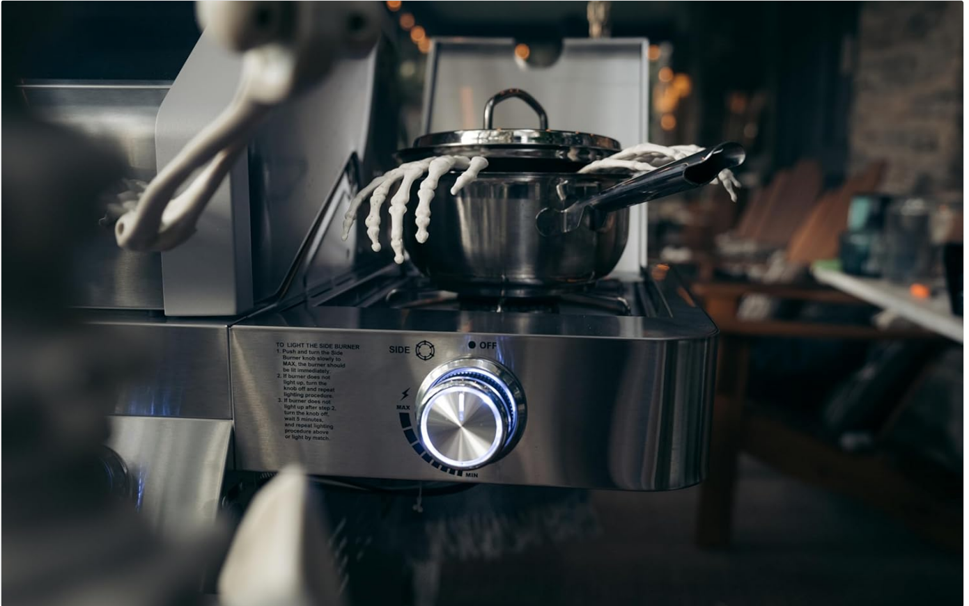
Figure 3: The integrated side burner, suitable for preparing sauces or side dishes.