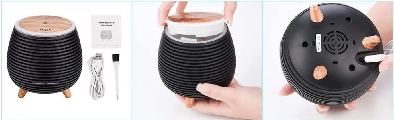
1. The Package