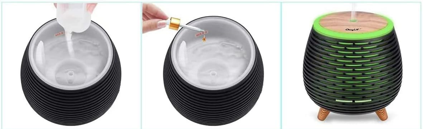
4. Add pure water