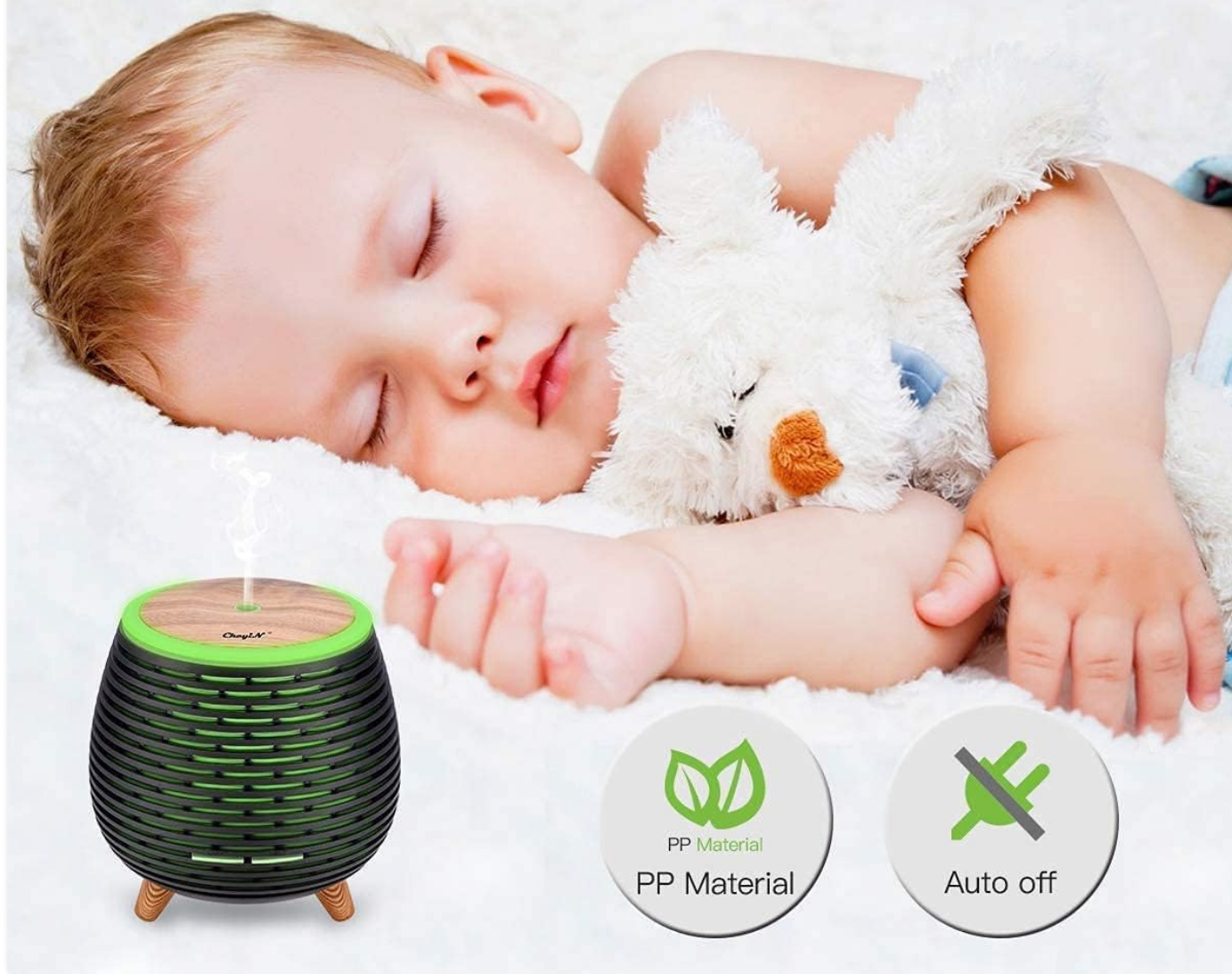
Image: The diffuser is made of BPA-free material and includes a waterless auto-off function, ensuring safety for all users, including babies.

100% Safe for babies and pregnant women, eco friendly