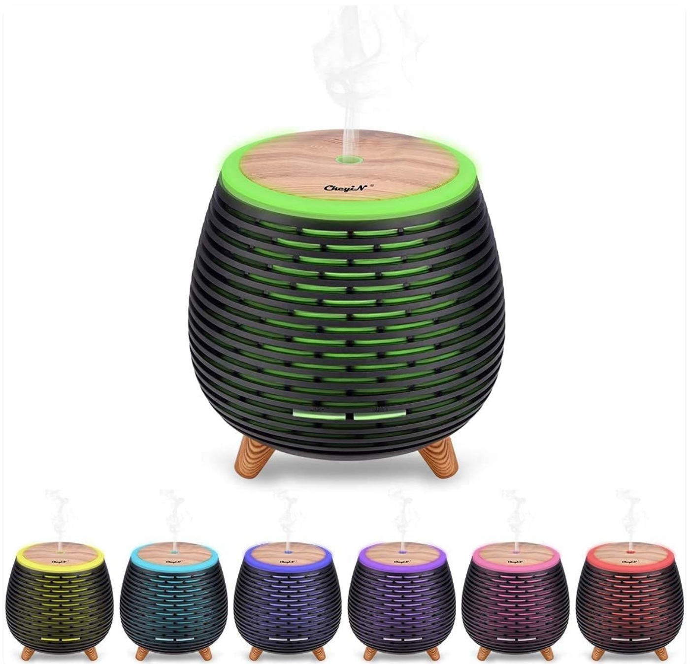
Image: The CkeyiN Mini Aromatherapy Diffuser, demonstrating its mist output and the range of 7 LED light colors available.