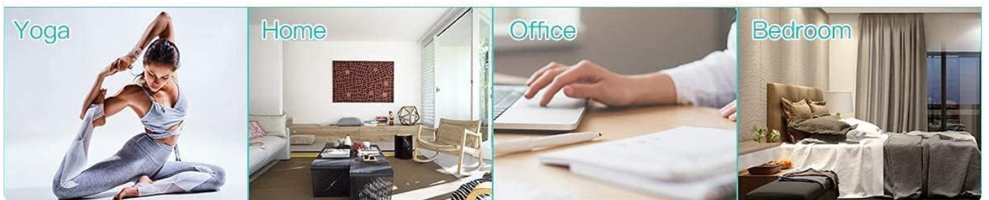
Image: The diffuser is suitable for various environments, including yoga spaces, homes, offices, and bedrooms, providing comfortable fragrance.

Comfortable Fragrance It can be Used in many Occasions.