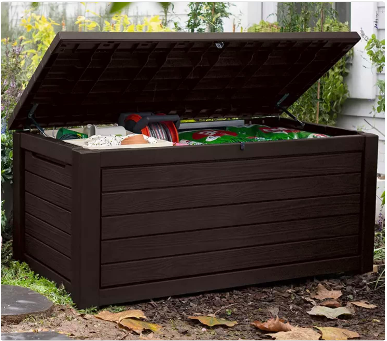
Image: The Keter Deck Box with its lid fully open, revealing a variety of stored outdoor items.