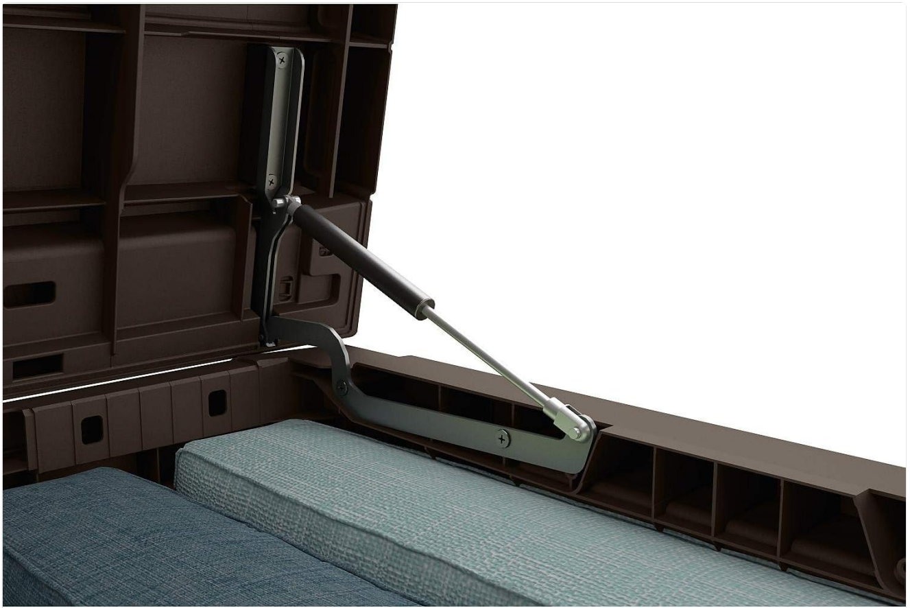
Image: A detailed view of the hydraulic arm that supports the lid, ensuring smooth and controlled opening and closing.