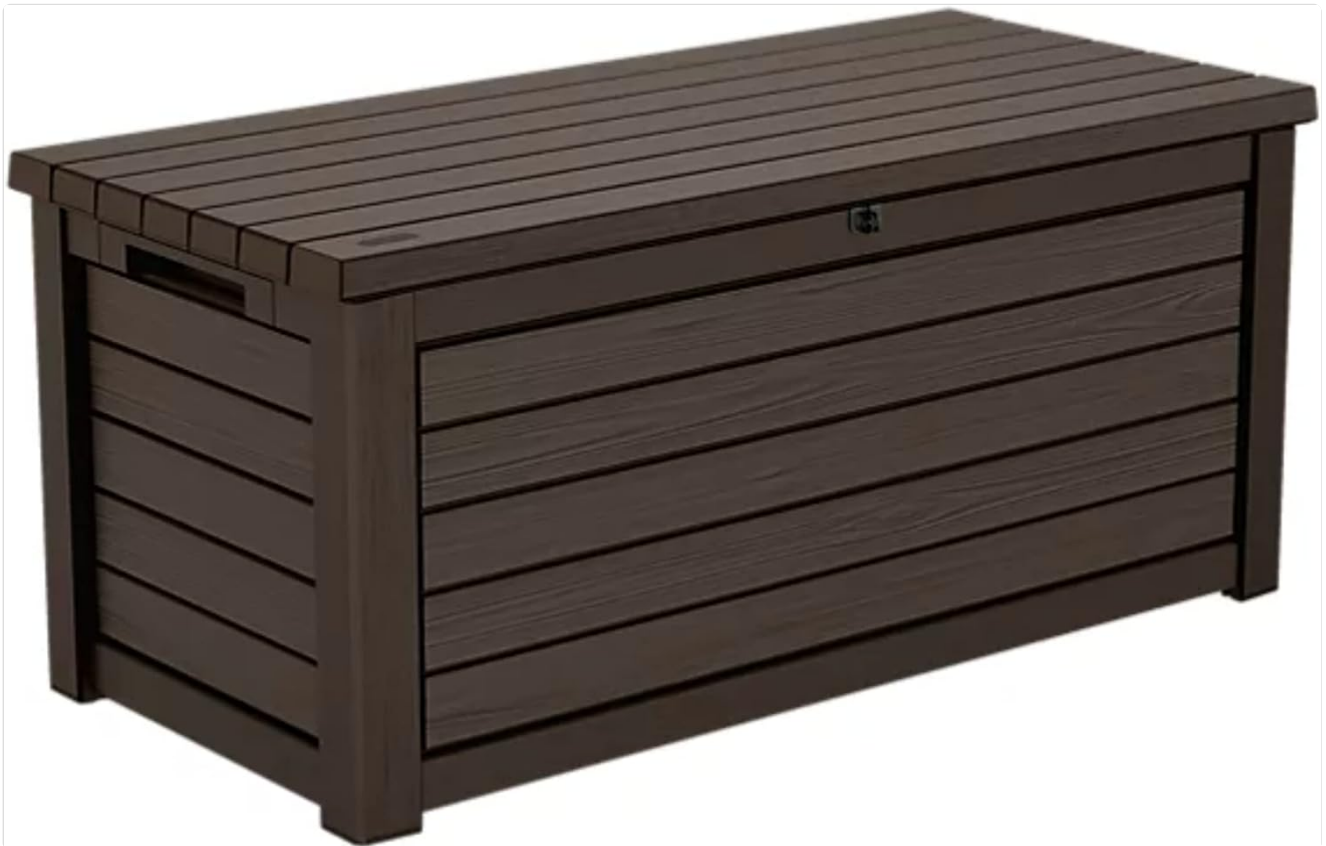
Image: The Keter 165-Gallon Resin Outdoor Deck Box in its closed state, showcasing its wood-look texture and brown espresso color.