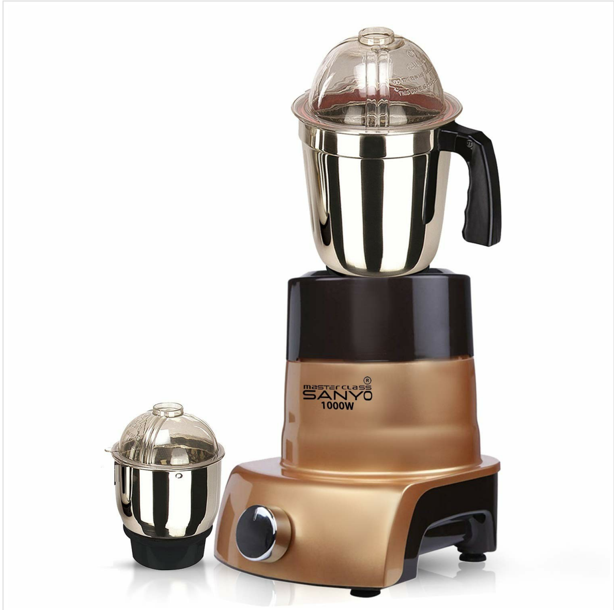
Figure 3.1: Master Class Sanyo Mixer Grinder motor unit with the large and small jars.