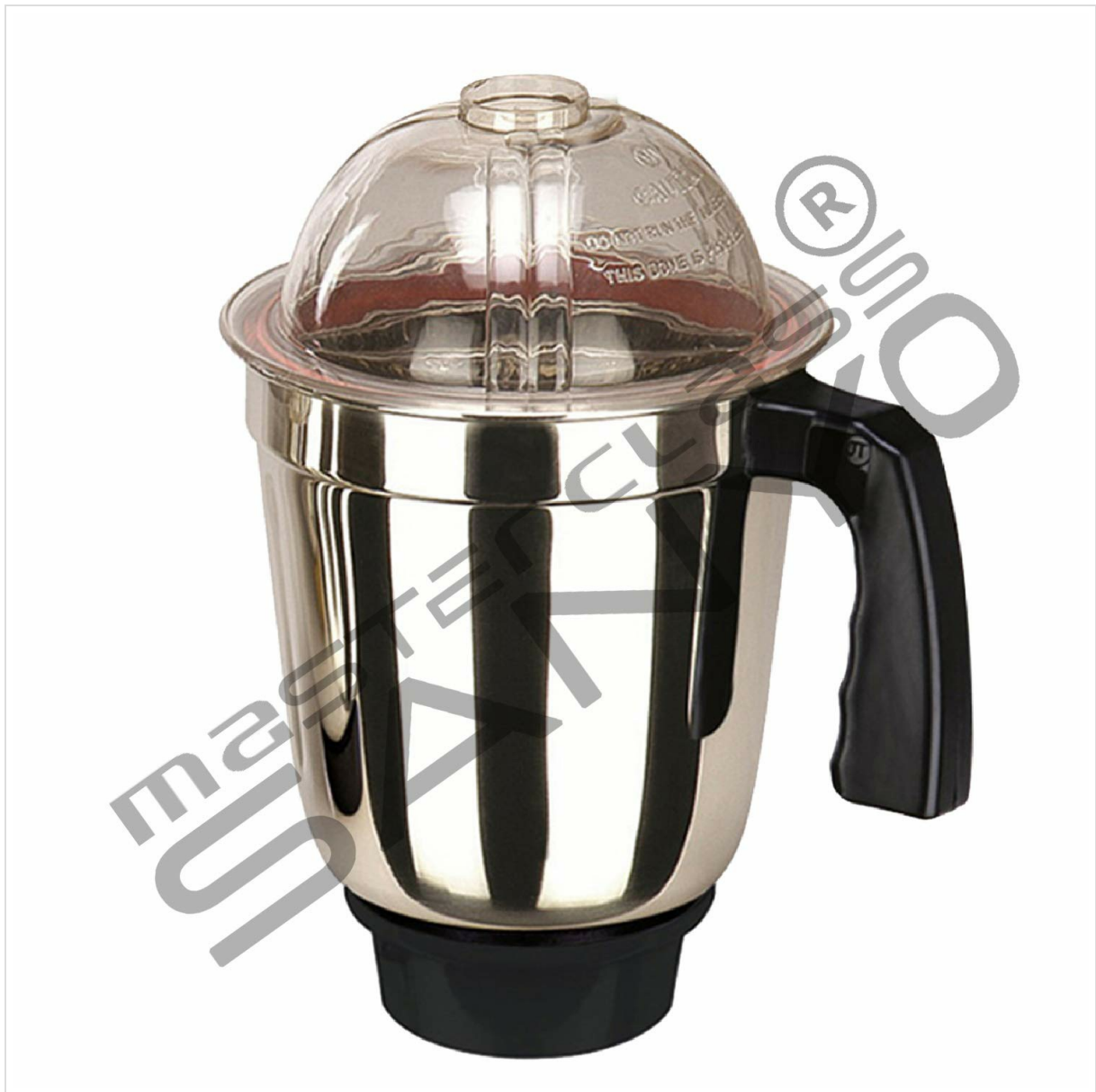
Figure 3.4: The 0.3-liter chutney jar with transparent lid.