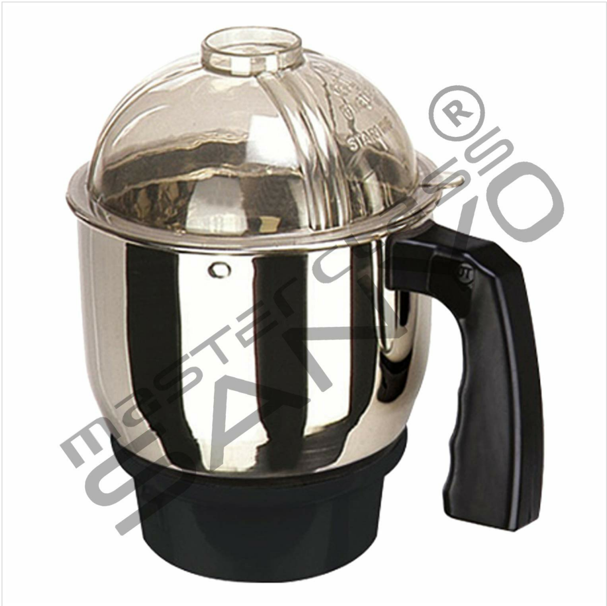
Figure 3.3: The 1-liter dry grinding jar with handle and transparent lid.