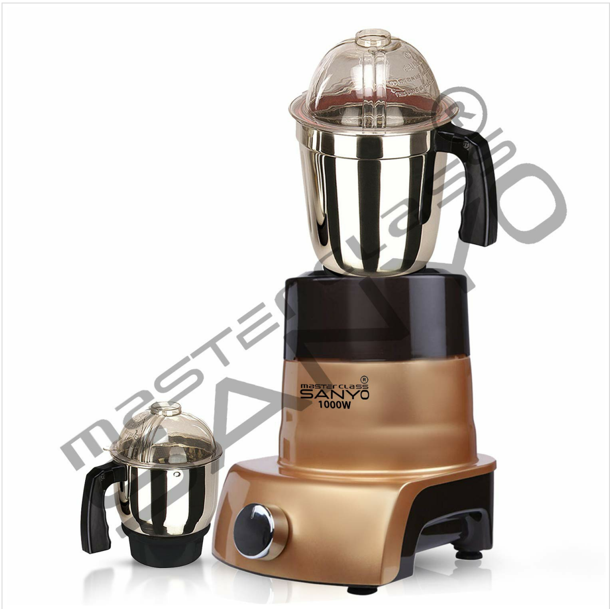
Figure 3.2: The 1.5-liter wet grinding jar with handle and transparent lid.