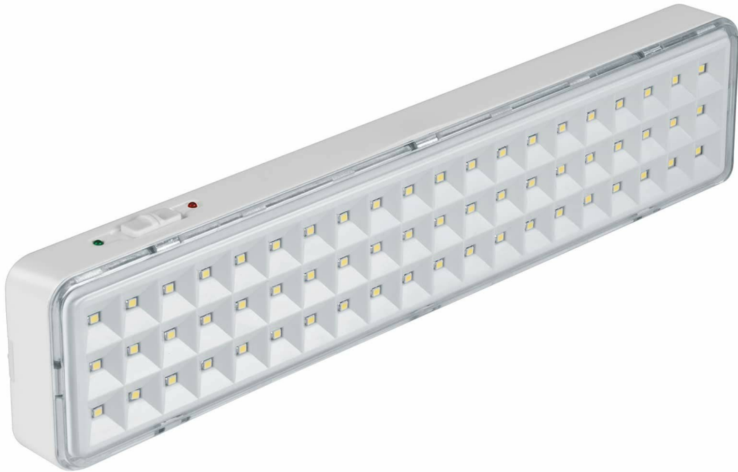
Figure 1: Volteck LAE-60 Rechargeable Emergency Lamp