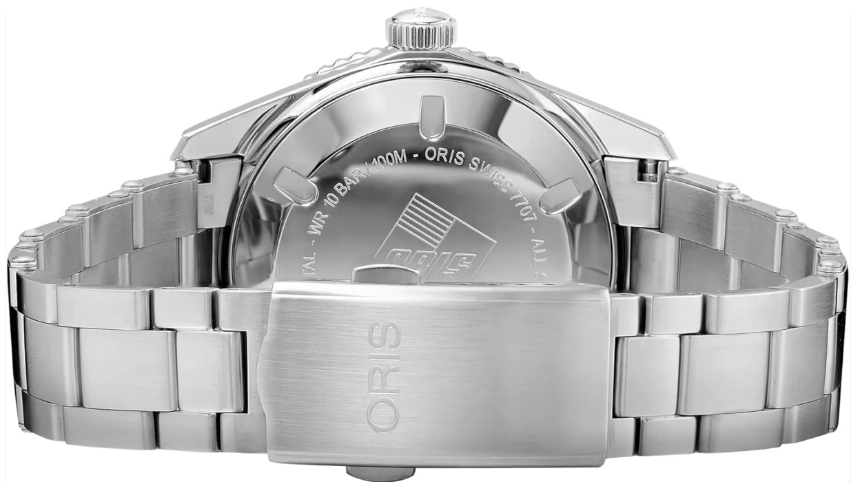
Image 4.1: Rear view of the Oris Divers Sixty-Five, displaying the engraved case back and the folding clasp of the stainless steel bracelet.

When not wearing your watch for an extended period, store it in a cool, dry place, away from direct sunlight and strong magnetic fields. The original watch box is ideal for storage.