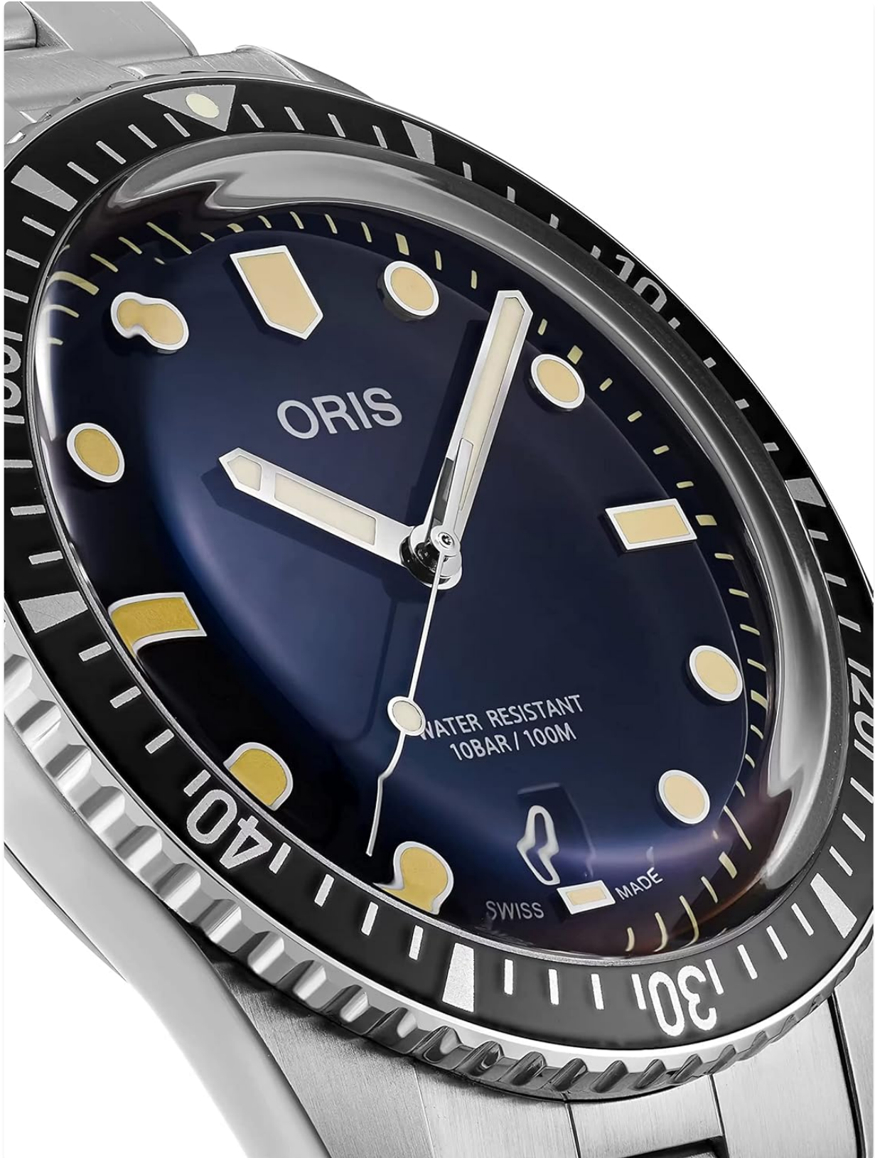
Image 2.2: Detailed view of the watch dial and crown, illustrating the components used for time and date adjustment.