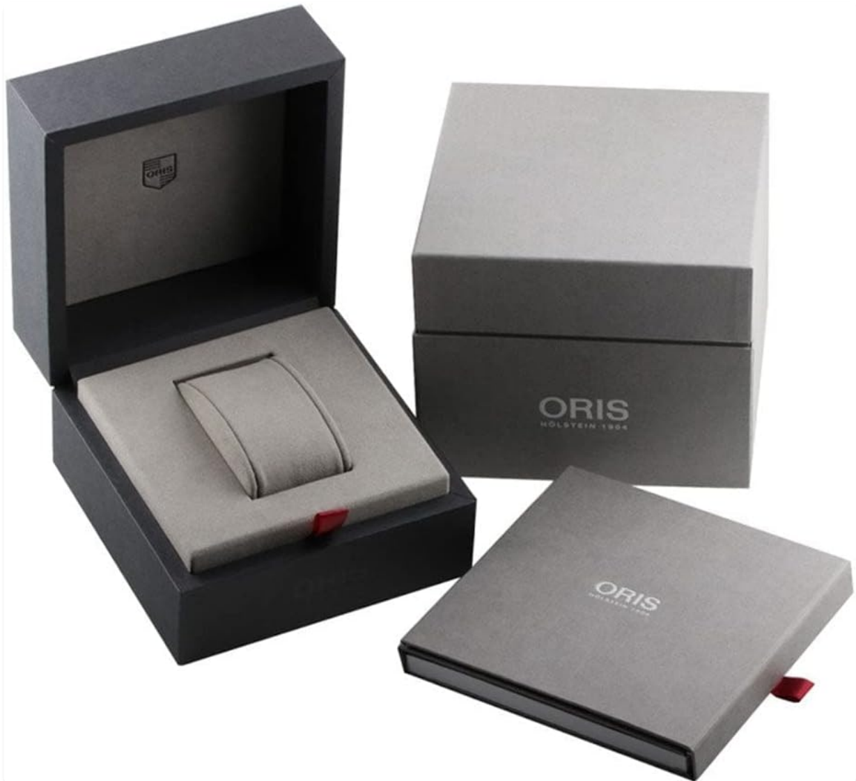
Image 2.1: The Oris watch presented within its dedicated packaging box.

Your Oris watch comes in its original packaging. Carefully remove the watch and inspect it for any visible damage. Ensure all protective films are removed before use.