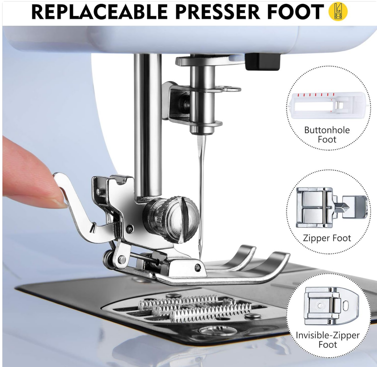
Figure 6: Close-up view of the replaceable presser feet, including the buttonhole foot, zipper foot, and invisible-zipper foot, demonstrating their quick-change mechanism.

The accessory kit includes various replaceable presser feet for specific tasks, such as sewing buttons, zippers, and invisible zippers.