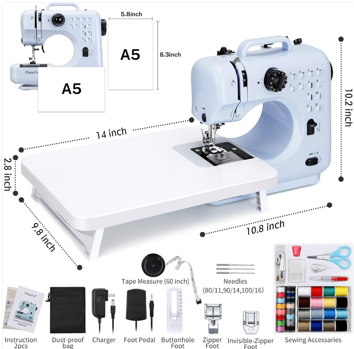
Figure 2: Overview of the Magicfly MF5076 Sewing Machine with its dimensions (9.8"D x 14"W x 10.2"H) and a comprehensive accessory kit including instruction manuals, dust-proof bag, charger, foot pedal, buttonhole foot, zipper foot, invisible zipper foot, needles (80/11, 90/14, 100/16), and a 42-piece sewing accessory set.