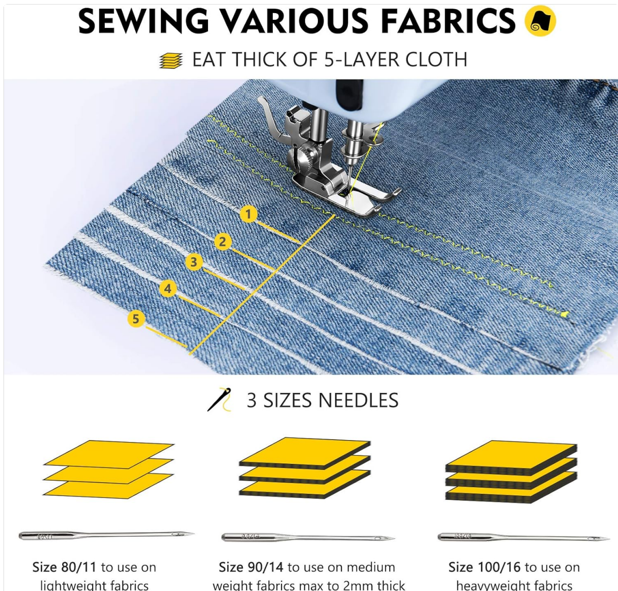
Figure 5: Illustration of the three needle sizes (80/11, 90/14, 100/16) and their recommended fabric thicknesses for optimal sewing performance.