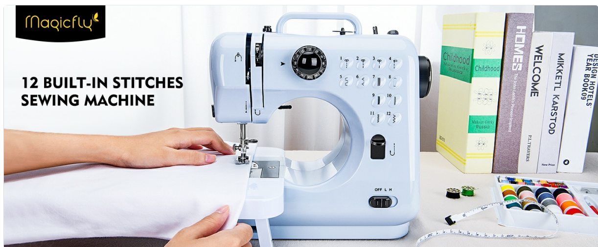
Figure 3: The Magicfly MF5076 Portable Sewing Machine with its extension table attached, providing an expanded workspace for larger fabric pieces.

The included extension table provides a larger working surface for bigger projects. To attach, simply align the table's opening with the machine's free arm and slide it into place until it clicks securely. Ensure the table's legs are folded out for stability.