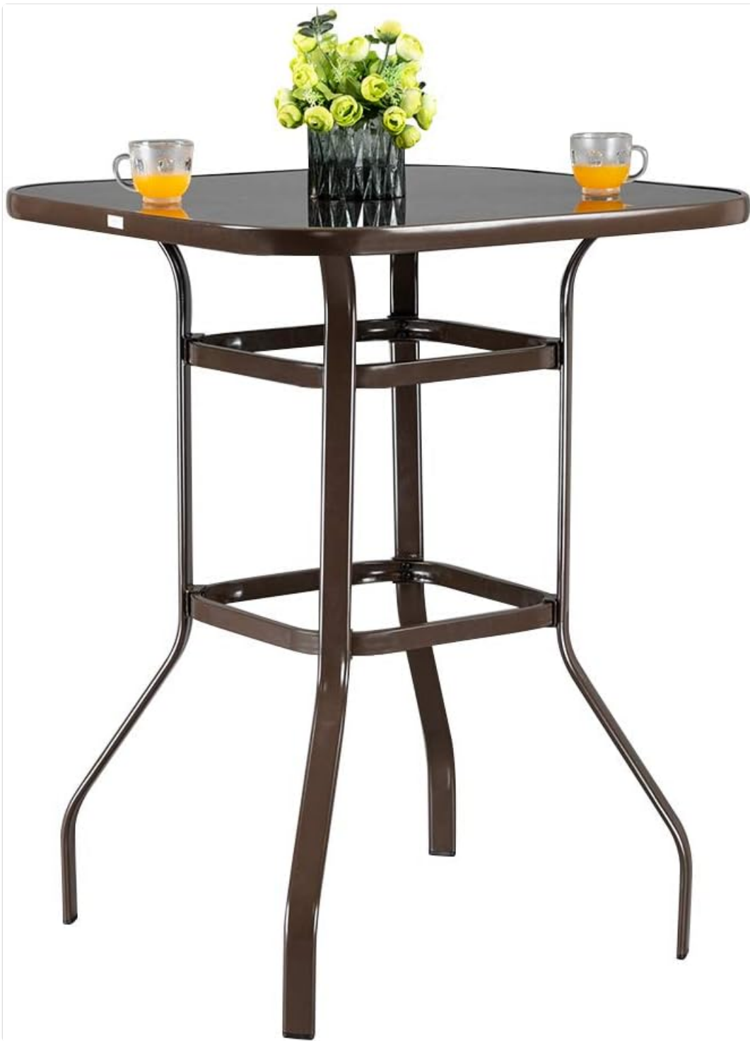
Image 1.1: VINGLI 32-inch Indoor-Outdoor Bar Height Table (Brown variant).