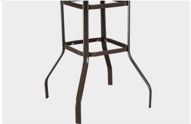
Image 3.1: The metal frame structure of the VINGLI Bar Height Table, showing the base and support tiers.