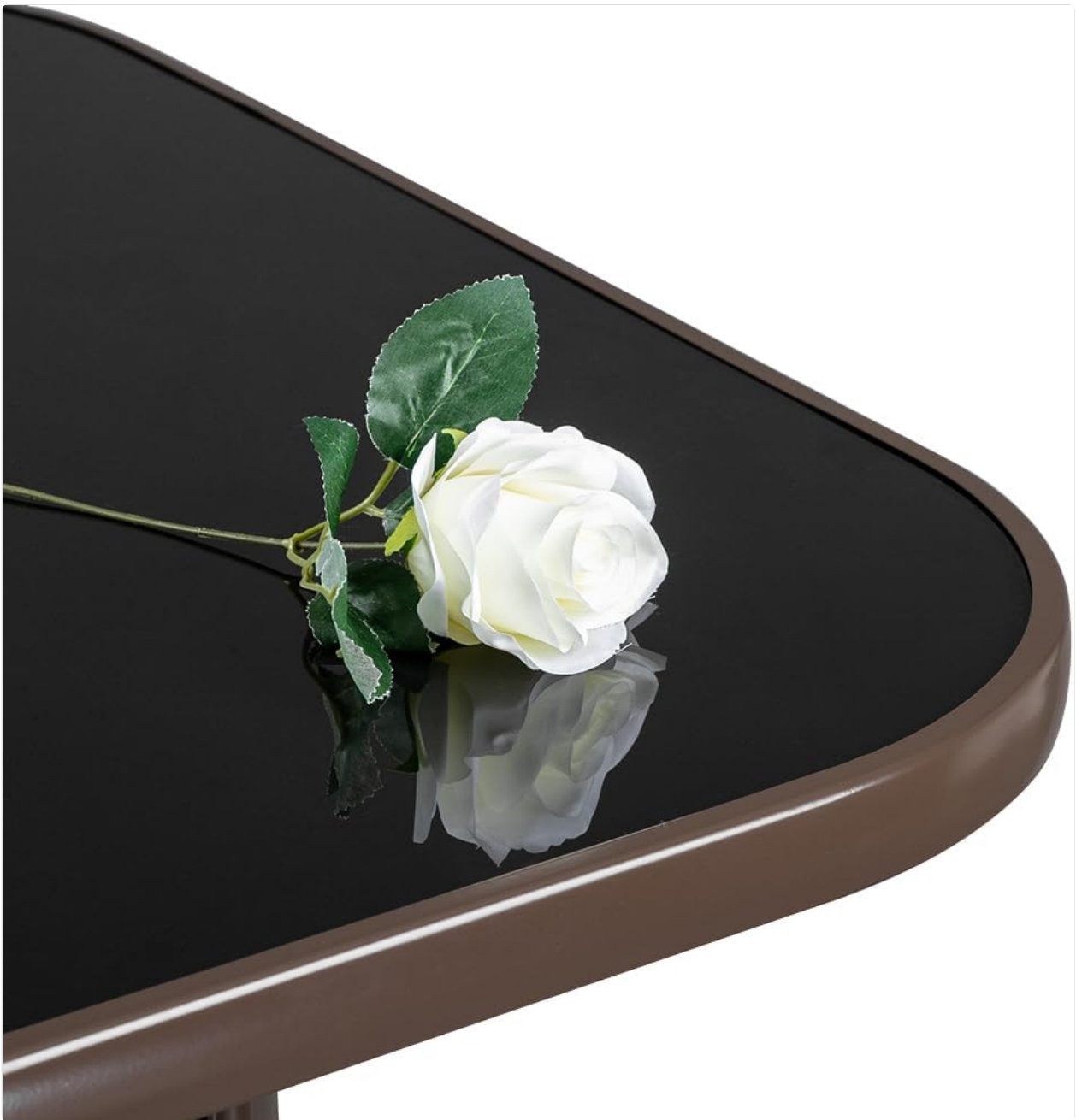
Image 3.2: Close-up view of the tempered glass table top, highlighting its smooth surface.