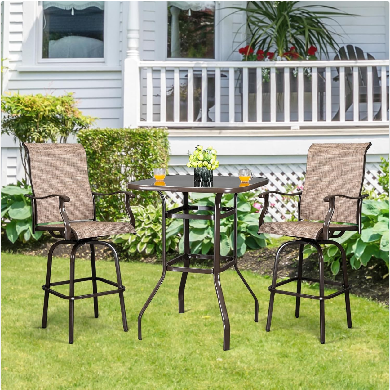
Image 4.1: The VINGLI Bar Height Table set up on an outdoor patio with accompanying chairs.