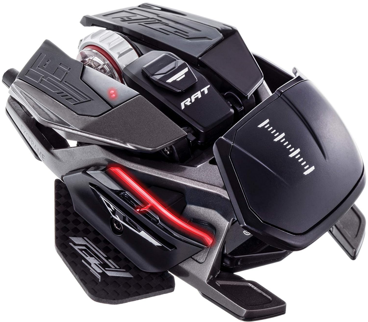
Figure 1: Top-down view of the Mad Catz R.A.T. PRO X3 Gaming Mouse.