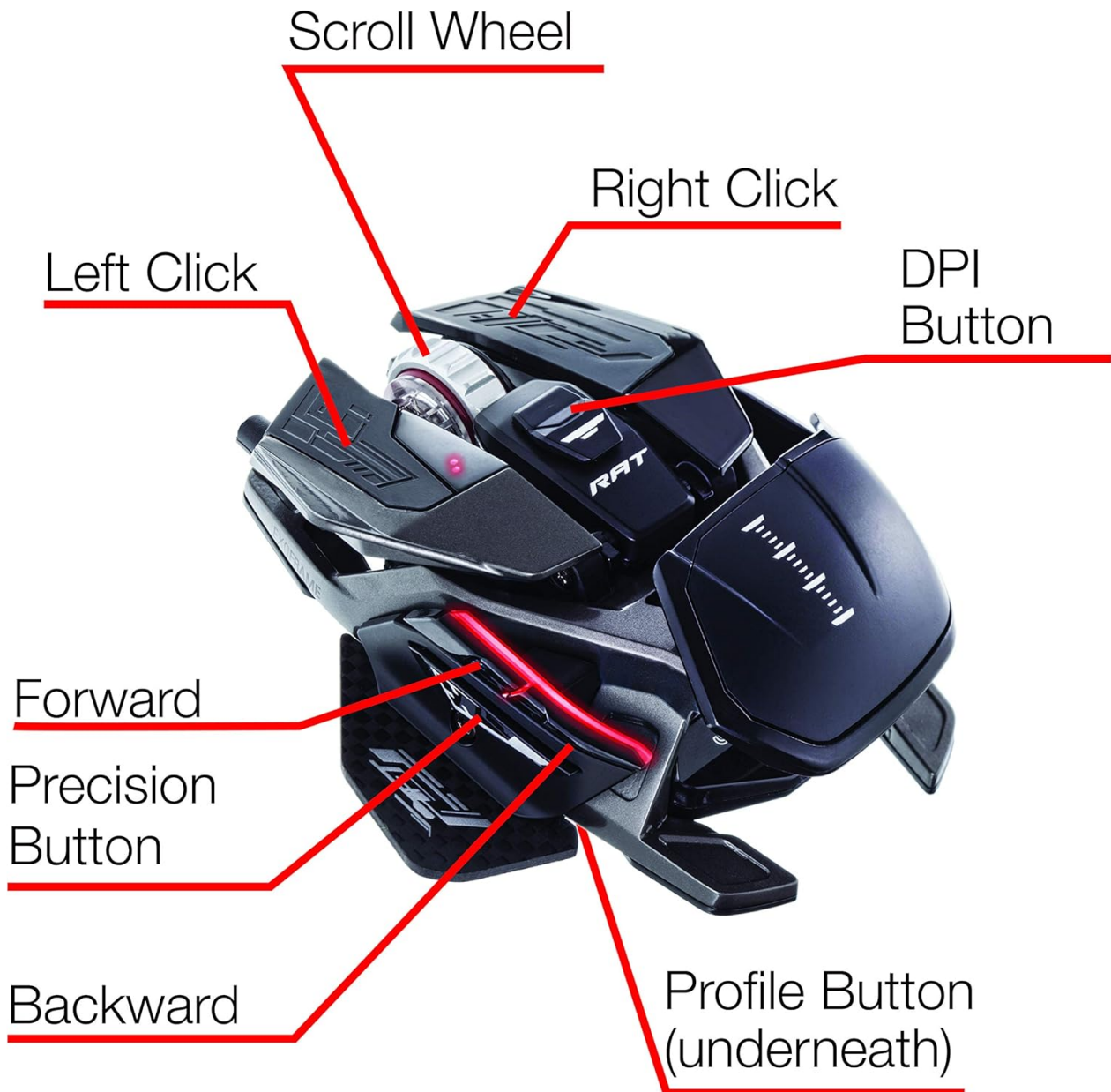
Figure 4: Labeled buttons and controls on the R.A.T. PRO X3 mouse.