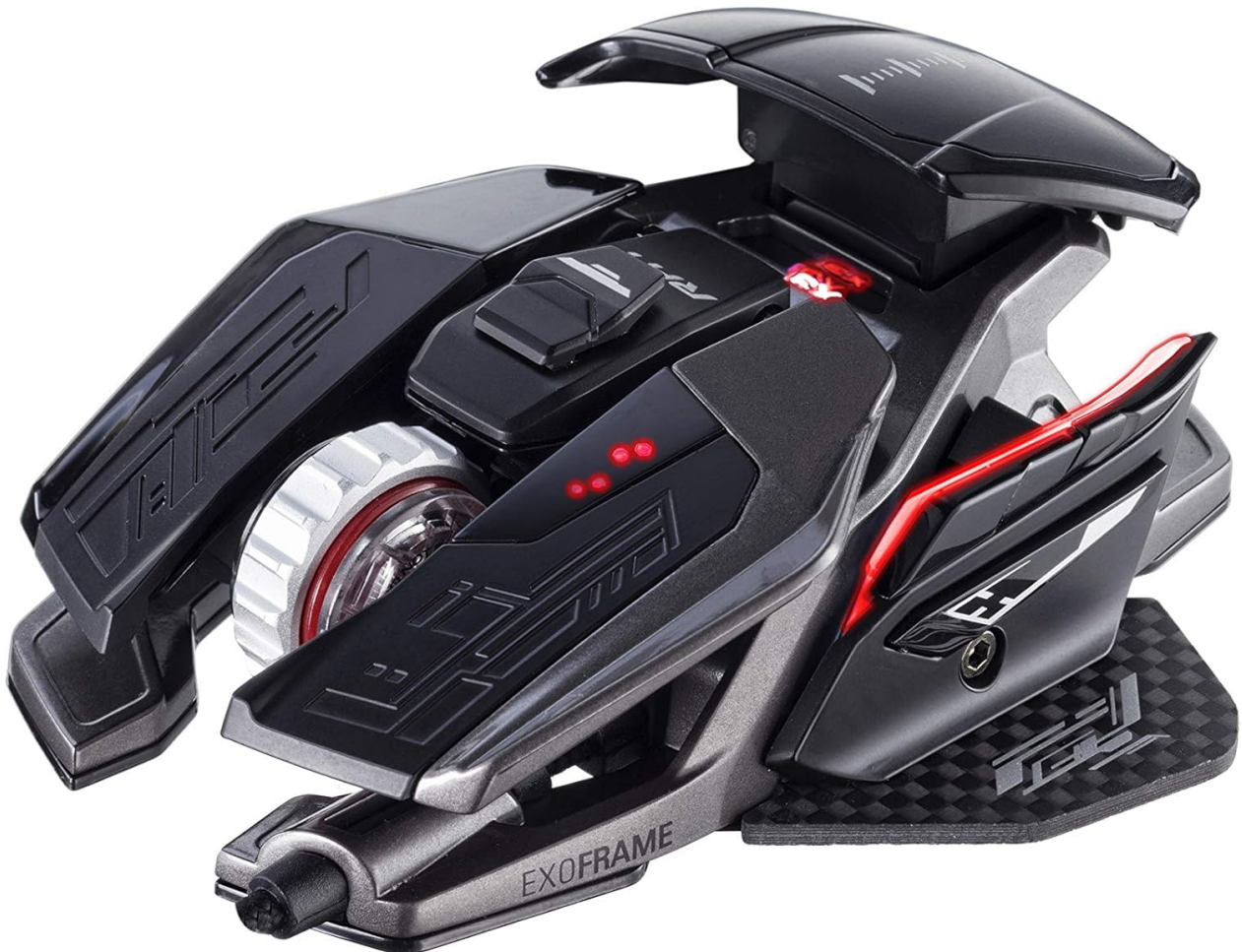
Figure 3: The R.A.T. PRO X3 mouse showcasing its adjustable components.