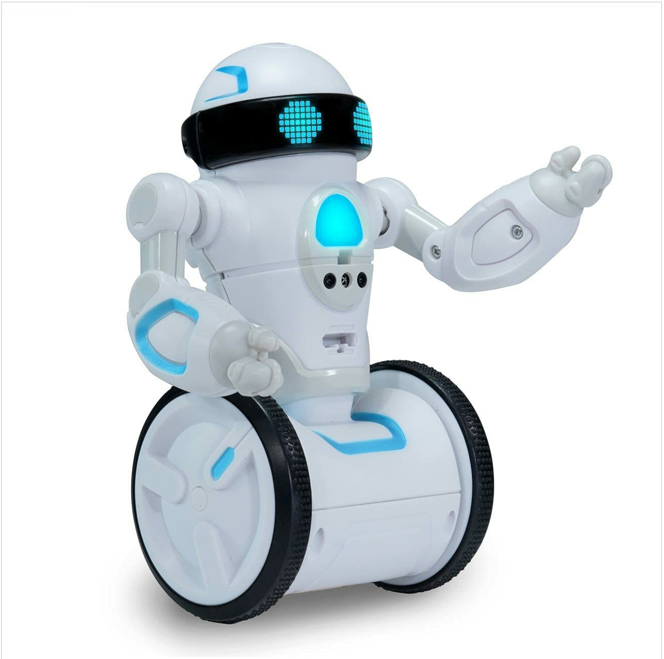
Image: The MiP Arcade robot in its upright, self-balancing position, showcasing its design.

The MiP Arcade robot is designed to self-balance on its two wheels. It can move forward, backward, and turn. Its arms are articulated and can be moved manually or as part of programmed actions.