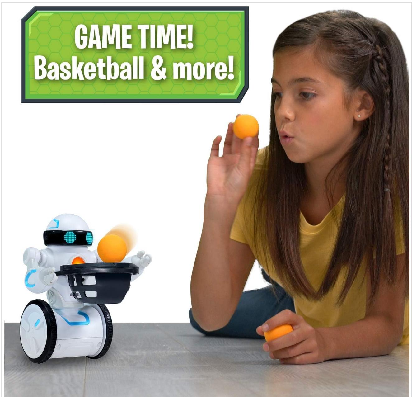
Image: A child interacting with the MiP Arcade robot using the basketball hoop attachment, demonstrating a game mode.

The robot also features built-in games that can be played without the need for the app, offering immediate fun and interaction.