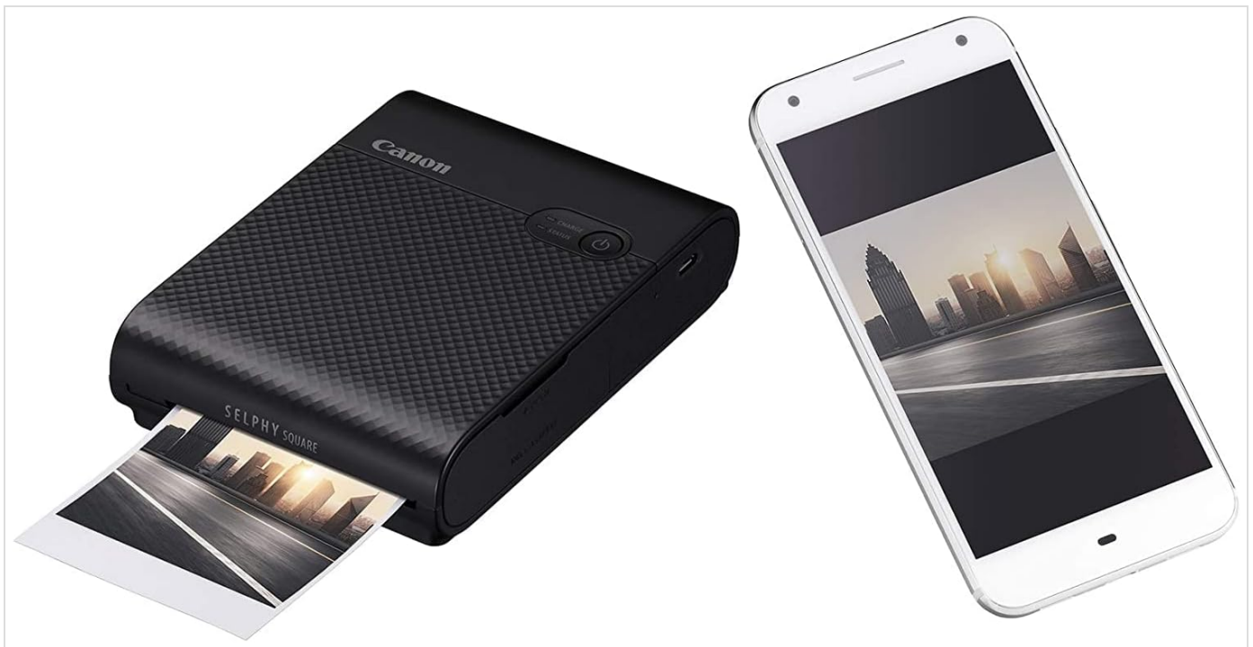
Image: The SELPHY Square QX10 printer positioned beside a smartphone, illustrating the wireless connection for printing.