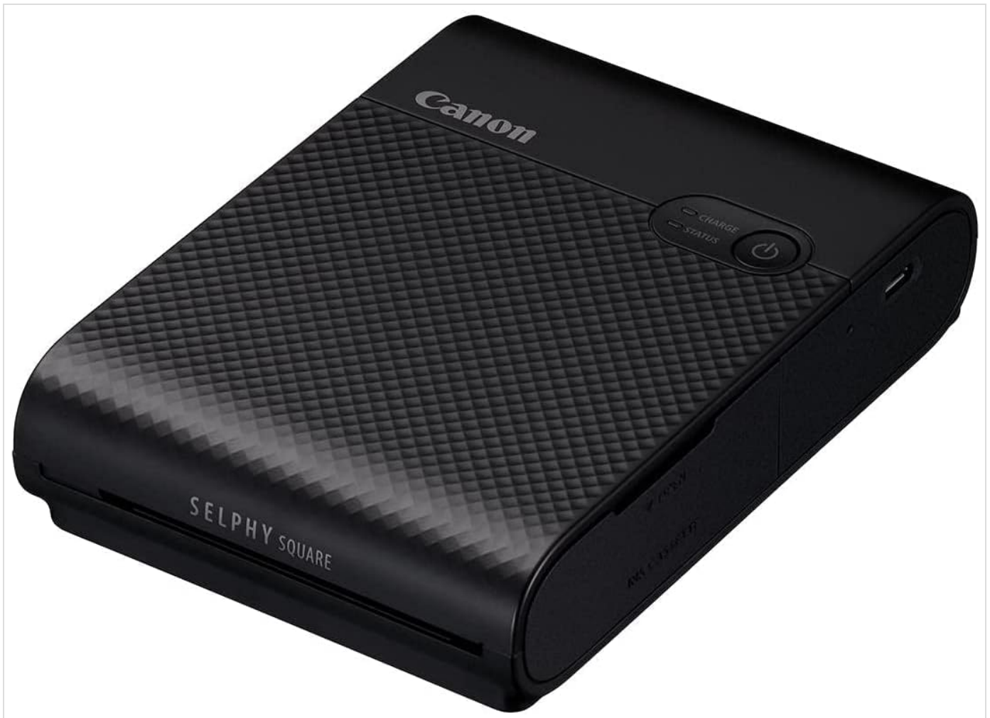
Image: An angled perspective of the SELPHY Square QX10, showcasing its sleek design and portable form factor.