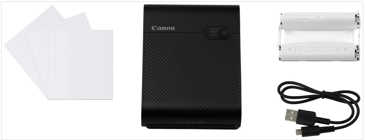
Image: The Canon SELPHY Square QX10 printer along with its included accessories: photo paper and a USB charging cable.