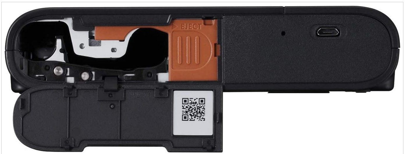
Image: Bottom view of the printer, revealing the open compartments for the ink cassette and photo paper, along with a QR code for setup.