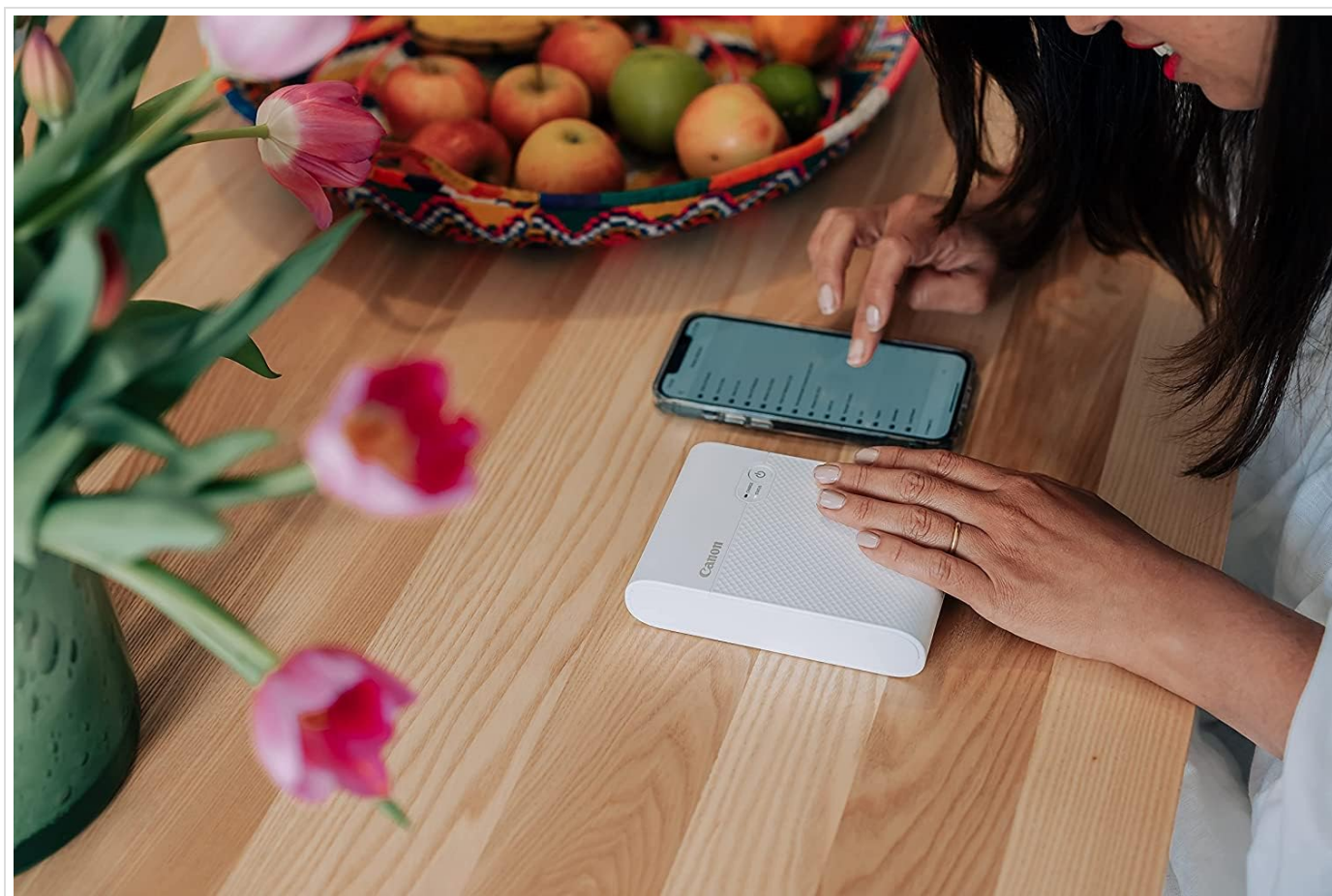
Image: A user's hands operating the SELPHY Photo Layout app on a smartphone, with the QX10 printer nearby, ready for printing.