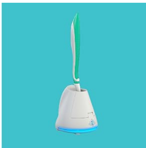
Image: The blue indicator light of the TAO Clean Germ Shield illuminates during the 4-minute sanitization cycle.