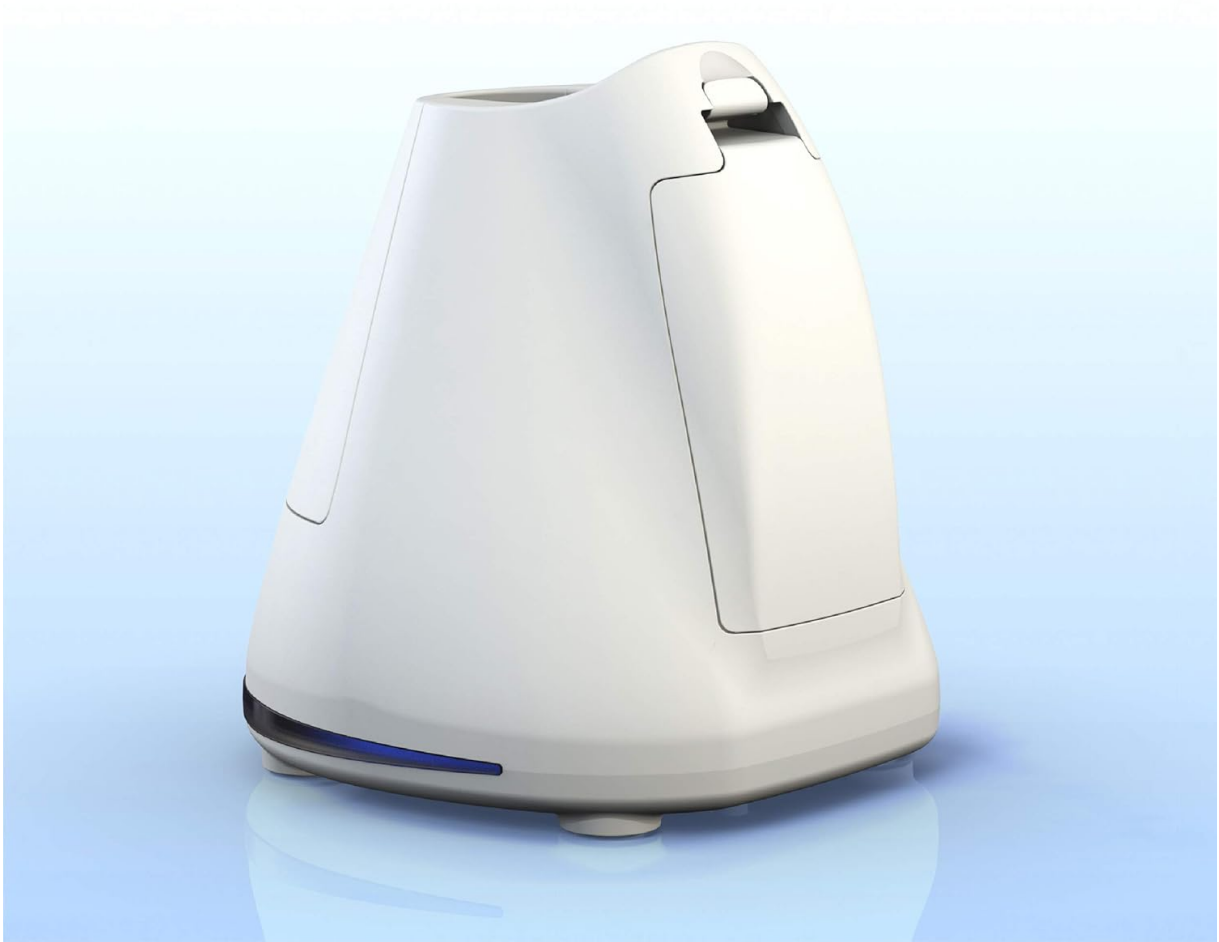
Image: Rear view of the TAO Clean Germ Shield, showing the battery compartment for 2 AA batteries.