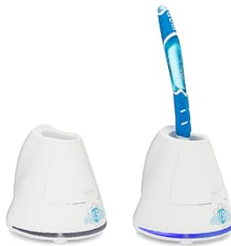
Image: The TAO Clean Germ Shield UV Toothbrush Sanitizer in operation, emitting blue UV-C light to clean a toothbrush, ensuring a superior clean.

Patented UV-C Sanitizing System • Fast 4 Minute Operation Accommodates Manual & Electric Brushes • Batteries Included • Travel Friendly