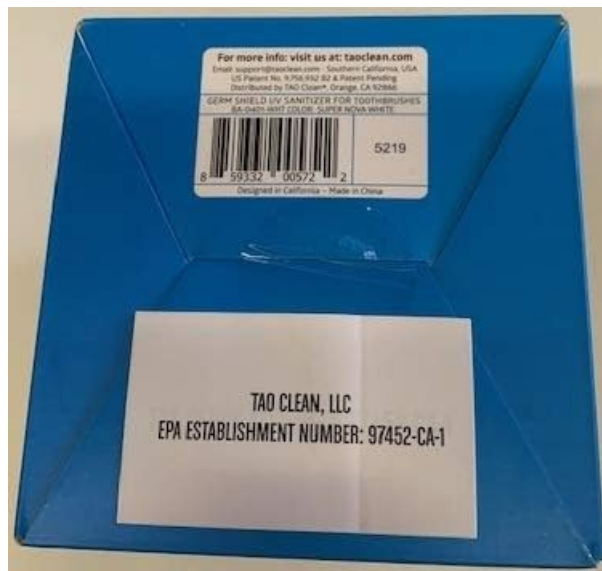
Image: Bottom of the TAO Clean Germ Shield packaging, showing contact information and UPC 0859332005722.