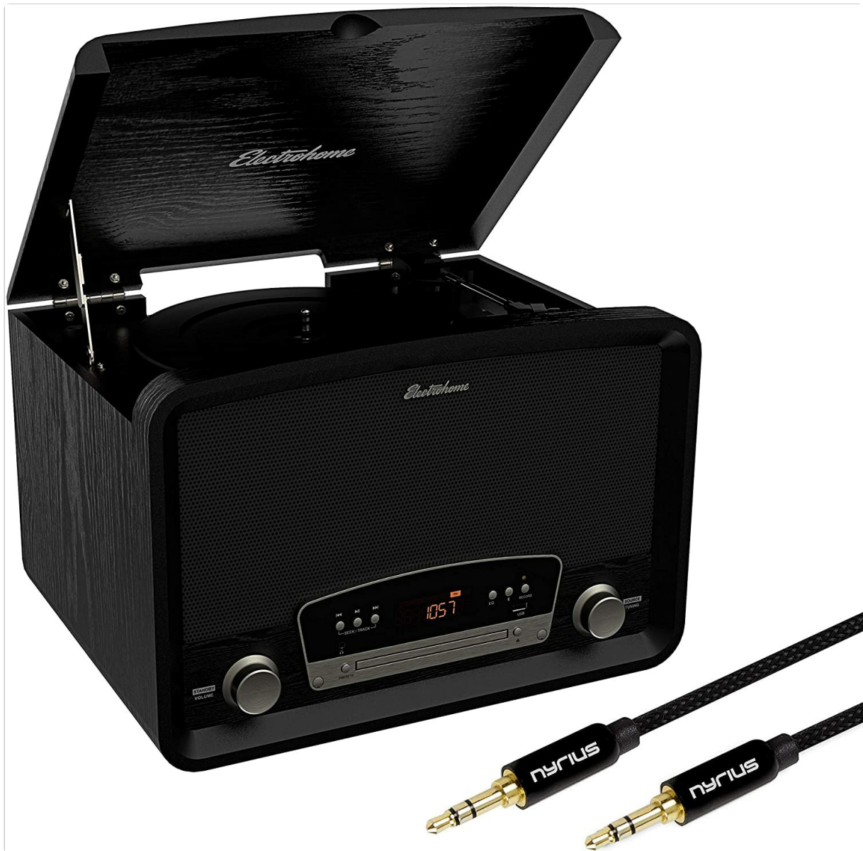
Figure 1: Electrohome Kingston RR75B 7-in-1 Vintage Vinyl Record Player Stereo System.