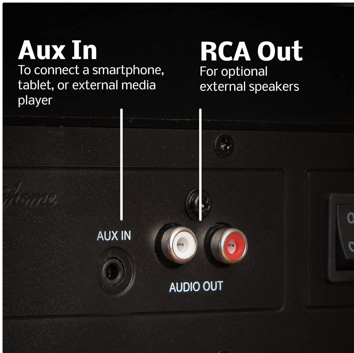
Figure 5: Auxiliary Input (Aux In) and RCA Output (Audio Out) ports.