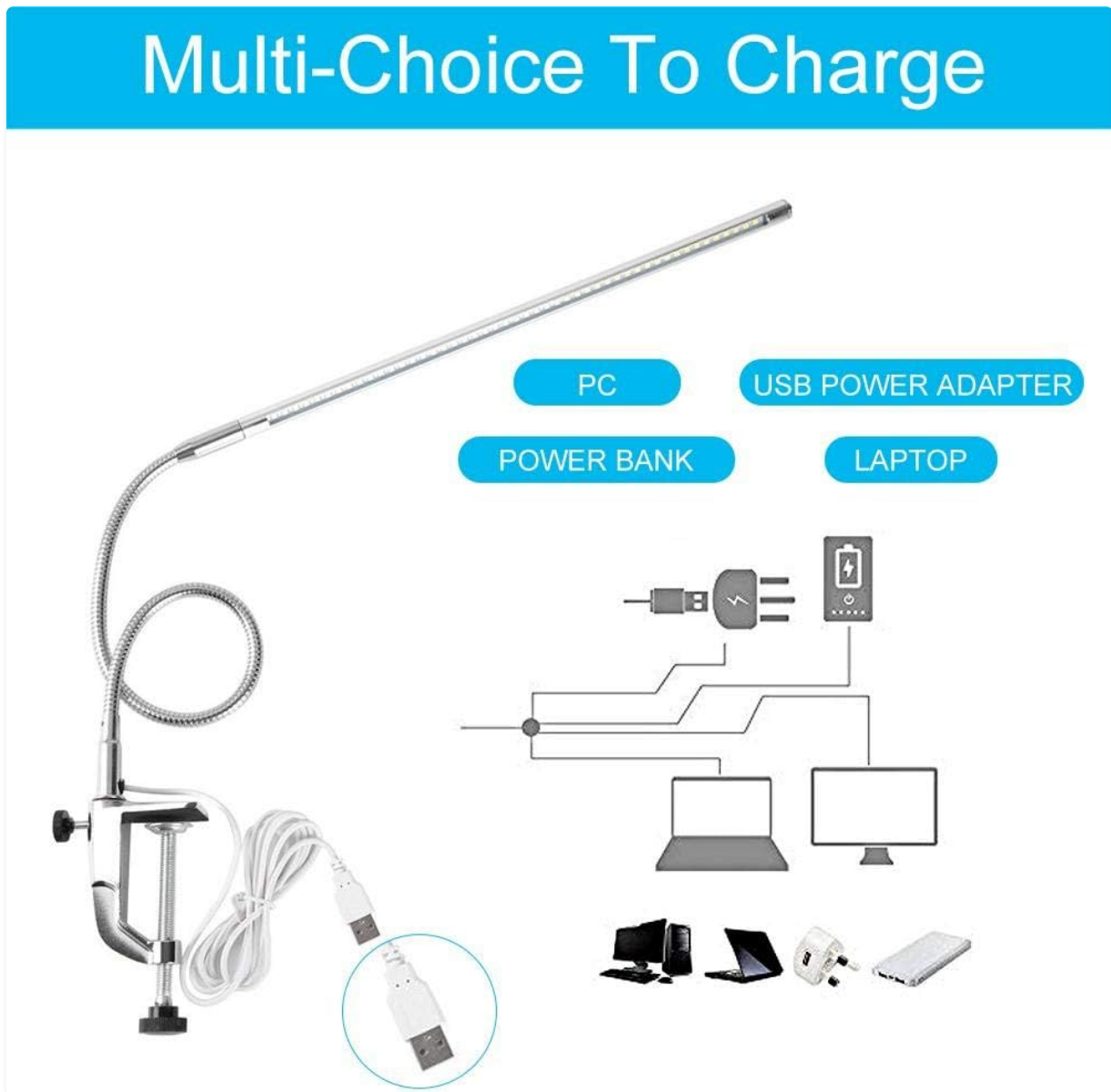
Image: Illustration of various power sources that can be used to charge or power the lamp, such as a PC, USB power adapter, power bank, and laptop, demonstrating its versatility.