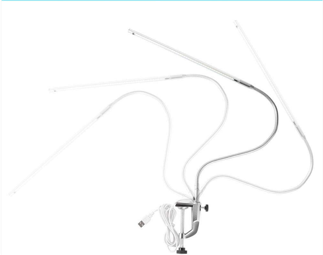
Image: The lamp's flexible gooseneck shown in multiple configurations, illustrating how it can be bent and twisted to direct light to any desired area.