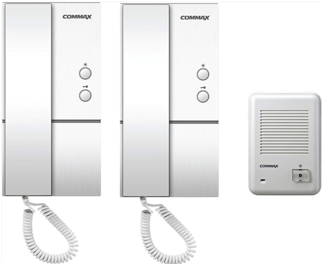
Figure 2.1: Overview of the Commax Audio Doorphones and Doorbell Set, showing the two indoor handsets and the outdoor doorbell unit.