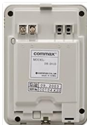
Figure 6.2: Rear view of the DR-201D doorbell unit, illustrating the terminal block for wiring connections.