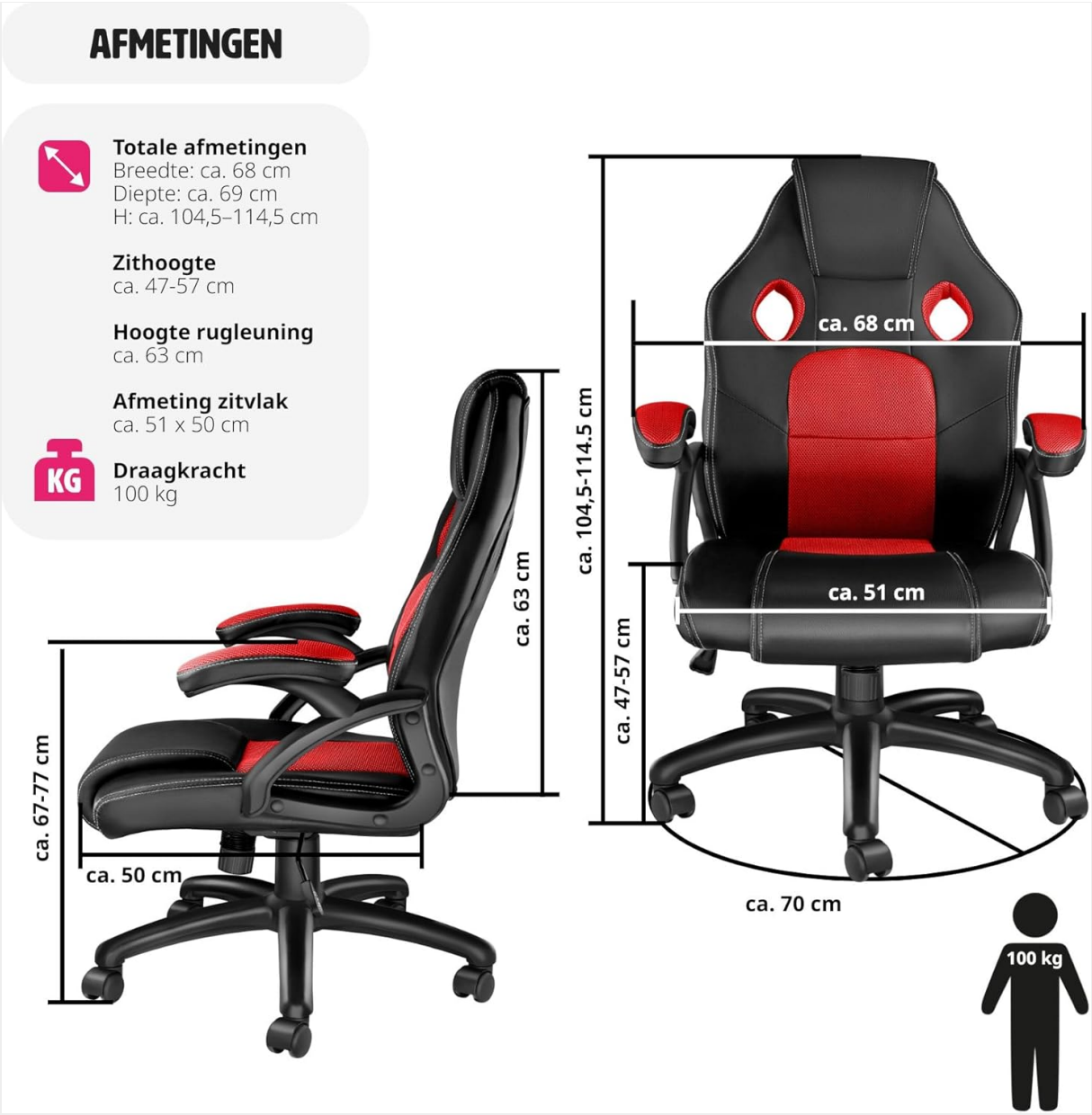
Image: Detailed diagram illustrating the dimensions of the chair, including total height, seat height, seat width, and depth.