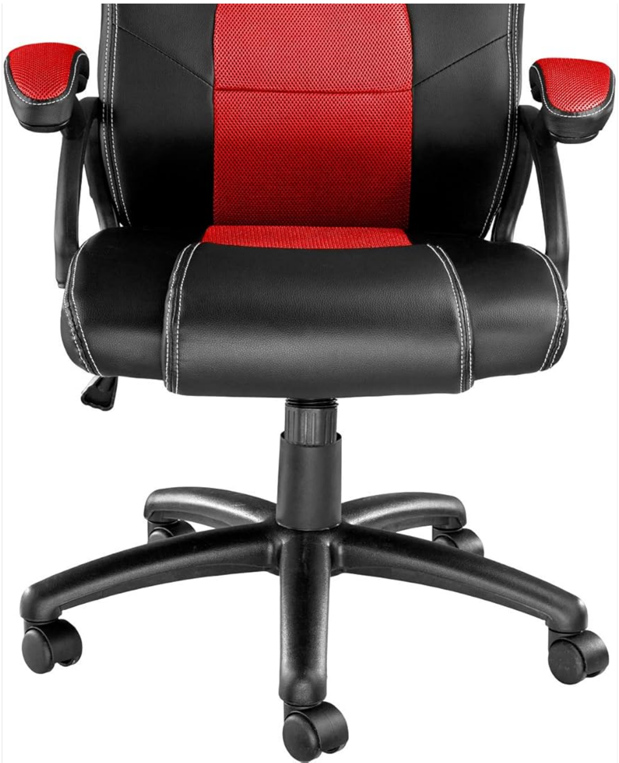
Image: Front view of the tectake Gaming Office Chair, highlighting the black and red upholstery and ergonomic shape.