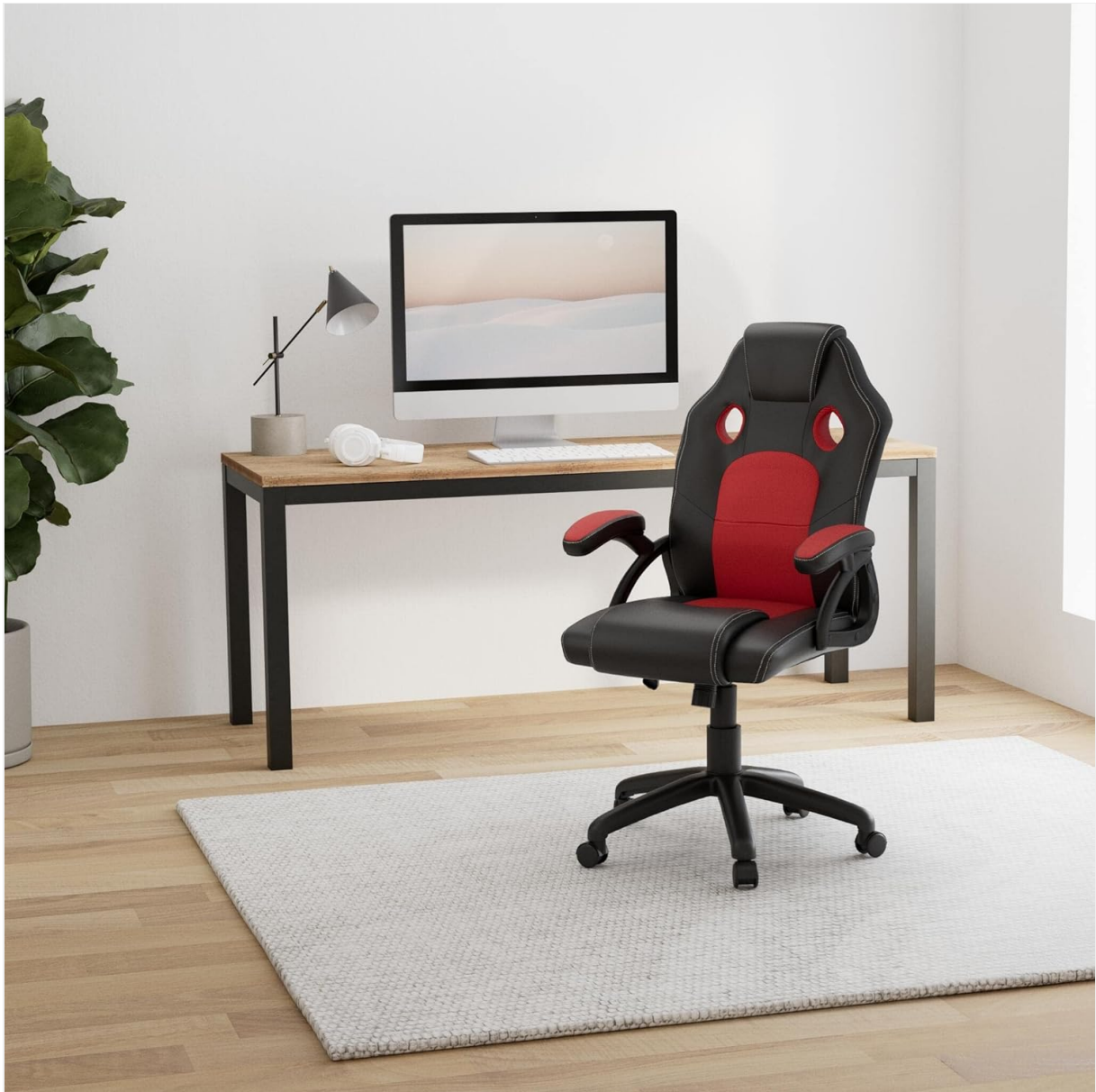
Image: The tectake Gaming Office Chair (black and red) positioned in a contemporary office environment with a desk and computer.