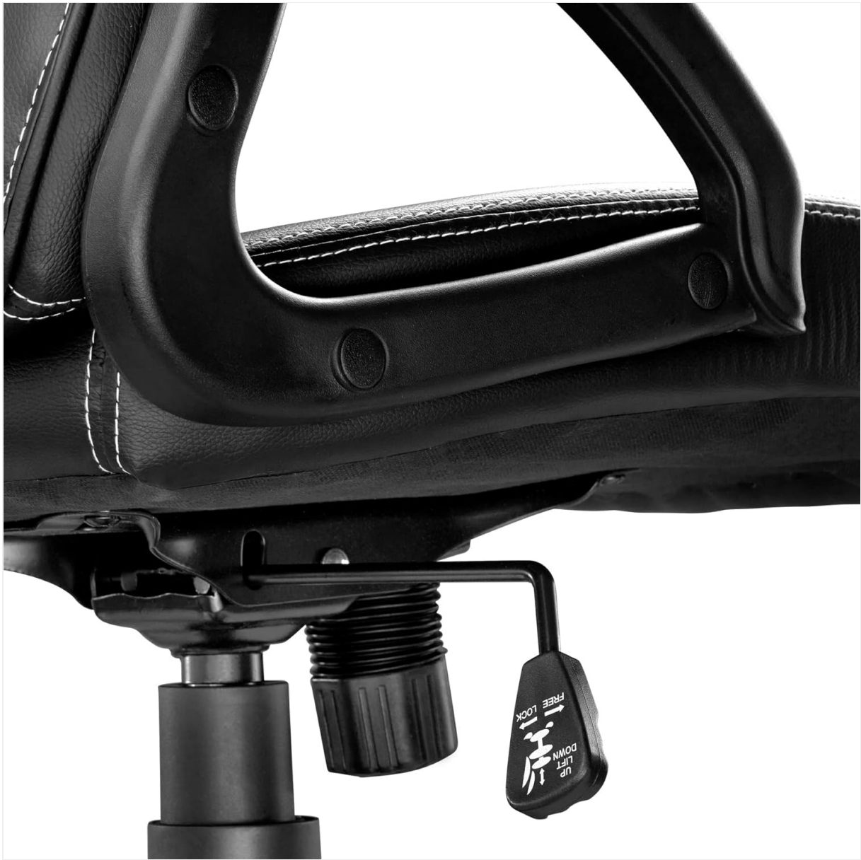
Image: Close-up view of the height adjustment and tilt lock lever located under the seat.