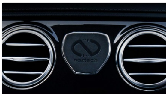
Image 5.2: Versatile Mounting Locations. The holder can be used in cars, kitchens, offices, and more.