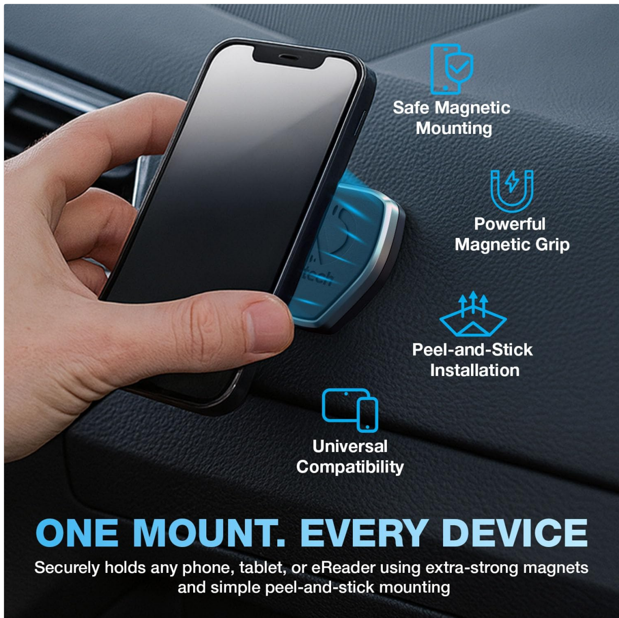
Image 5.1: Device Attached in a Vehicle. The mount provides hands-free access while driving.