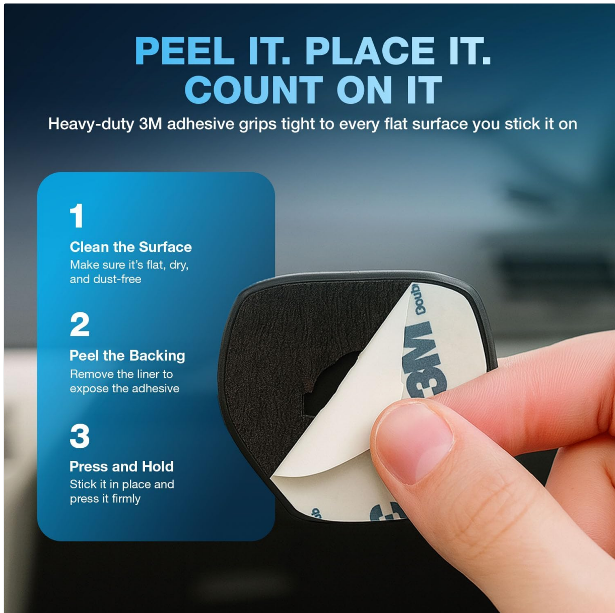
Image 4.1: Peel-and-Stick Installation Steps. Follow these steps for secure mounting.