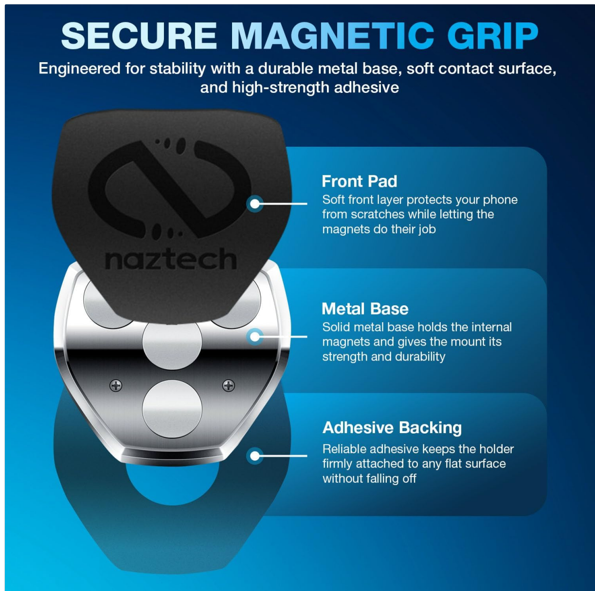
Image 2.1: Components of the Magnetic Phone Holder. The mount consists of a soft front pad, a metal base, and an adhesive backing.