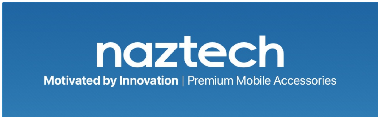
Image 1.1: Naztech Magnetic Phone Holders. These mounts provide a secure hold for your device.

This manual provides instructions for the proper installation, operation, and maintenance of your Naztech Magnetic Phone Holder, model it-Cable-23h-760. This universal magnetic mount is designed to securely hold various mobile devices on flat surfaces.