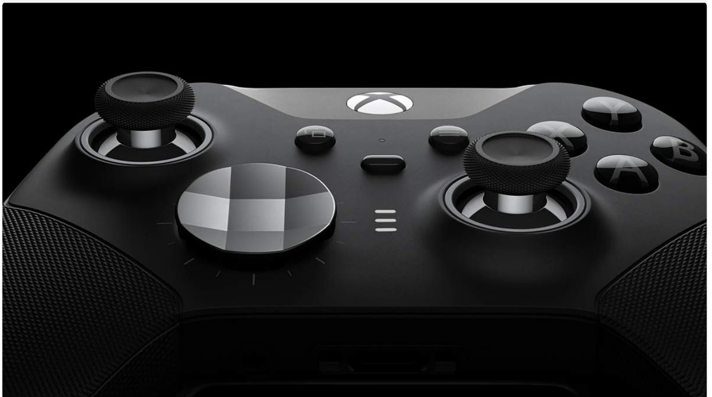
Thumbstick set to high tension.