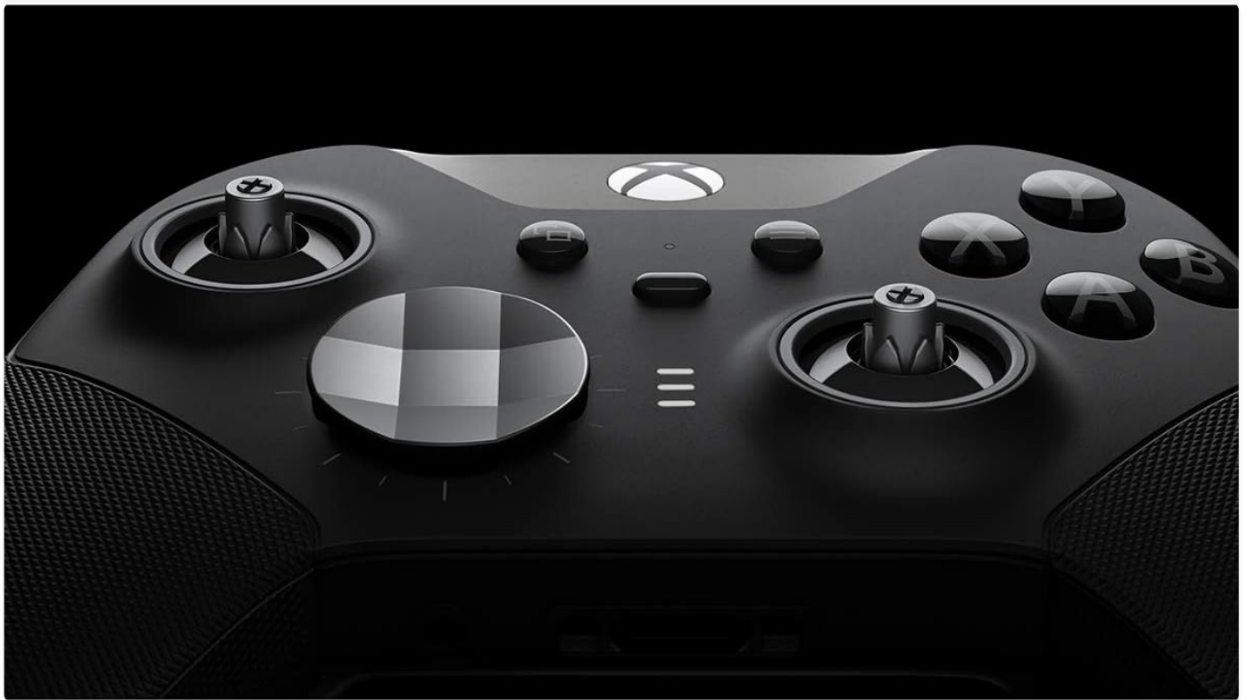
Thumbstick set to medium tension.