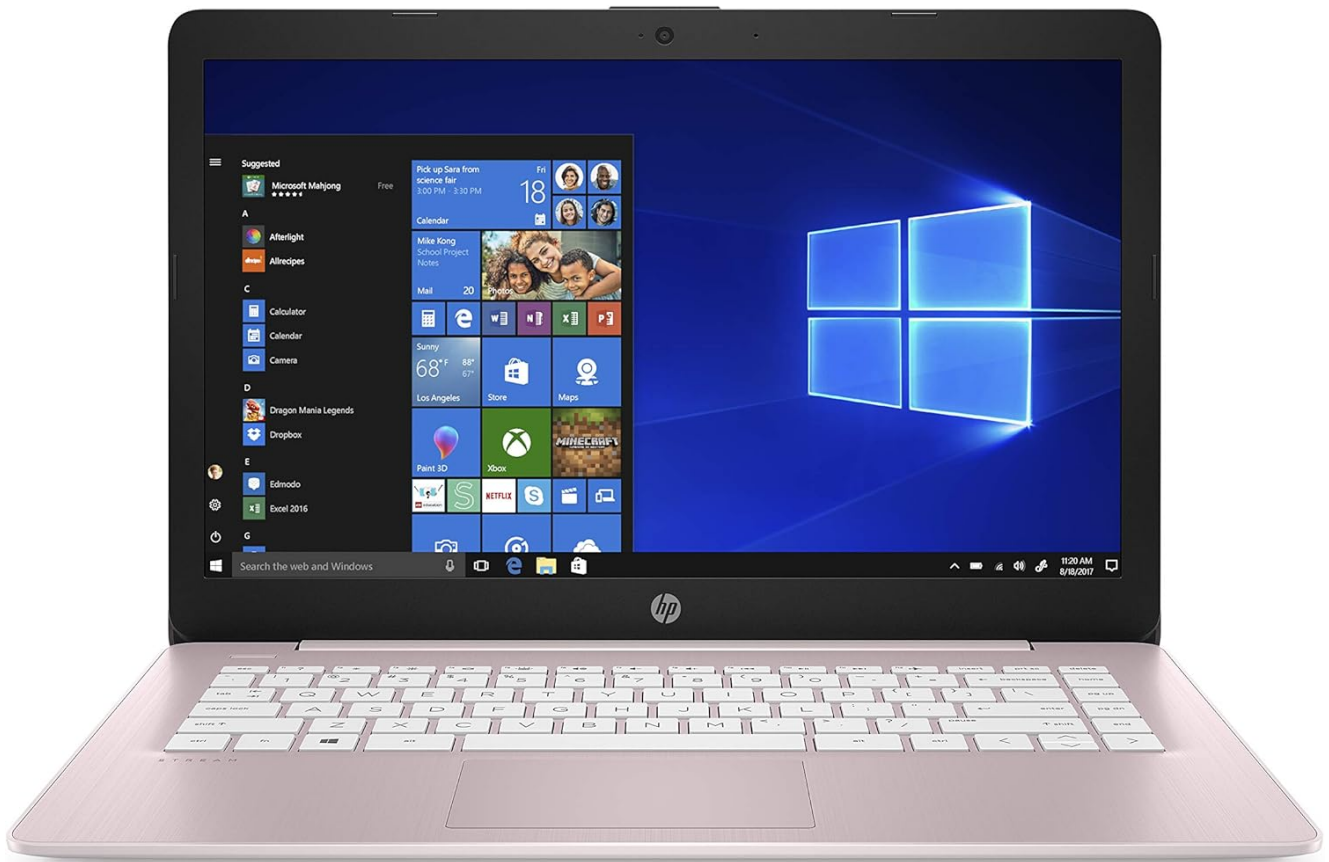
Figure 1: HP Stream 14-inch Laptop in Rose Pink

The HP Stream 14-Inch Laptop is designed for users seeking a portable and efficient computing experience. It is ideal for tasks such as homework, streaming media, and general productivity. This manual provides essential information for setting up, operating, maintaining, and troubleshooting your device.