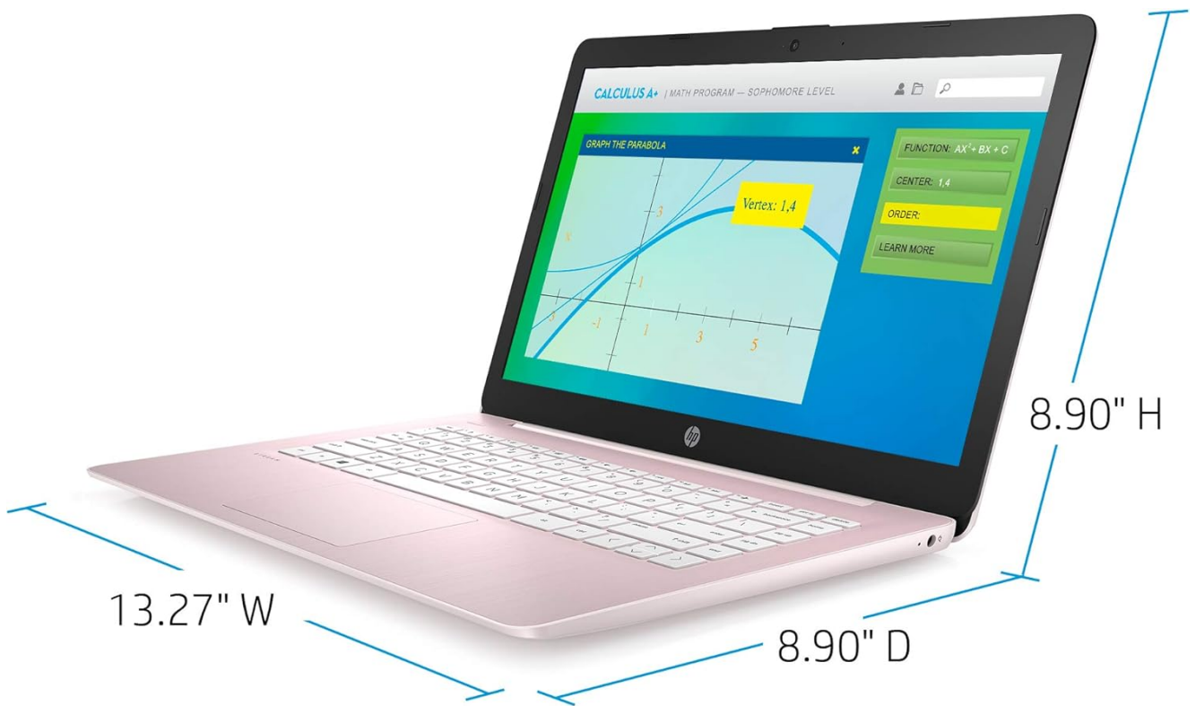
Figure 6: Laptop dimensions and port layout